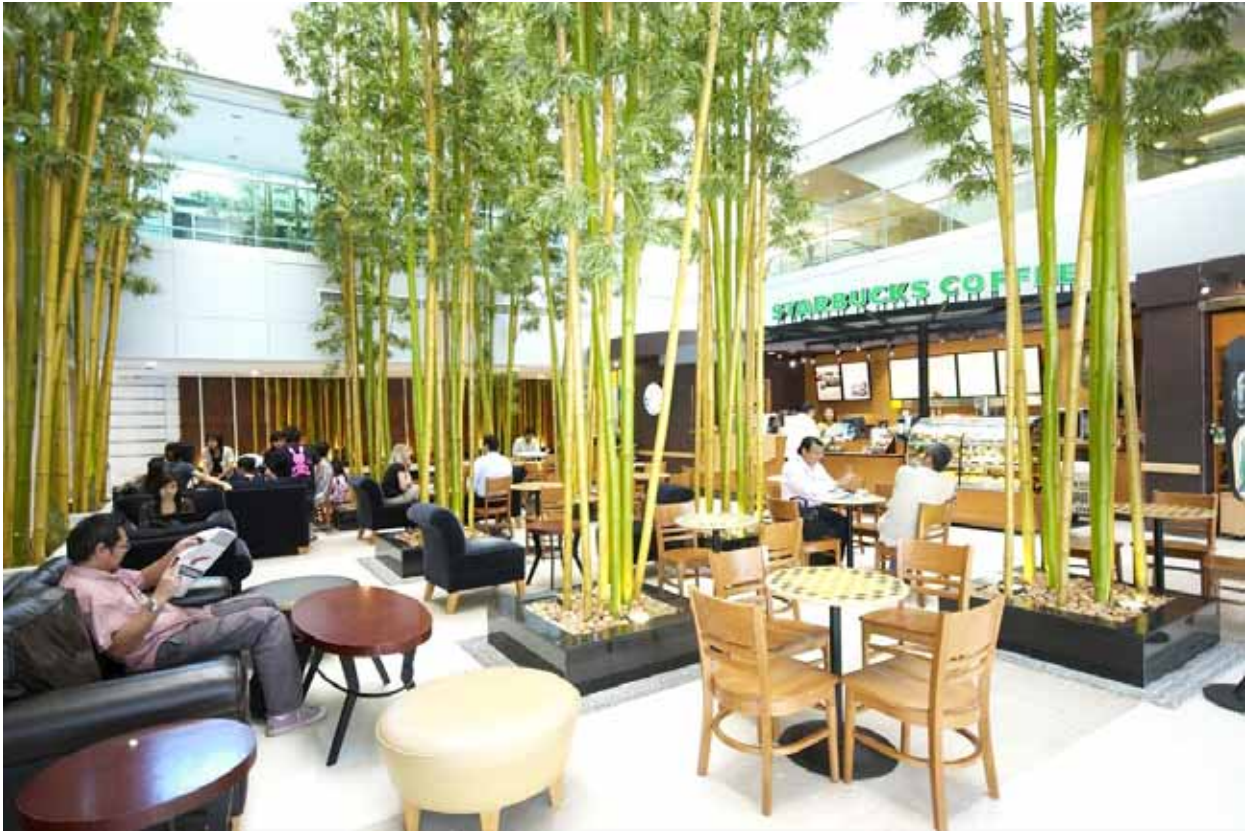
There is a Starbucks on the premises for patients and visitors to take a break.