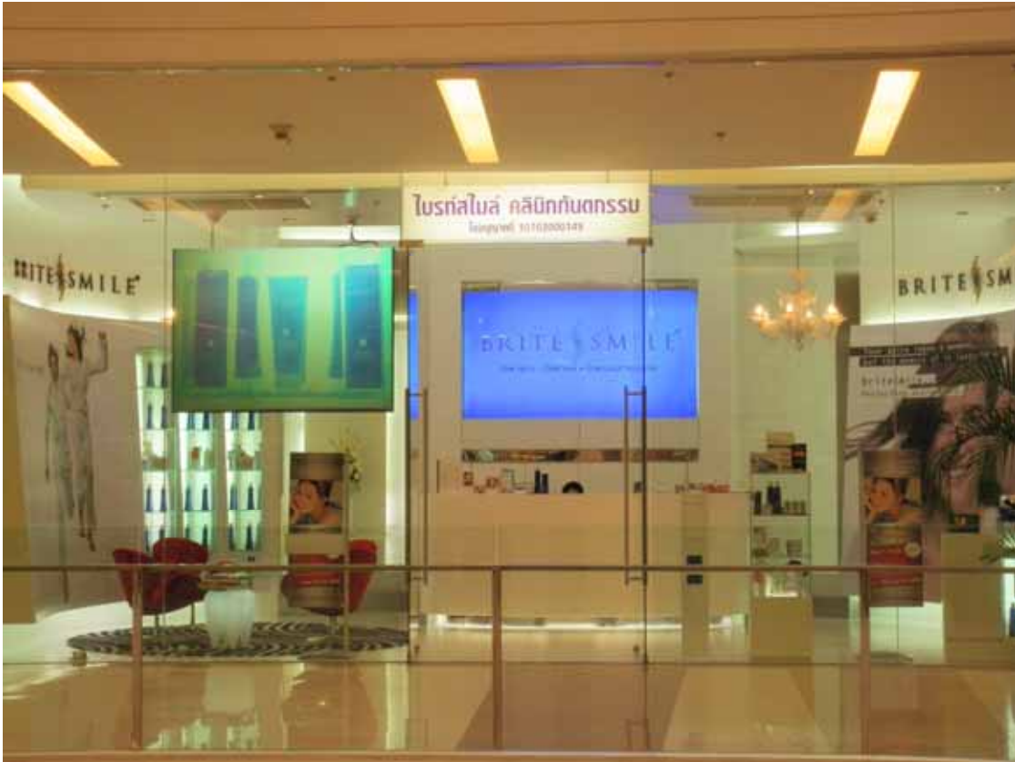
The Siam Paragon branch, located in the Beauty Zone on the 2nd floor of Siam Paragon. The interior is ultra-modern and futuristic, with individual plasma entertainment screens and recliner chairs for clients.