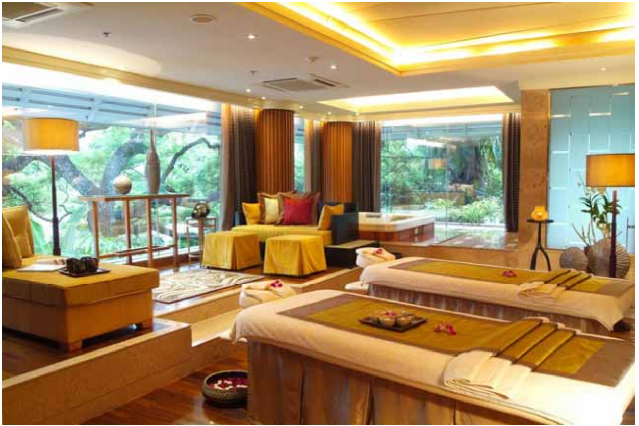
The Spa Suite overlooks the Nai Lert Park Hotel's tropical gardens. The grey vases on the far right are from well-known Thai ceramics brand Dhanabadee which specializes in nature themes (image below).