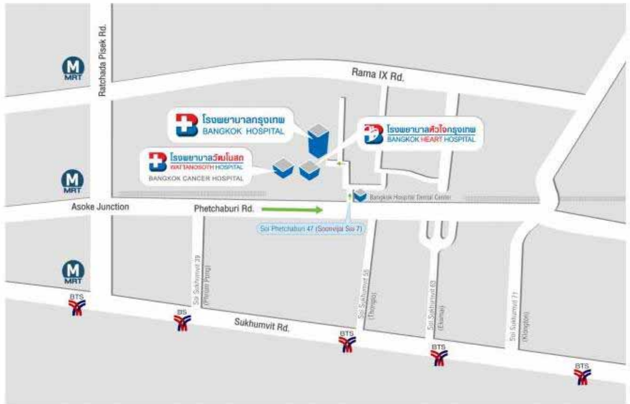
Centrally located near the Sukhumvit area of Bangkok.