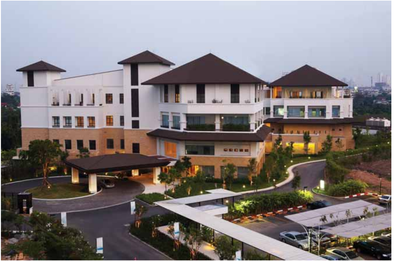
The building in which TRIA is housed.