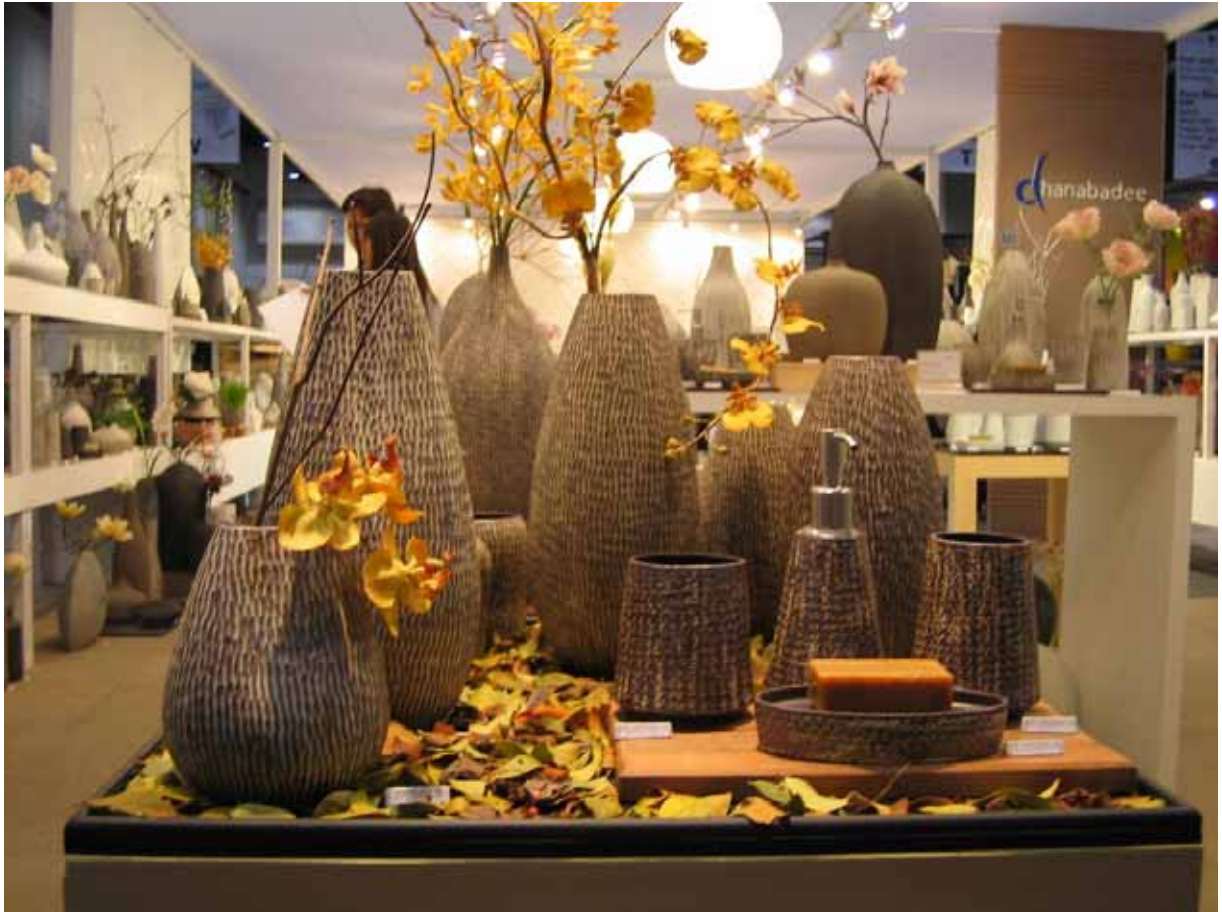
The Dhanabadee ceramics collection, popular among spas and resorts.