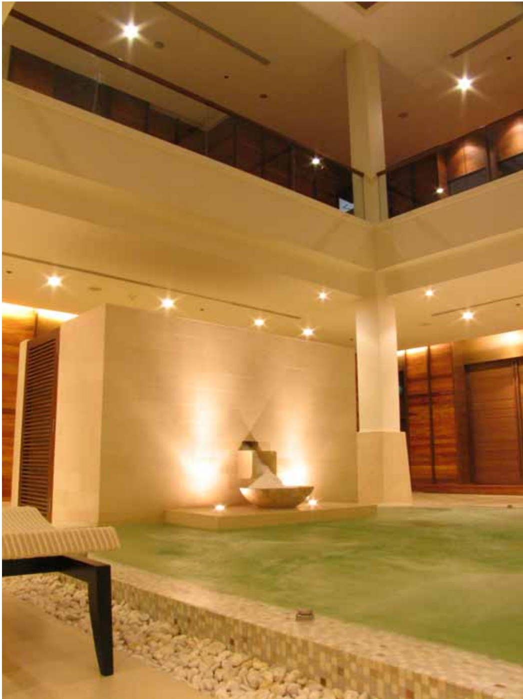
TRIA's clients can take a dip in the vitality pool before or after treatments.