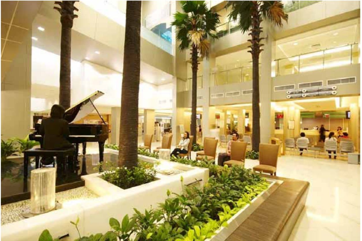
Patients are treated to live piano music while they wait.