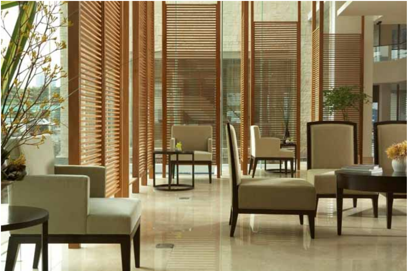
The lobby area.