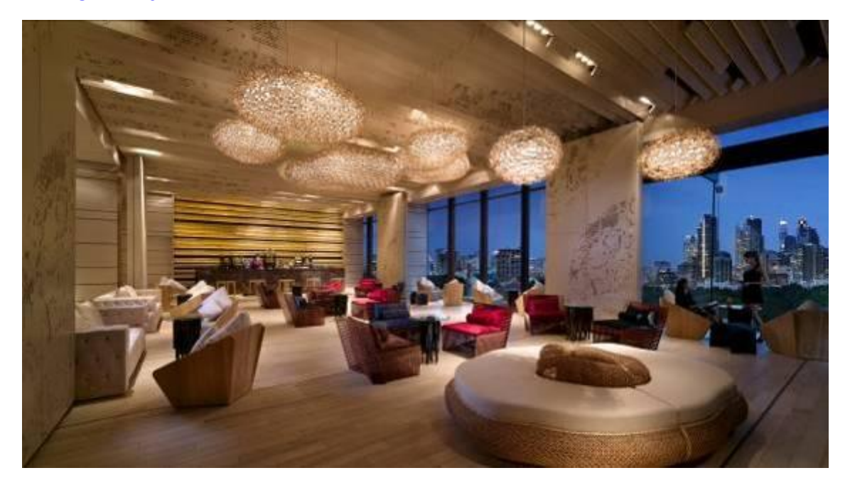
Park lobby. Rujiraporn Wanglee of PIA Interior designed the restaurants, function rooms, Lobby, So SPA and So FIT.