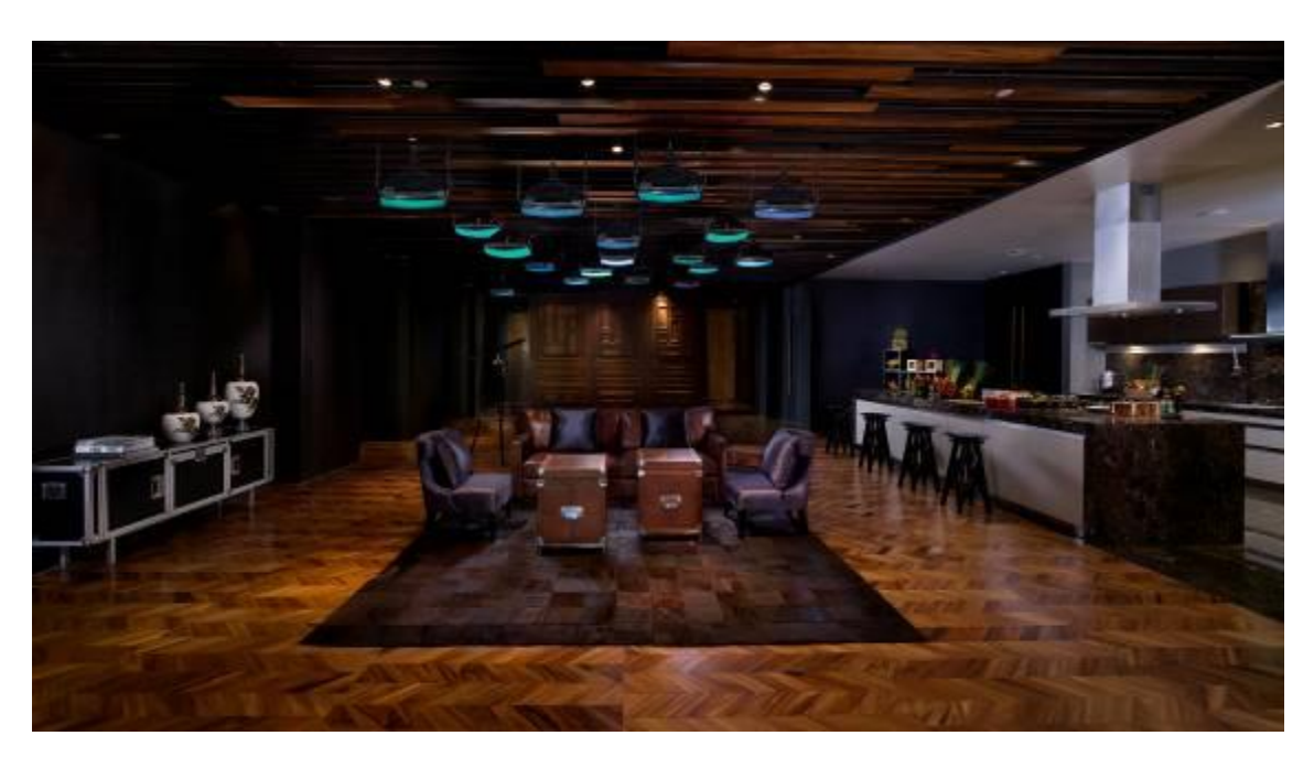
The "Social Club" meeting facilities offer a pre-function area for the social rooms and feature an open-kitchen for live cooking and refreshments.