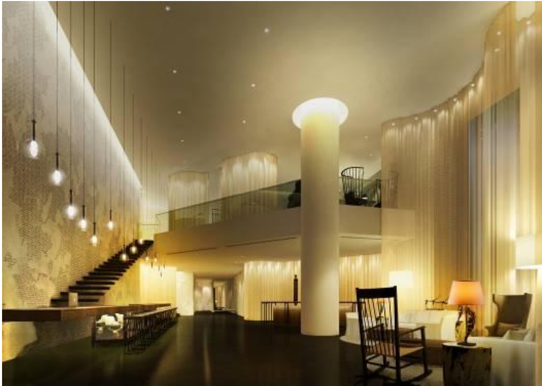
Lobby. The hallmark of the newly launched hotel is its cool and contemporary design.