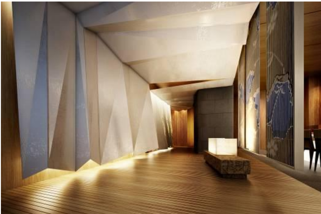
Entrance way to Yamazato restaurant, the Okura's signature restaurant.