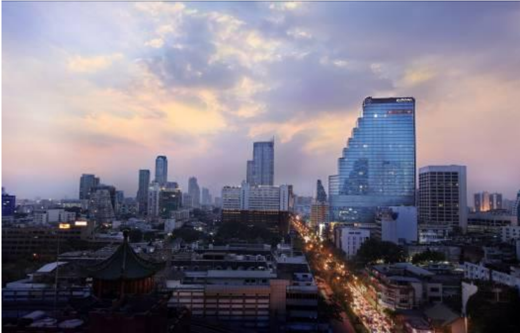
Exterior of the 30-storey hotel.