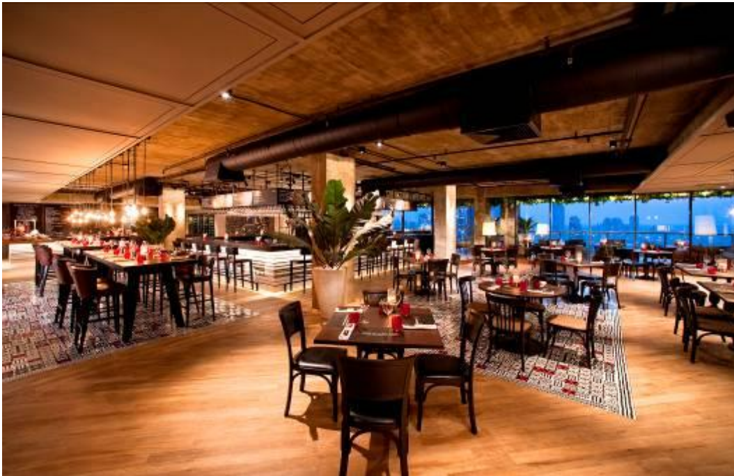
The hotel's signature restaurant Scarlett Wine Bar & Restaurant on the 37th floor.