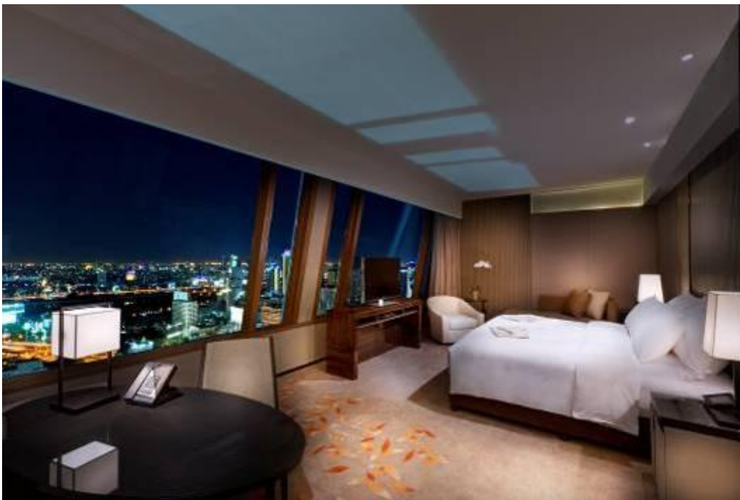
Night shot of Prestige Club room.