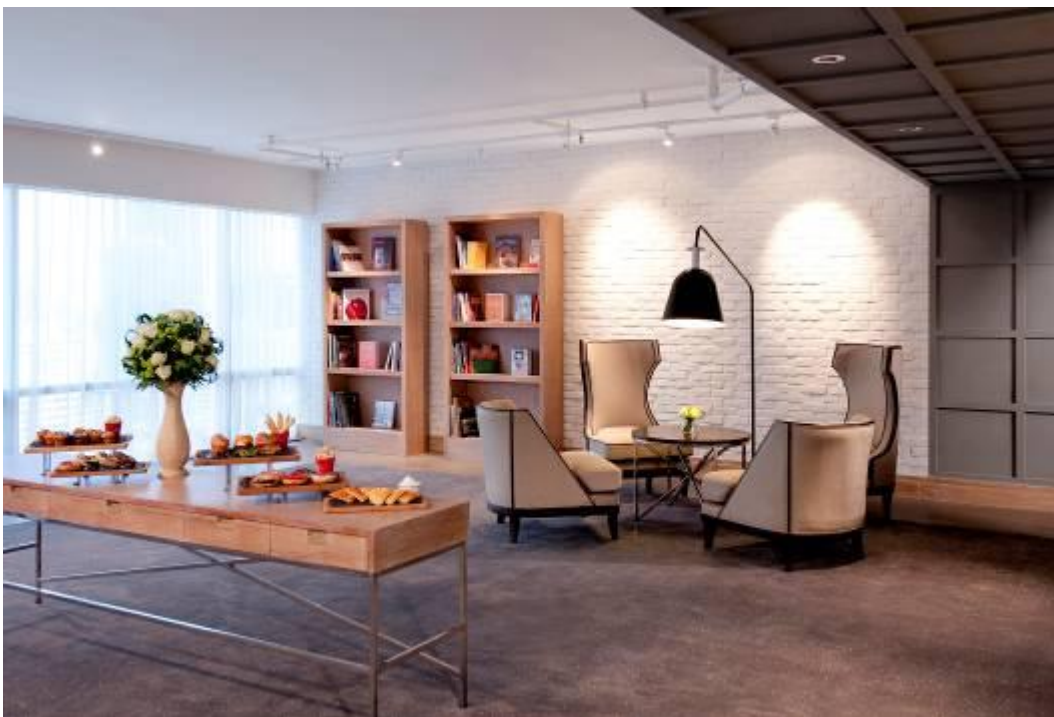
The Library foyer.