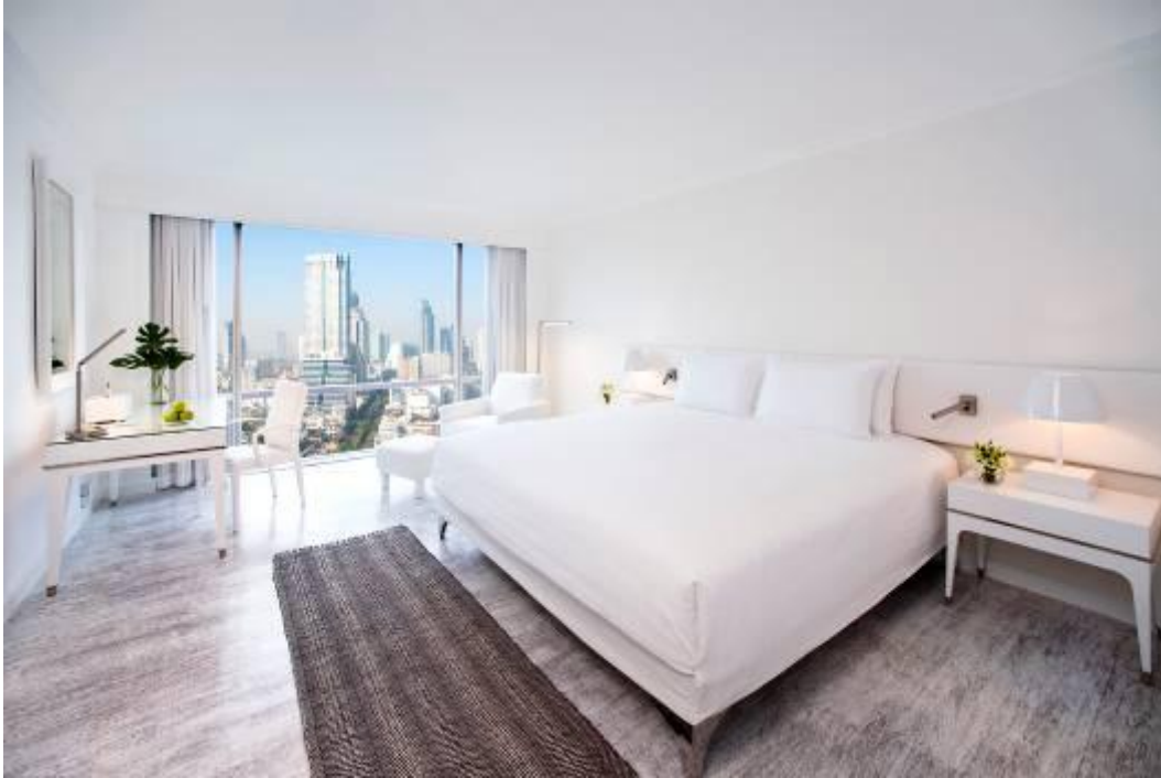
Deluxe room. All rooms have been refurbished with a boutique décor style.