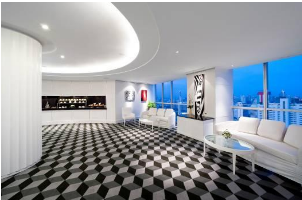
The Gallery foyer