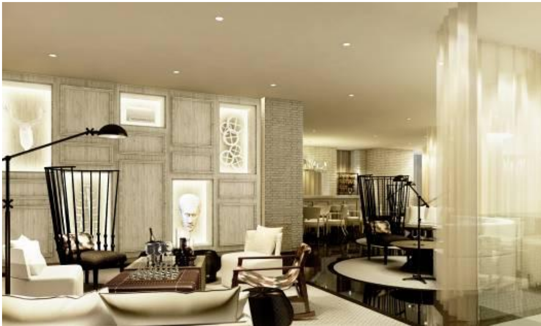
Playground, an interactive mixology and bubbles bar, is situated in the hotel's stylish lobby.