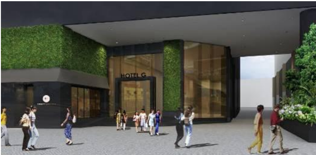
Part of the revamp included a new façade.