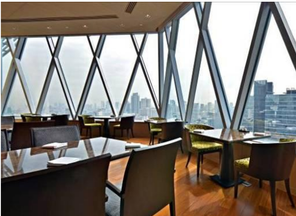
Yamazato restaurant on 24 th floor with view of the Bangkok skyline.