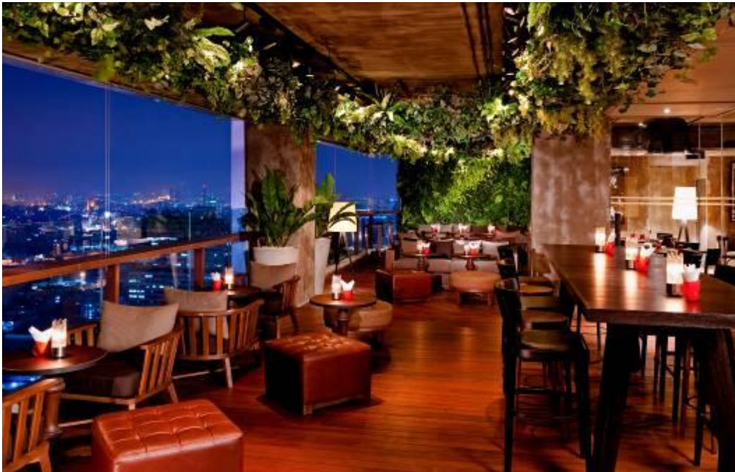
Outdoor terrace of Scarlett restaurant & bar.