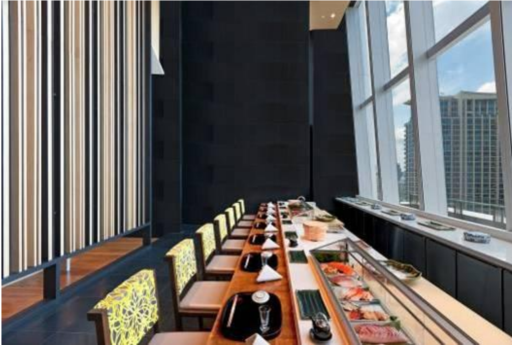
Sushi counter of Yamazato restaurant.