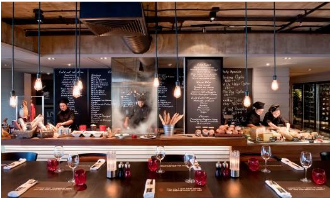
Scarlett restaurant's open kitchen.