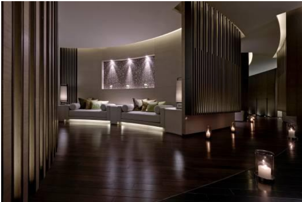
The stylish hotel spa.