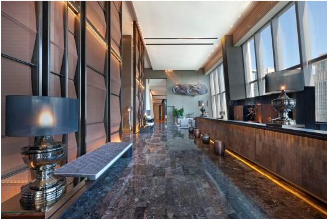
Main lobby and reception area on the 24 th floor.