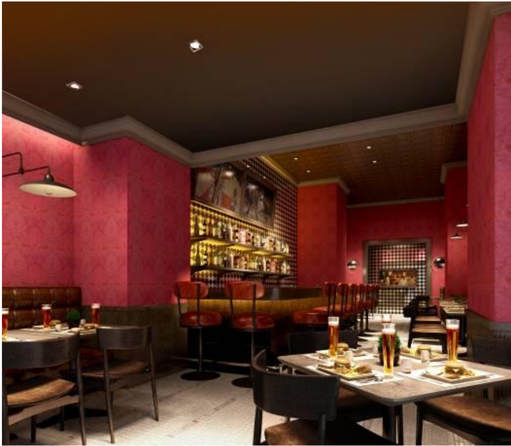
25 Degrees, a burger joint concept restaurant brought to Thailand from Los Angeles.