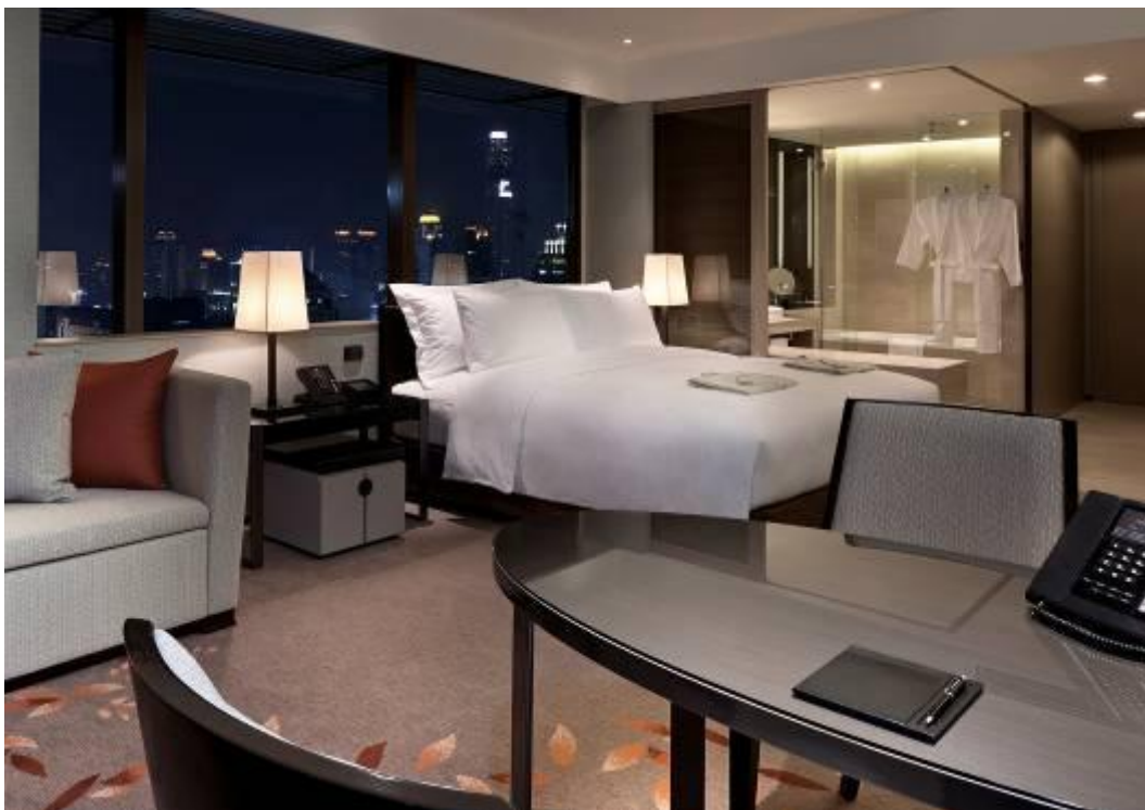
Deluxe corner room.