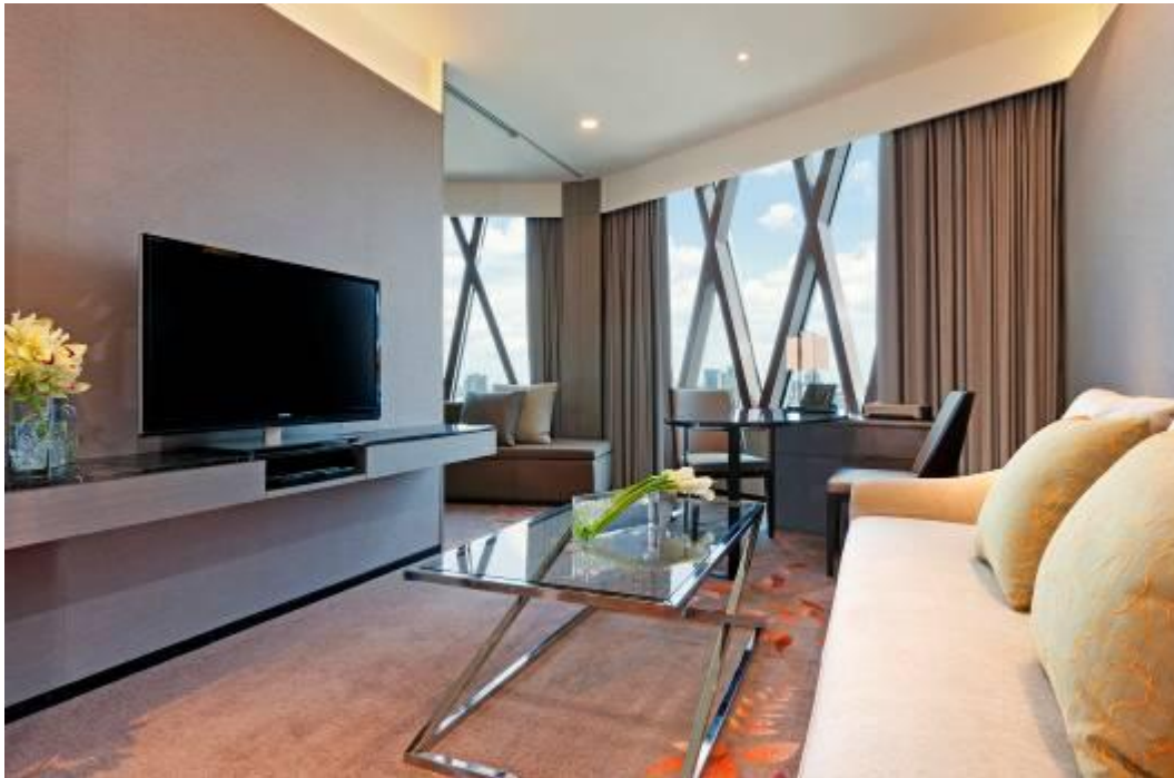
Living room of Deluxe Suite.