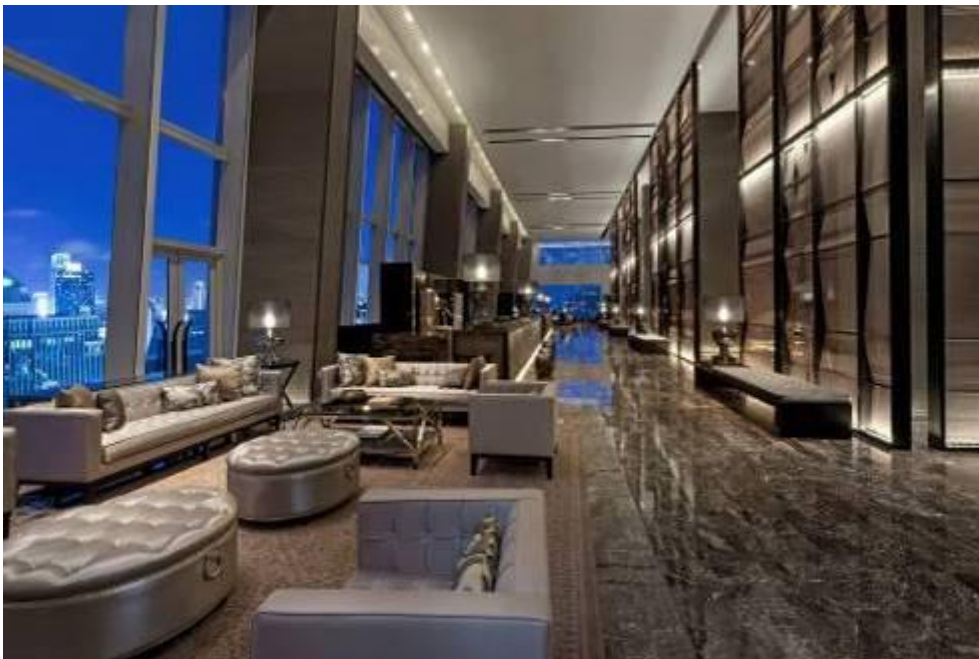
Night shot of man lobby and reception area. The interior embraces an Asian design that harmonizes Japanese and Thai cultures.