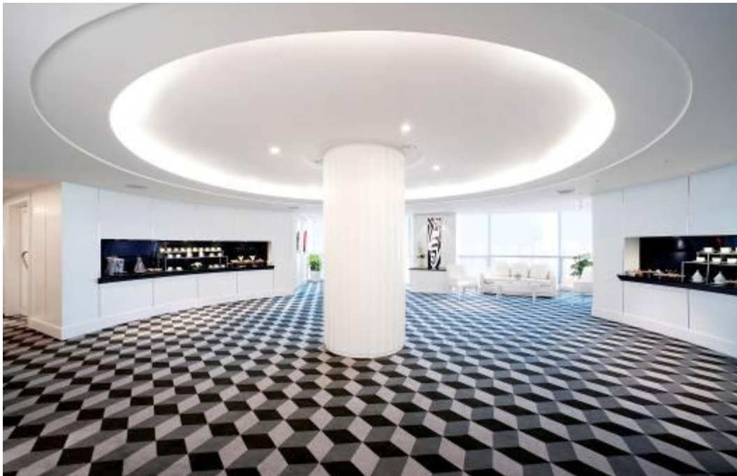
The Gallery foyer.