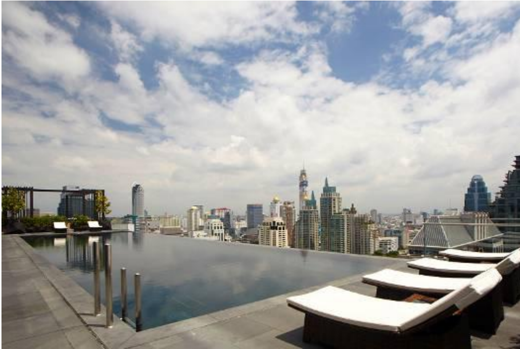
A spectacular design feature is the 25-meter-long infinity pool on the 25 th floor.