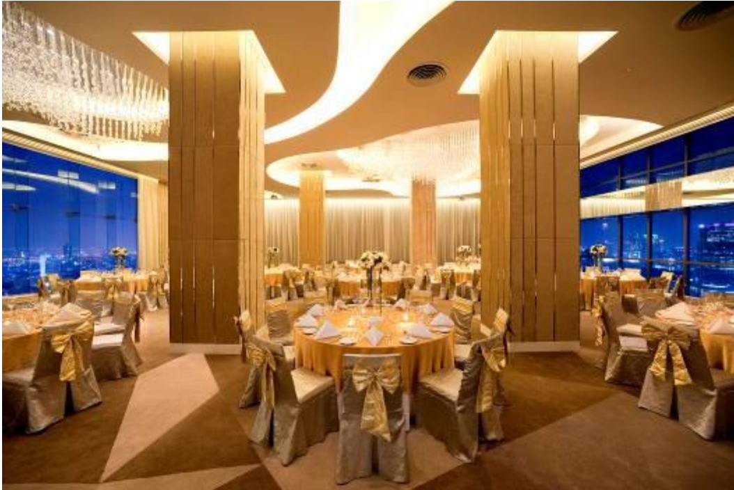
The 38 th floor underwent a major transformation into a ballroom.