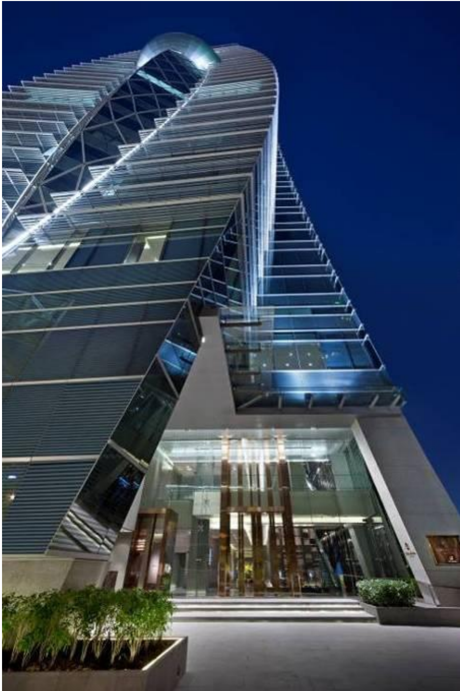
The glass entrance doors to the hotel.