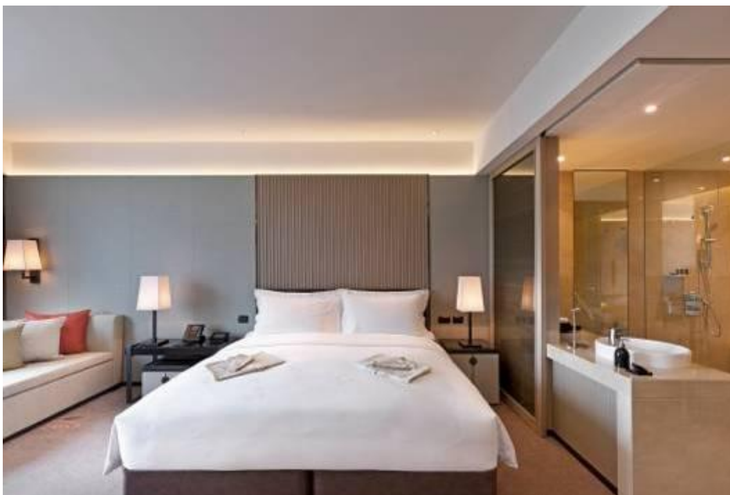
Deluxe King room.