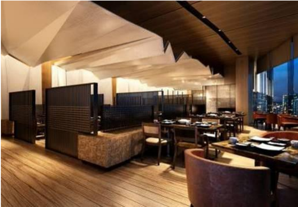
Yamazato restaurant has a stylish modern décor with an authentic Japanese ambiance. It serves kaiseki ryōri style cuisine.