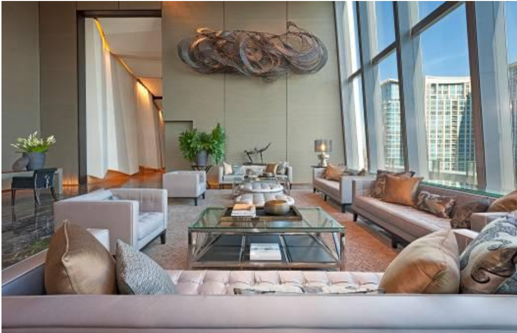
Main lobby and reception area, with to the left the entrance to Yamazato restaurant.