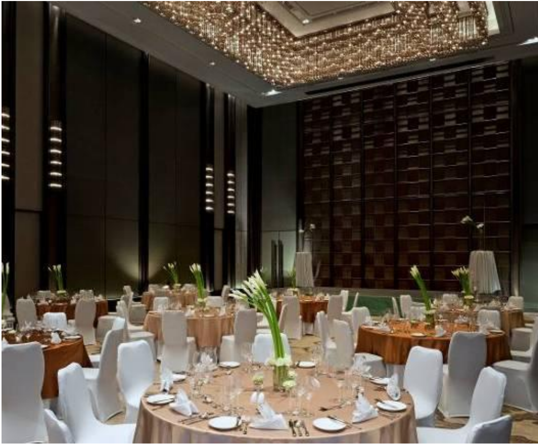
The grand ballroom on the 3 rd floor.