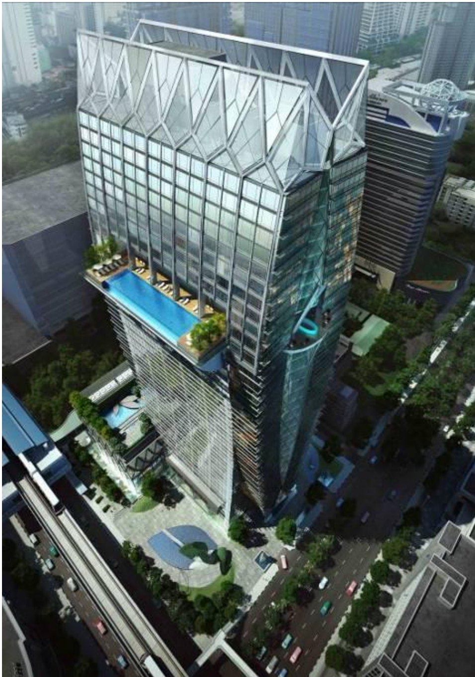
Precariously balanced on the side of the building on the 25th floor is a 25-meter infinity pool.