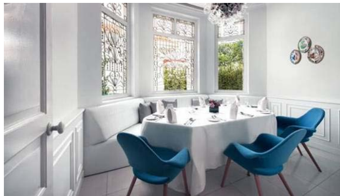
The splashes of blue liven up the predominantly white, colonial ambiance.