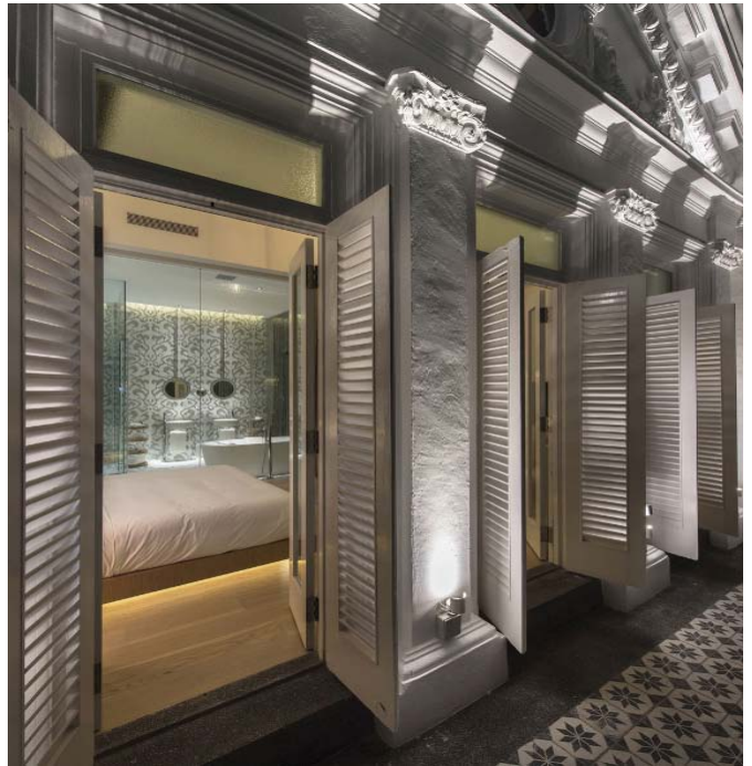
Many of the building's heritage aspects and original elements were preserved.