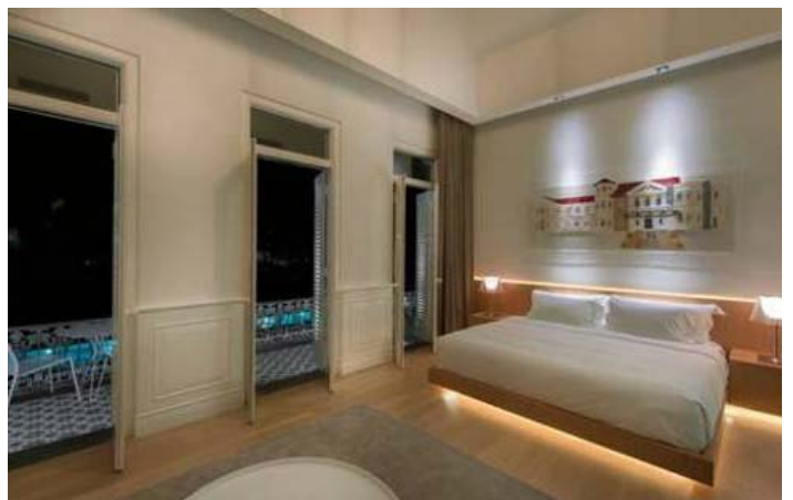
Modern, clean lines dominate the guestrooms but with a colonial touch as seen in the blue/white tiling on the balcony.