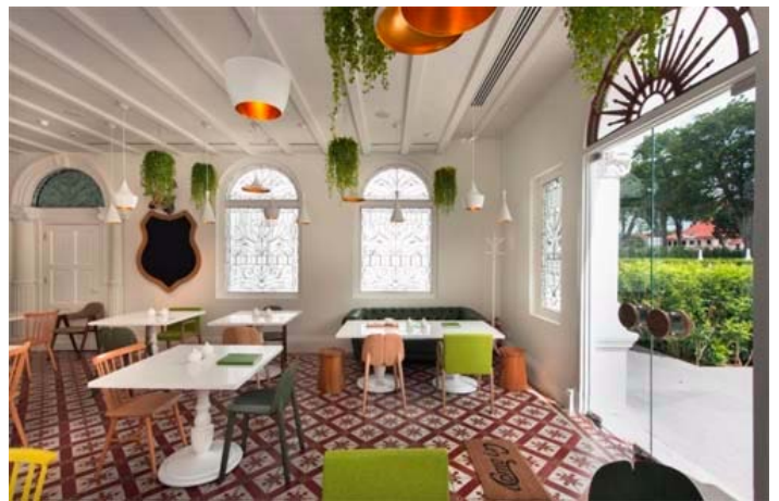
The dining room is a good example of how the designer has married Penang's colonial past with its colorful present.