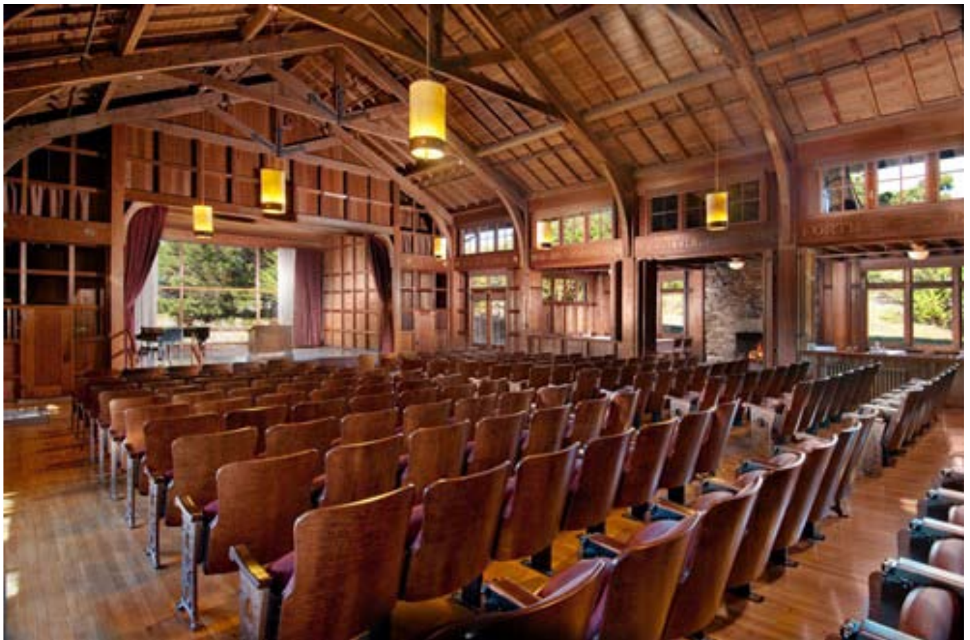
Asilomar Conference Grounds – View of Dodge Chapel Auditorium