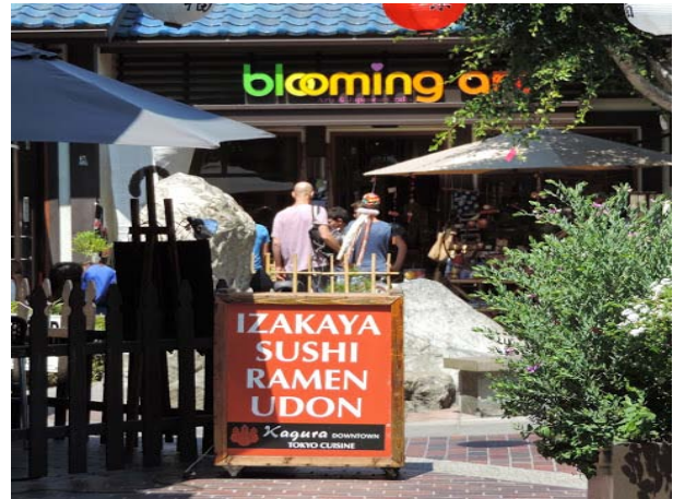
Colorful parking space building and local Izakawa with ramen and udon menu.