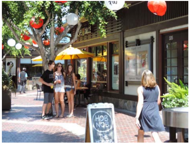
View of the Yagura tower from the Village Plaza and Café Dolce bakery with tourists.