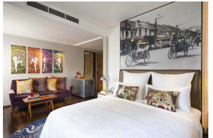
Guestrooms feature locally inspired artwork.