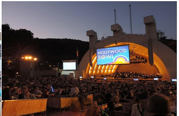
View during the day and at night of the 8x10 flat screens on both sides of the amphitheater and the 10x24 center super screen set up for the special representations.