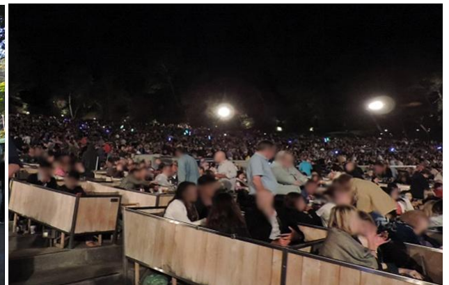
People dressed casually to enjoy a concert in a friendly atmosphere on summer nights