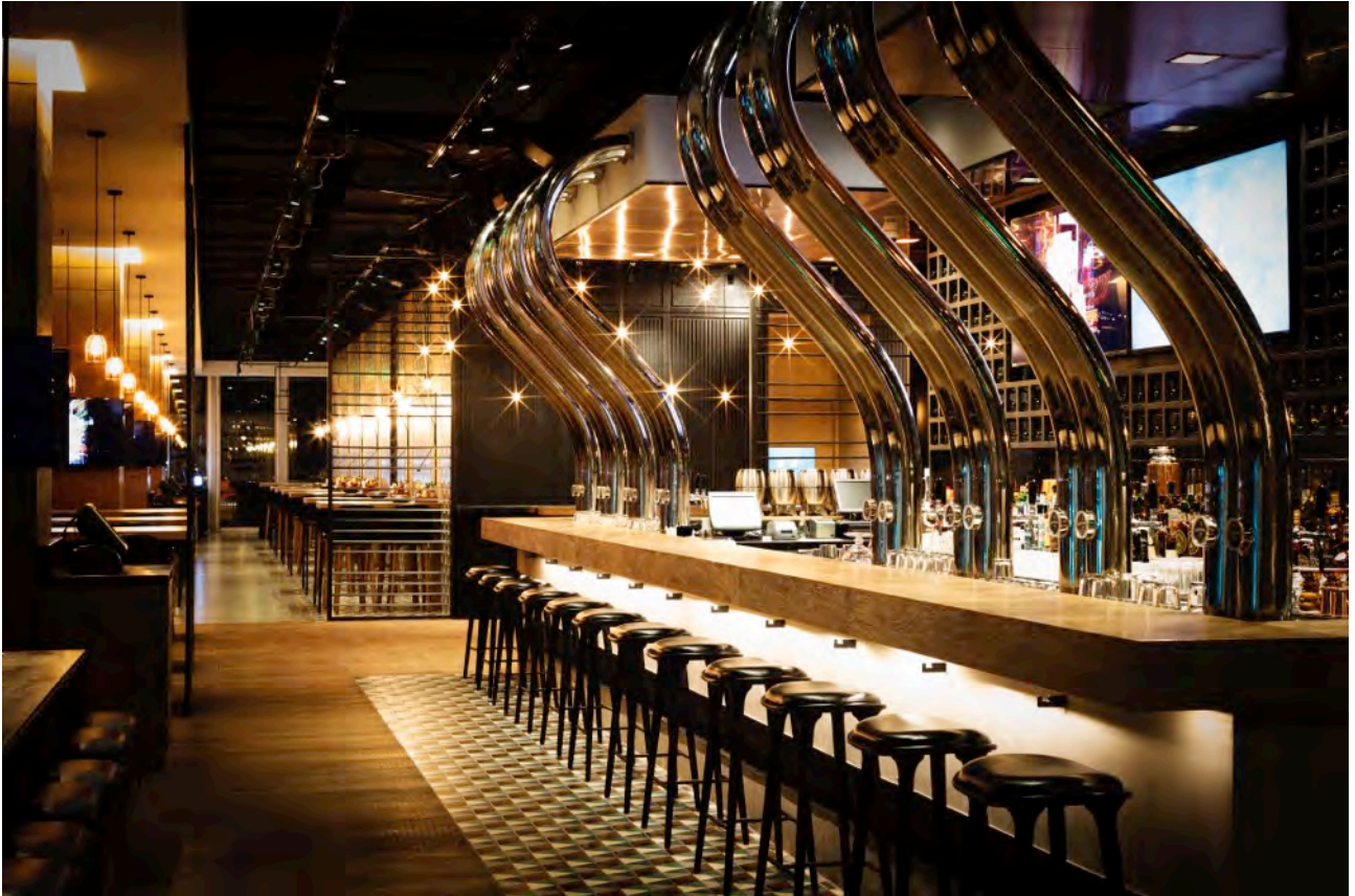
Beersmith is the only gastropub in the Guomao area, brewing a selection of seasonable beers in copper vats.