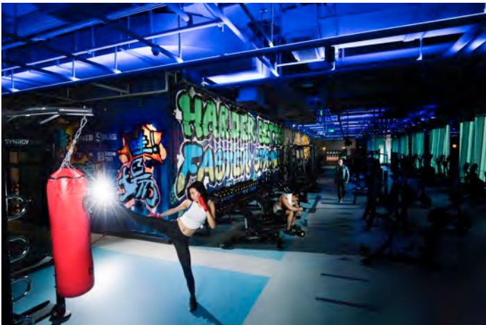
The hotel features and expansive, industrial-chic gym.