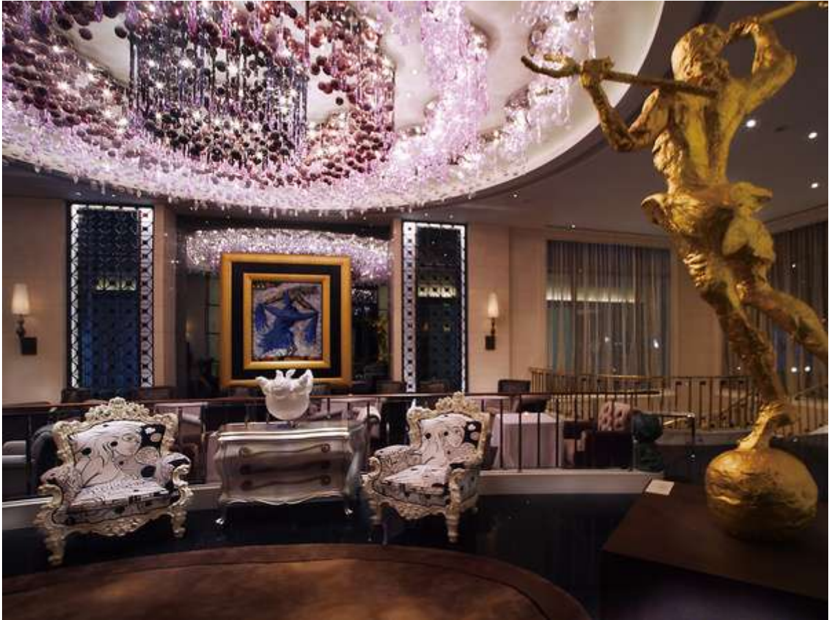
The vast glass / crystal chandelier.