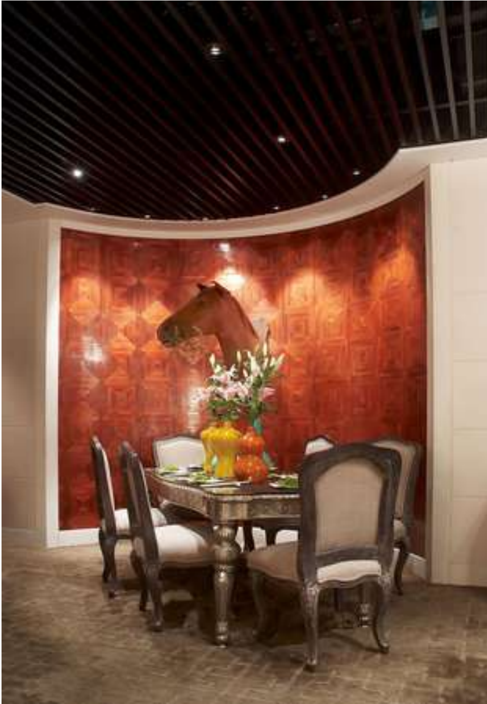
The dining area.