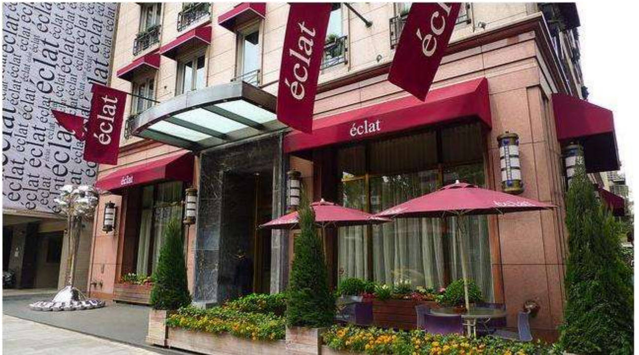
Entrance to Hotel Éclat.