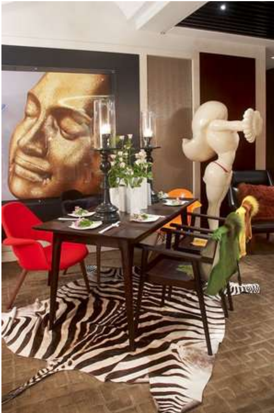
The dining area. The décor is quite eclectic and perhaps not to everyone's taste!