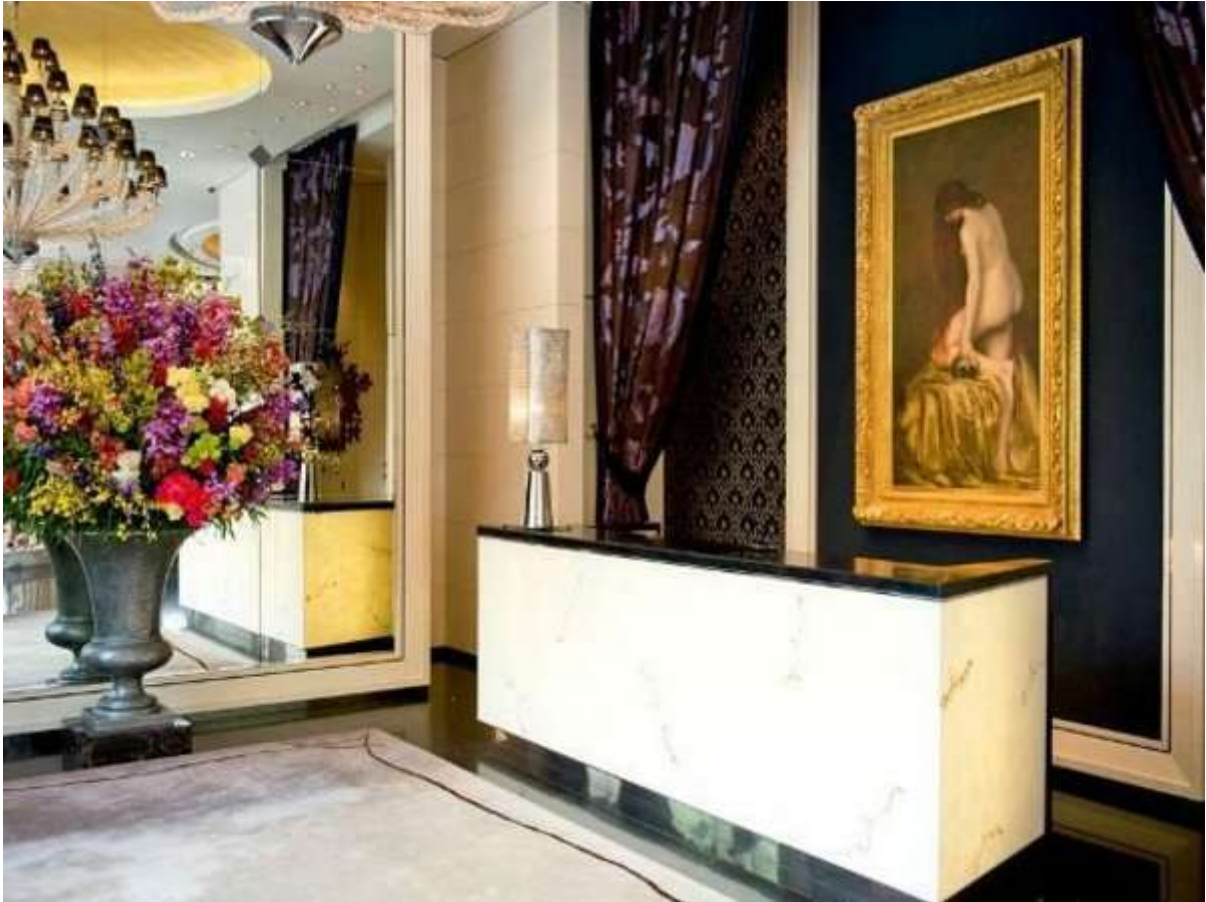
Original paintings by famous artists adorn the walls.