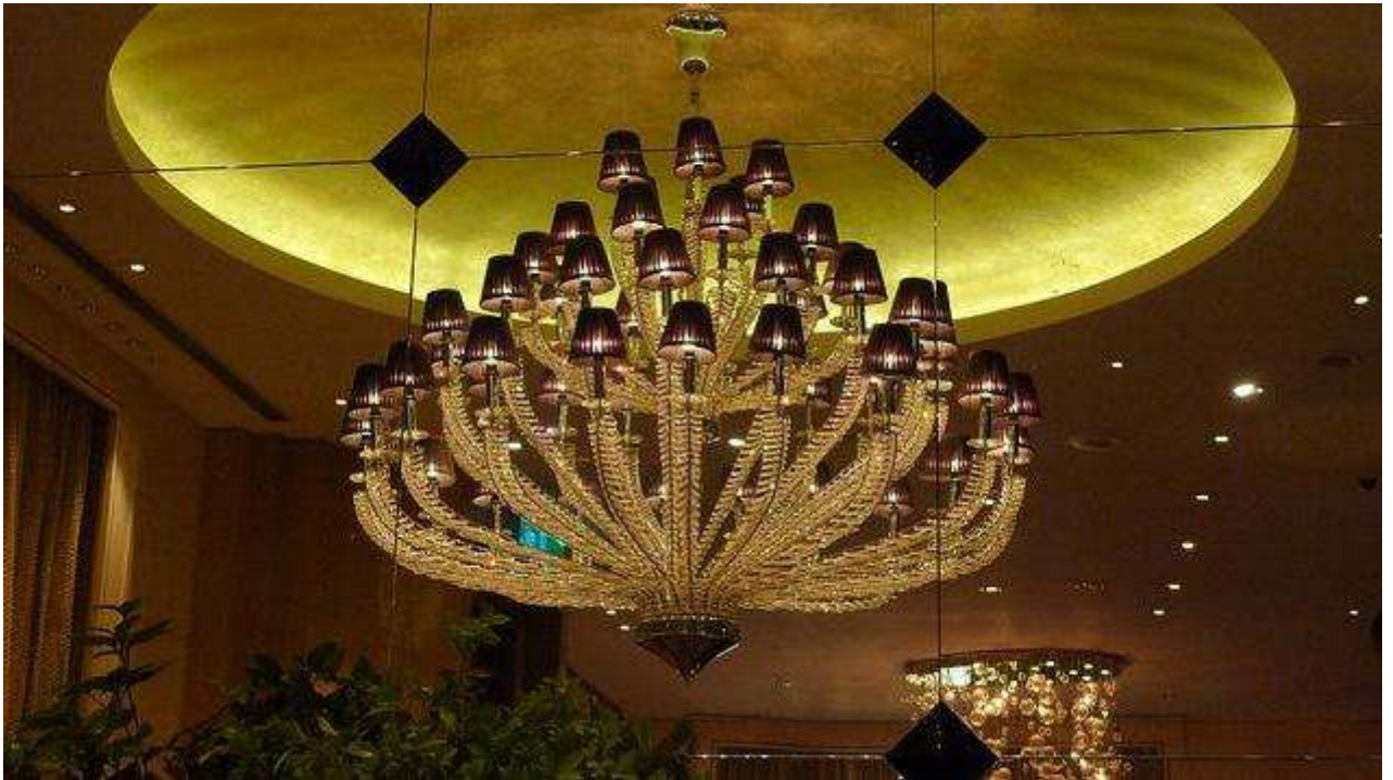
One of the three glass / crystal chandeliers in the lobby area.