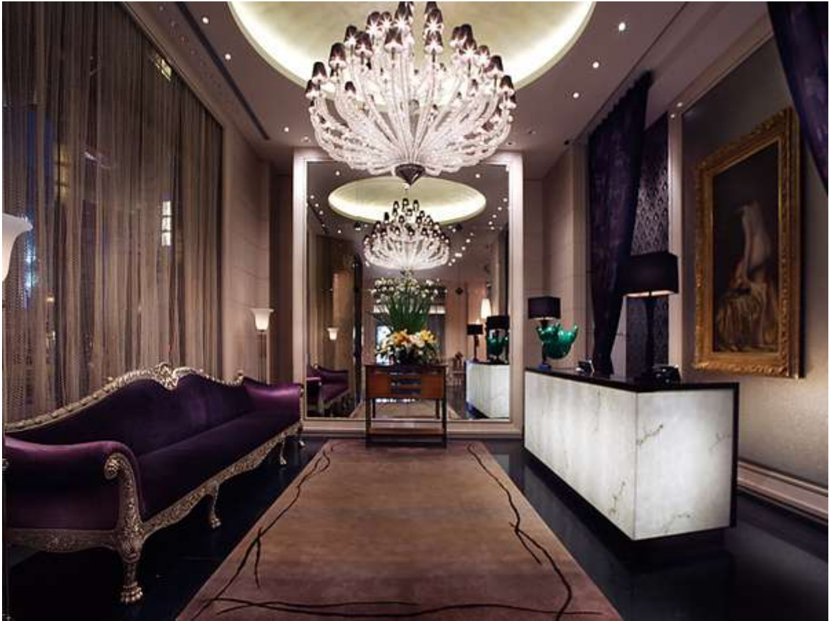
Reception area, decorated with a plush velvet sofa, drapes and vast glass hanging light sculptures in various shades of purple by noted Czech glass artist Jitka Skuhrová Lasvit.