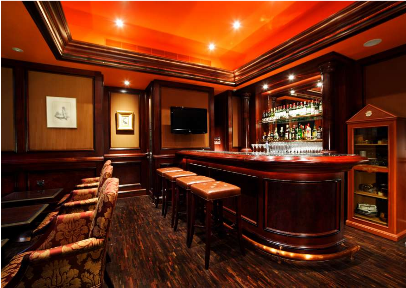
The George Bar. Warm browns and orange give the interior an elegant and cozy feel.