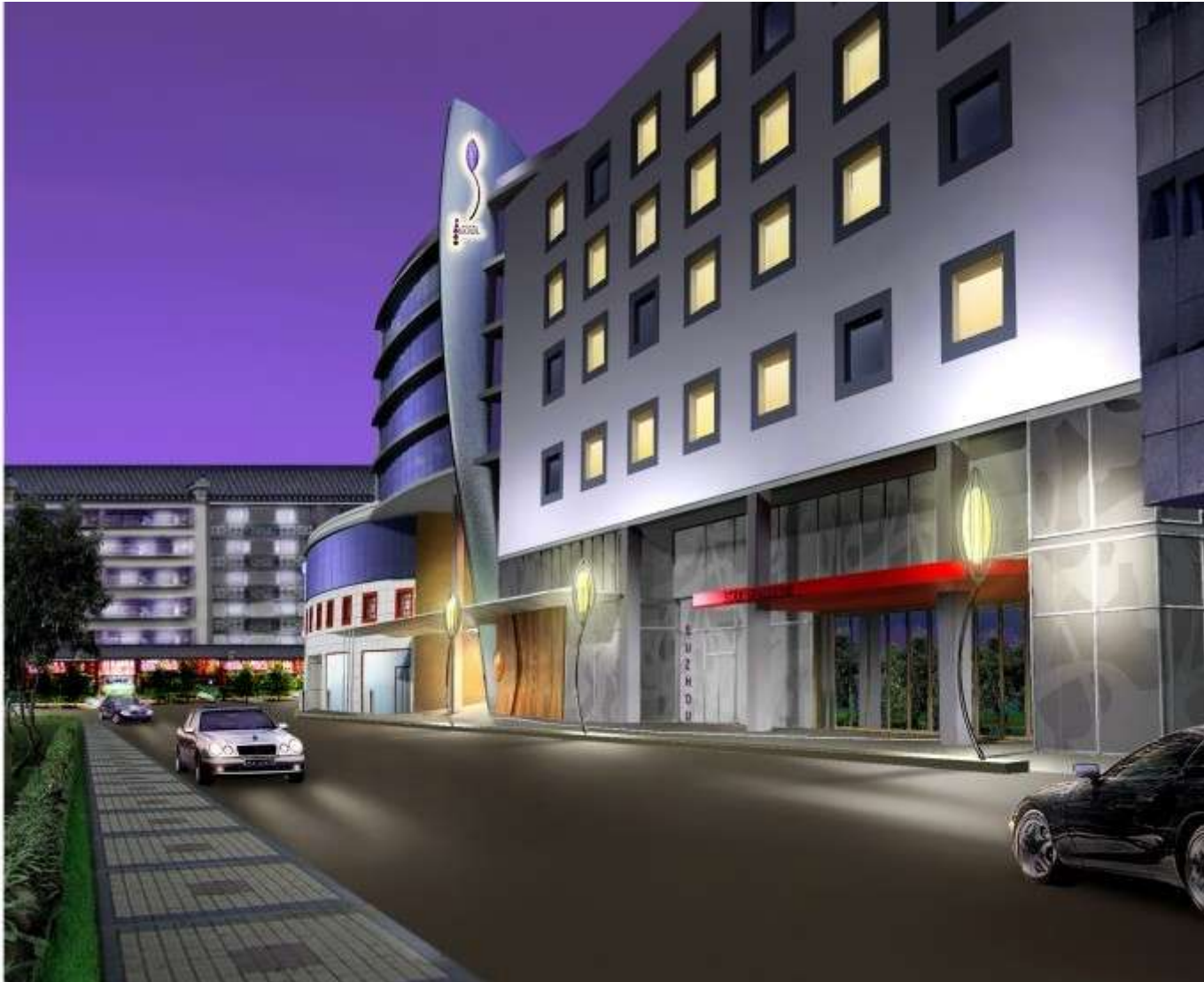
Artist's rendering of hotel exterior.