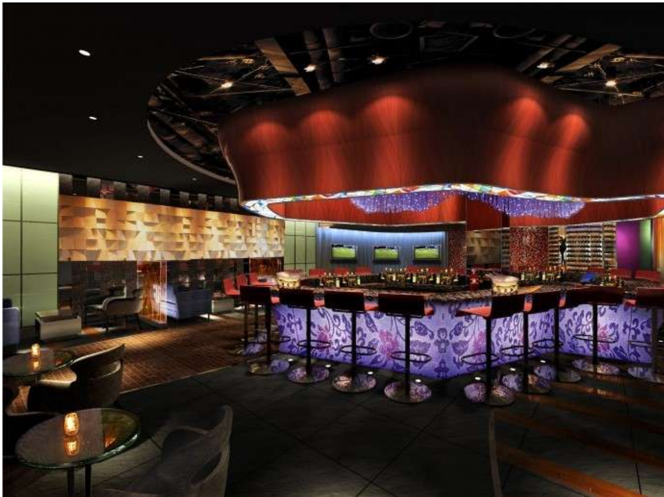
The bar area.