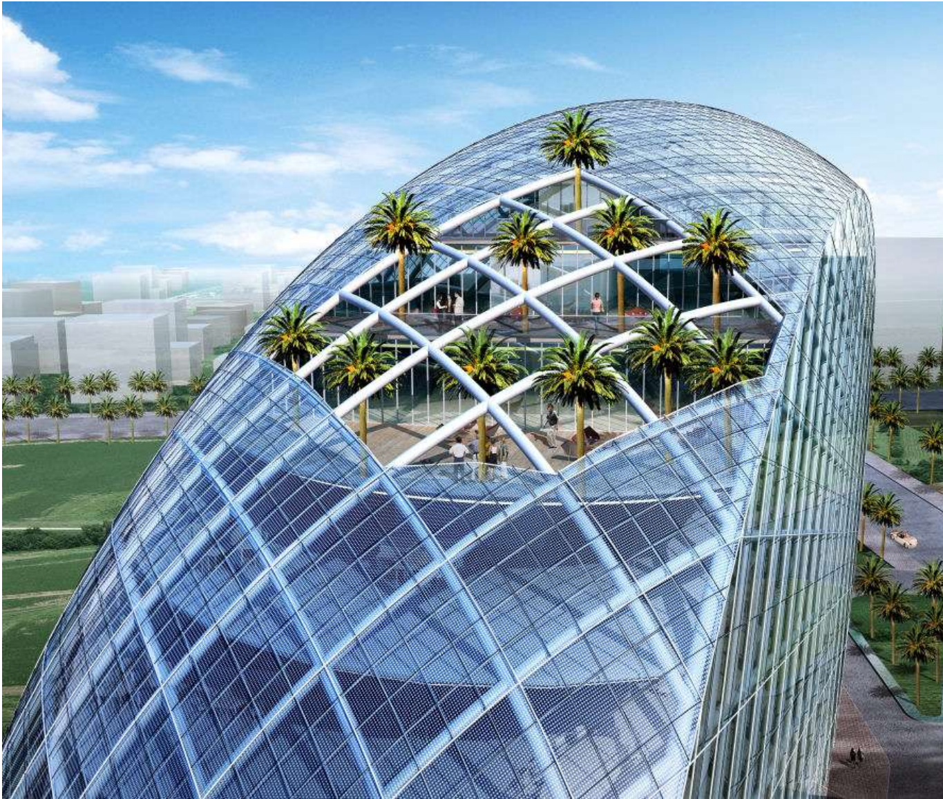
The sky garden on the top of building performs thermolysis (the dissipation of heat from the surface).