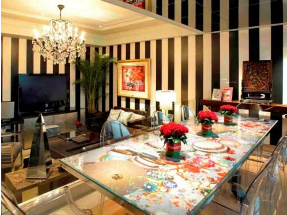
The lighted marble dining table.