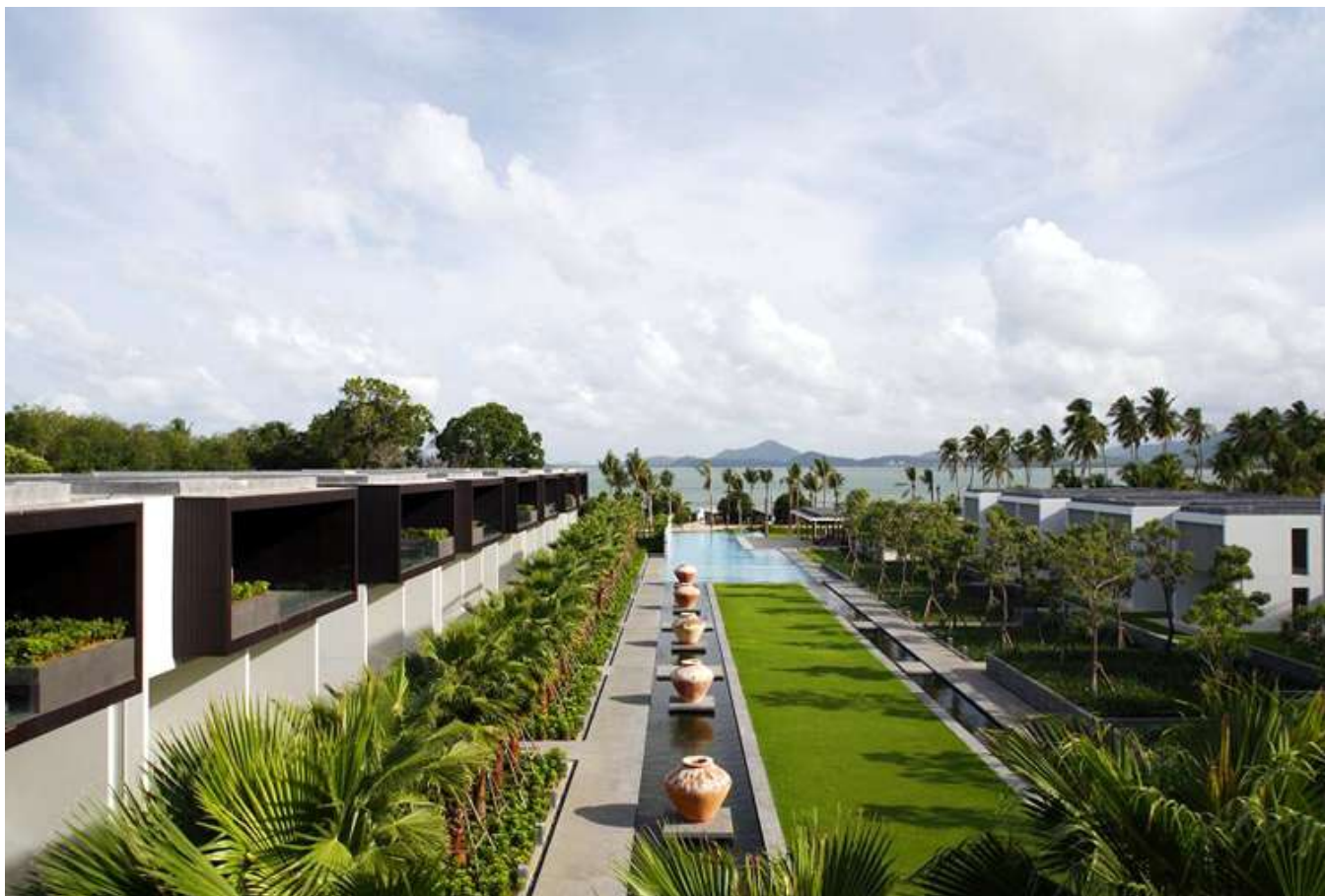
Bay view penthouse.

BANGKOK REPORT BY Ellen Bee NOVEMBER 2010