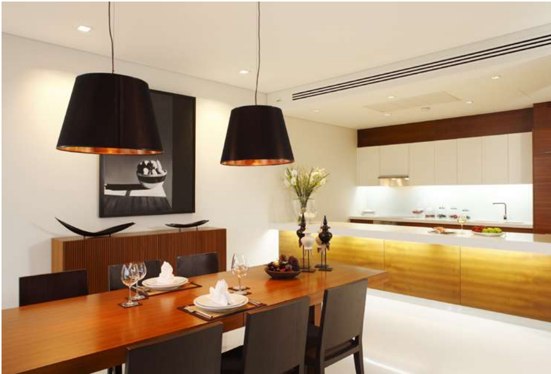
Bay view penthouse

BANGKOK REPORT BY Ellen Bee NOVEMBER 2010