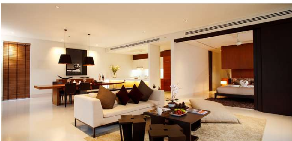
Bay view penthouse