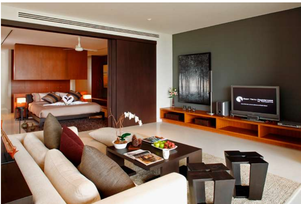
Bay view penthouse