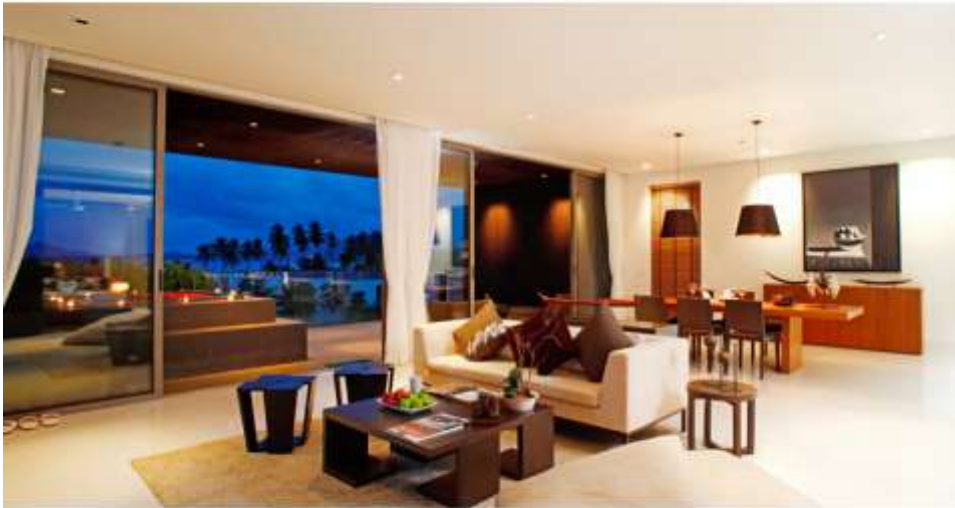
Bay view penthouse

BANGKOK REPORT BY Ellen Bee NOVEMBER 2010