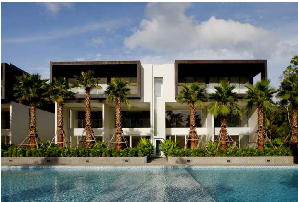
Bay view Penthouse. The home has a generous covered terrace which is ideal for dining and includes a built-in jacuzzi. Total indoor: 182sqm; outdoor total 50sqm.