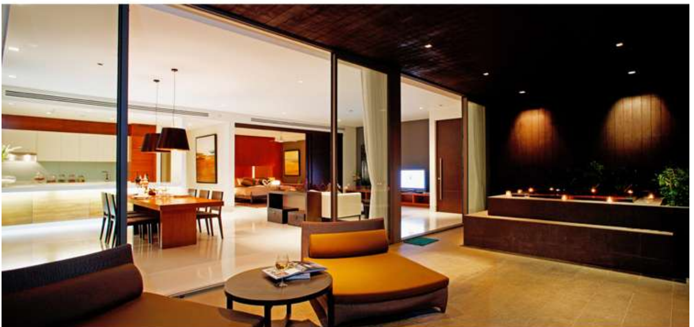
Bay view penthouse