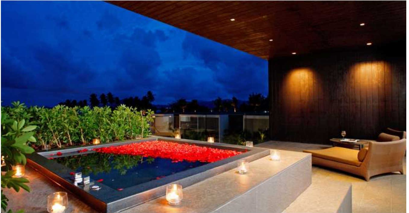
Bay view penthouse with private, outdoor Jacuzzi.