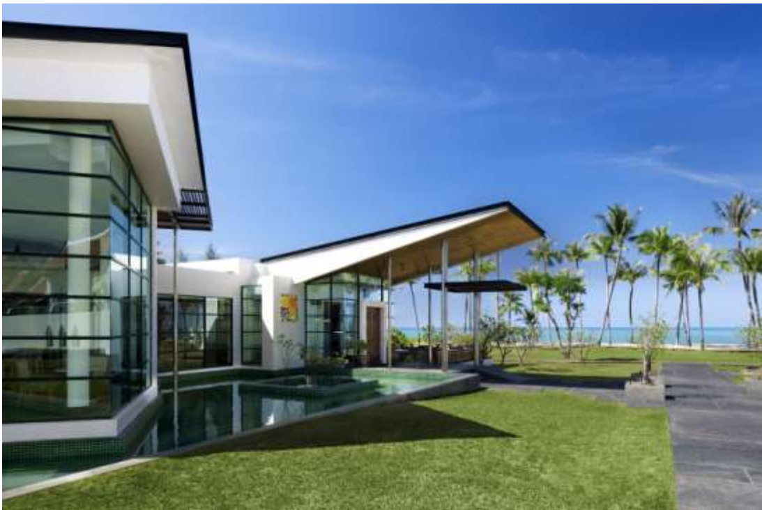
Compared to the other restaurants on the premises, Olive Mediterranean restaurant is housed in an architecturally modern building.