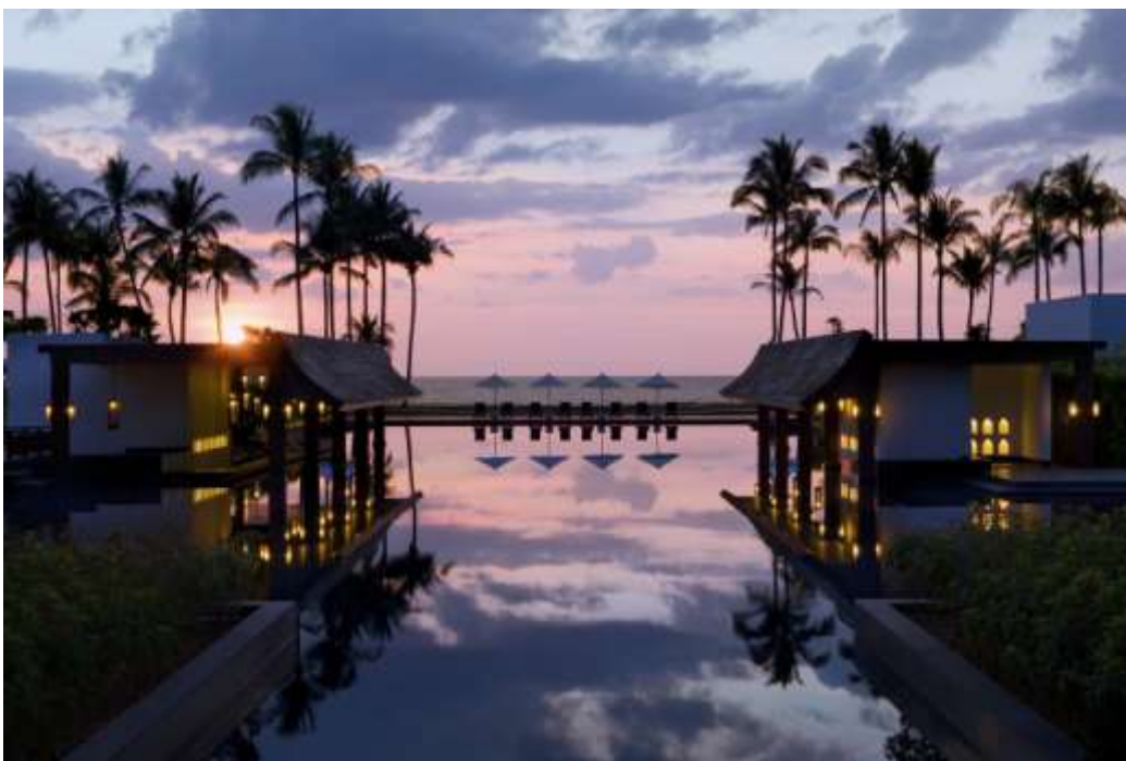
Ground level rooms give guests direct access to the lagoon-shaped swimming pool.