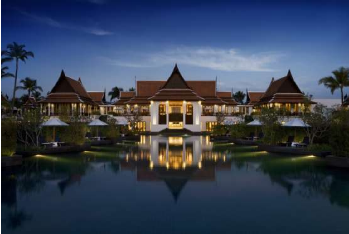
16,000 sqm of waterways meander around the guestrooms and main lobby building.

BANGKOK REPORT BY Ellen Bee NOVEMBER 2010