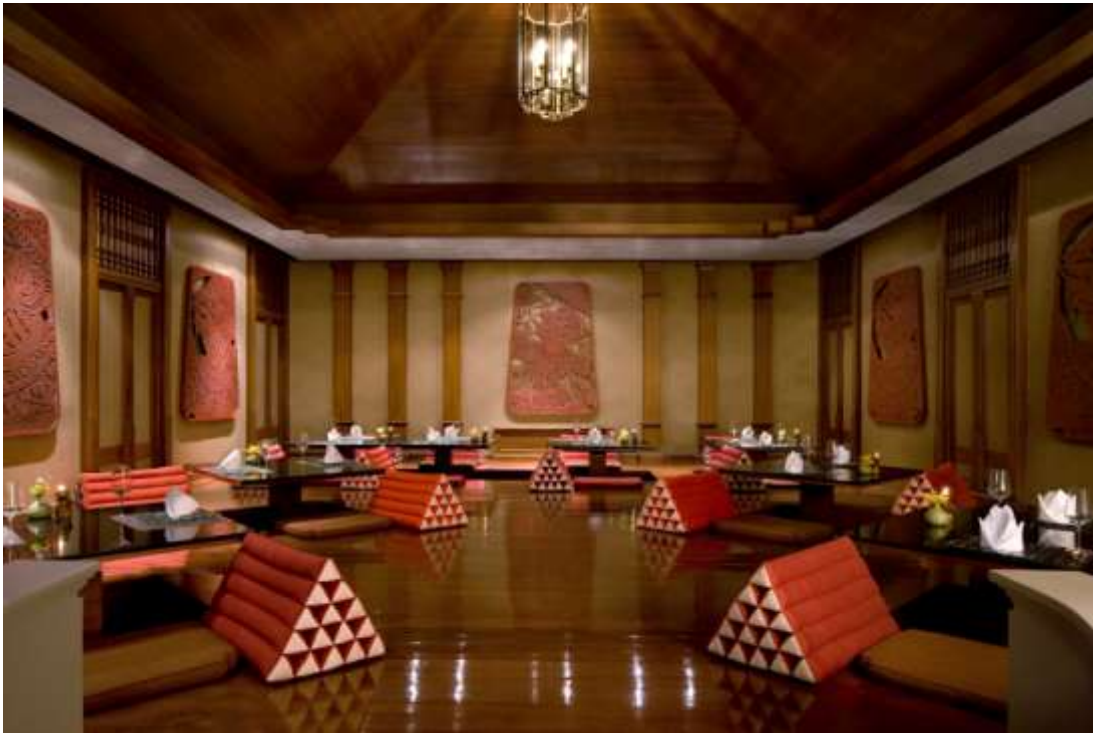
Ta-Krai Restaurant offers authentic Thai cuisine.

BANGKOK REPORT BY Ellen Bee NOVEMBER 2010