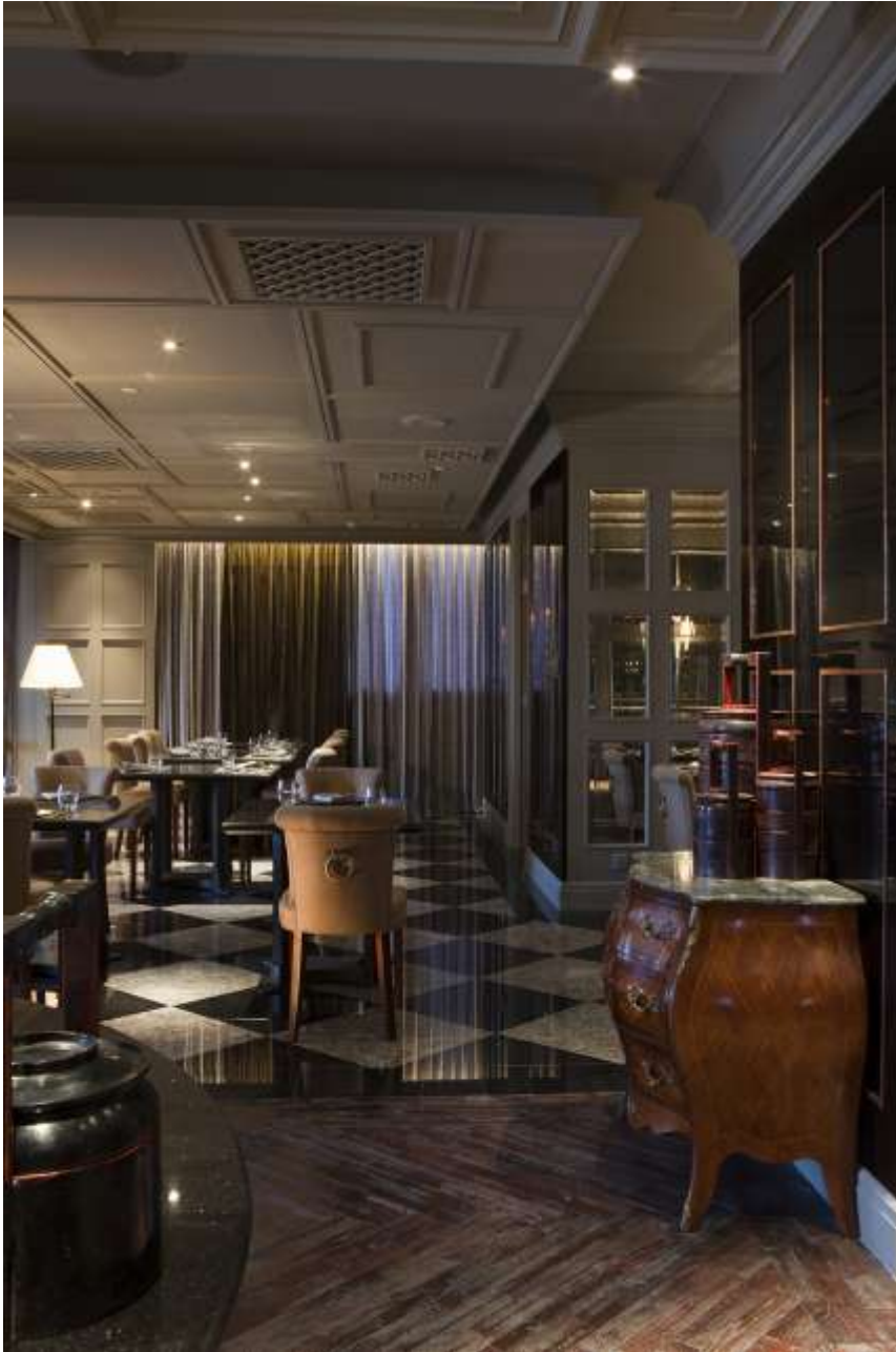
Thai Restaurant Su Tha Ros.