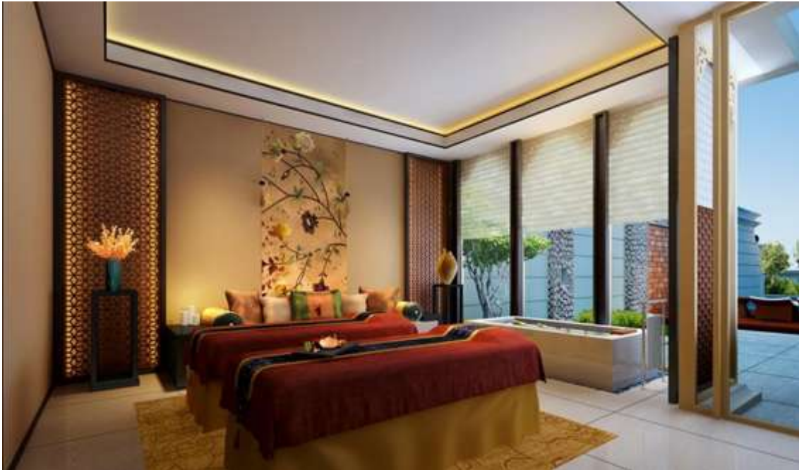
Treatment room of Sanctuary Pool Villa.