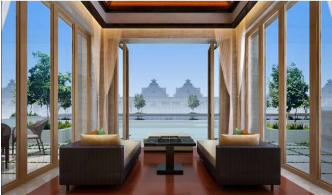
Dining cabana pool bar.