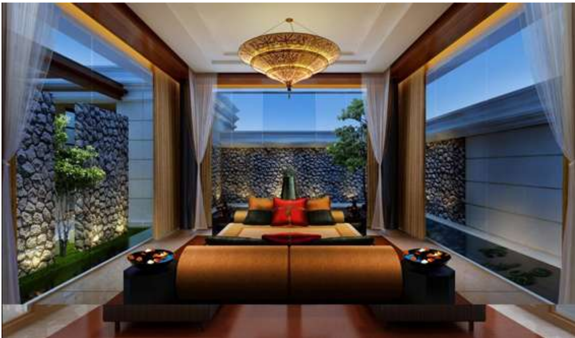
Bedroom of Sanctuary Pool Villa.