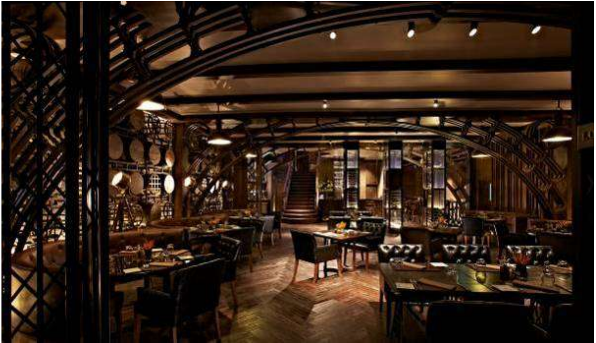
Italian restaurant Medici which has private dining alcoves.