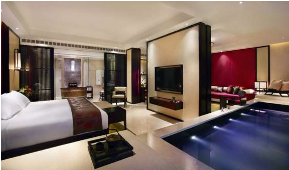
Grand Cotai Suite.