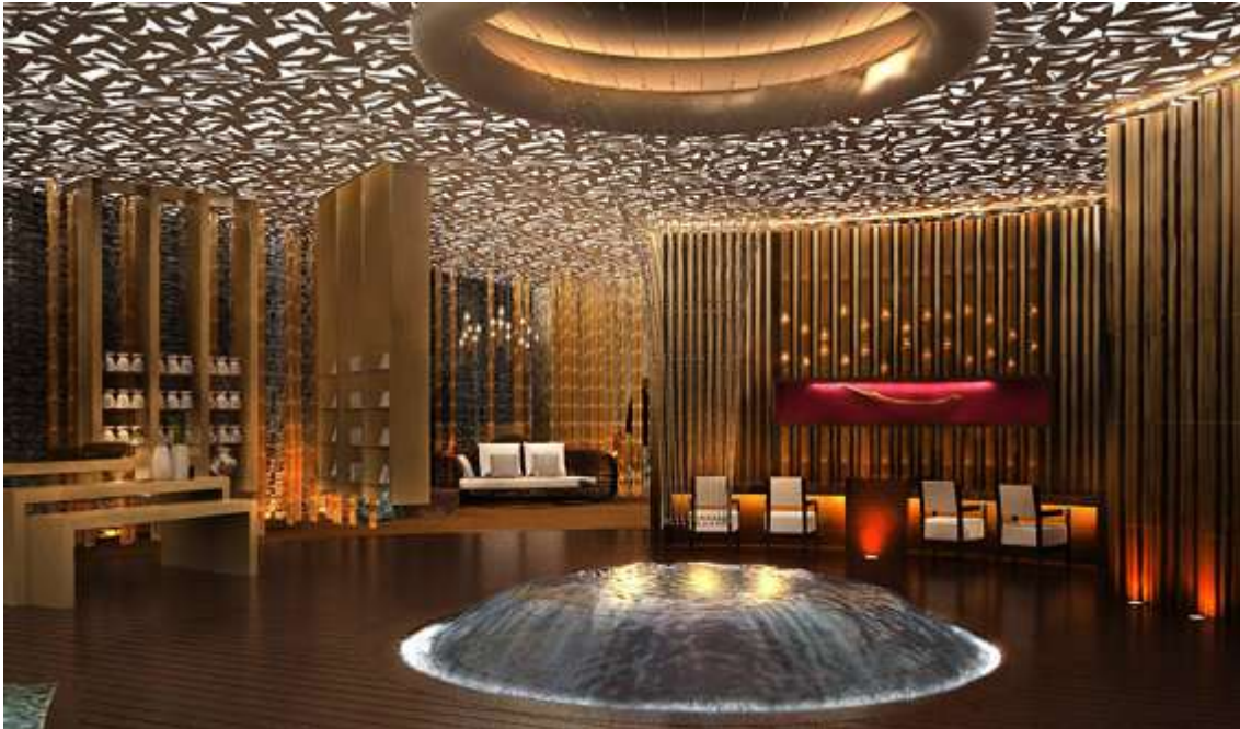
Banyan Tree's signature spa, which measures an expansive 3,400 sqm.