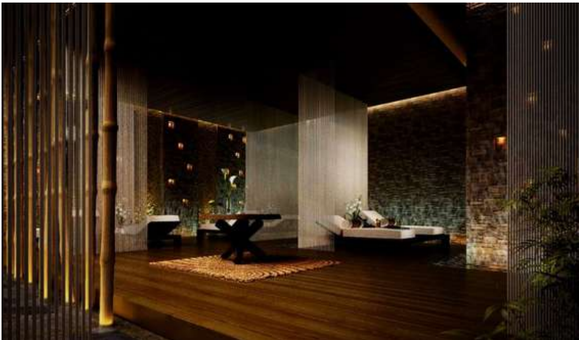
Banyan Tree Spa.