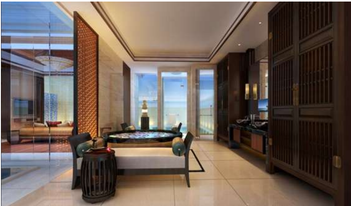
Bathroom of pool villa.