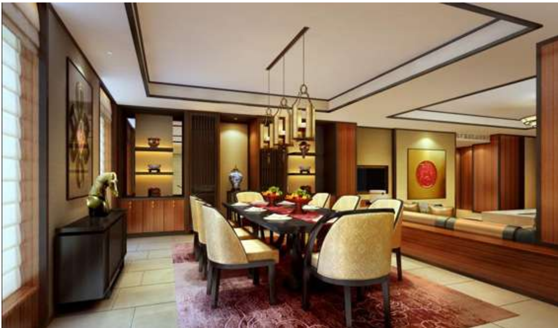
Grand Macau Suite.