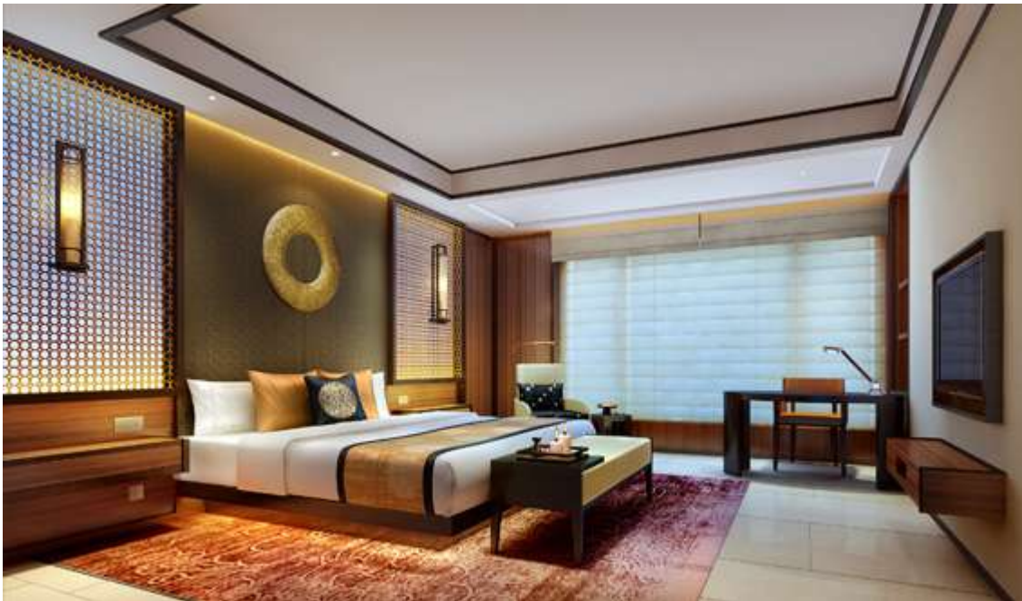
Bedroom of Sanctuary Suite.