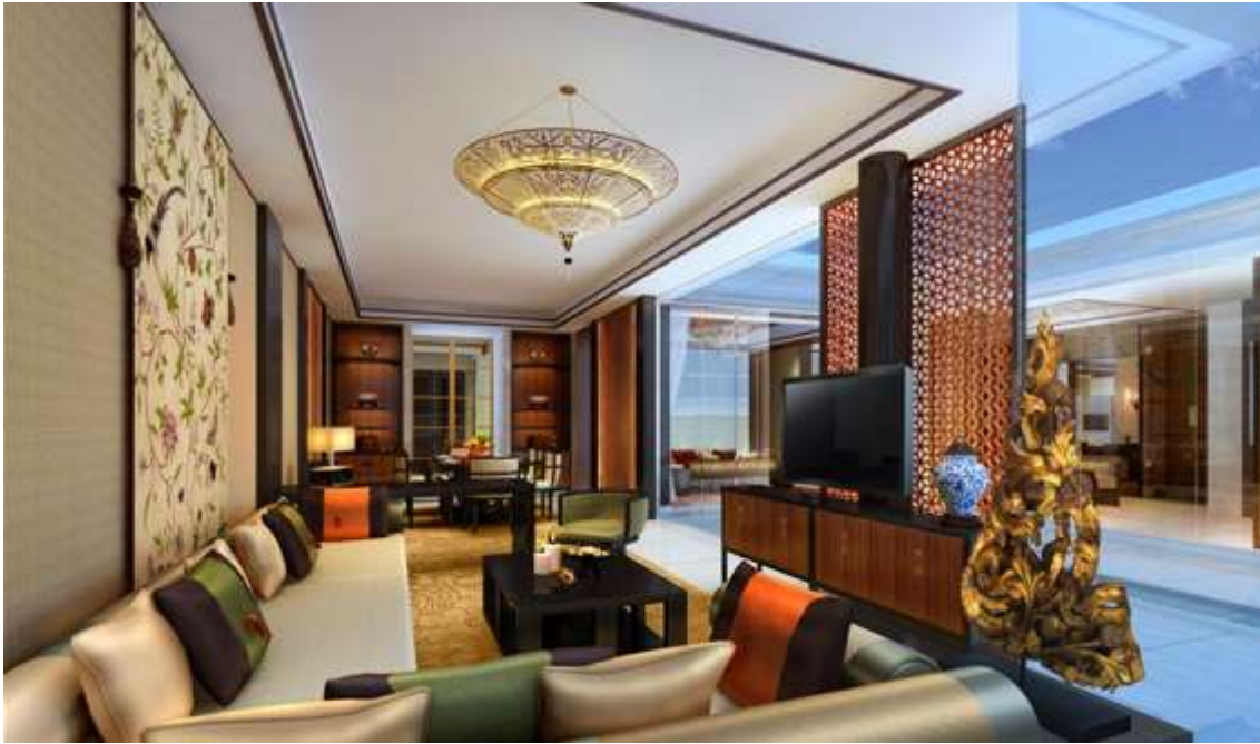
Living room of Pool Villa.