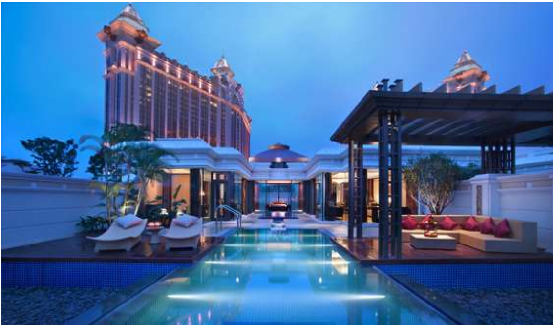
Exterior of the 450 sqm Pool Villa.