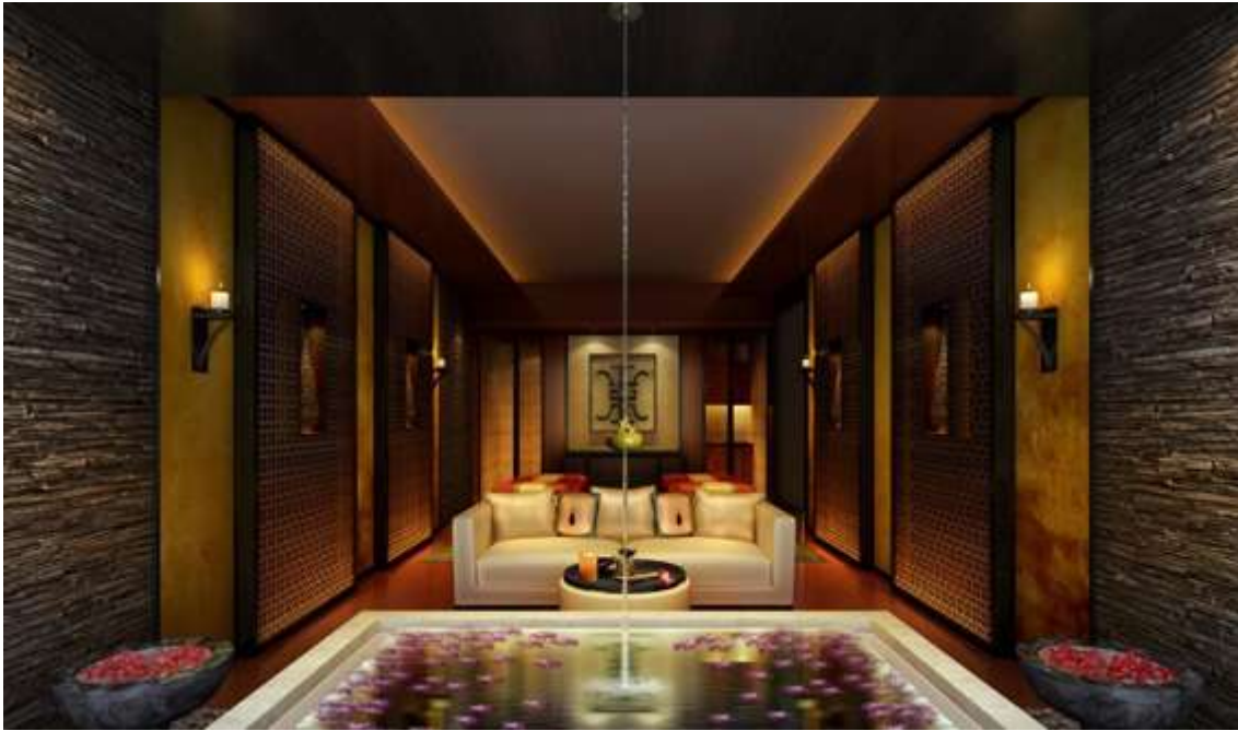
Living room of Macau Villa Spa Suite.