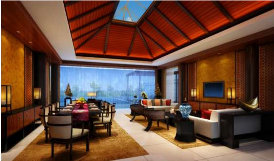
Living room of Sanctuary Pool Villa. Inspired by Chinese architecture and style, Banyan Tree Macau combines ancient traditions with the most modern of furnishings. Each suite and villa is a tribute to Oriental design, with high ceilings and ornate furnishings, complemented by vermilion red accents.