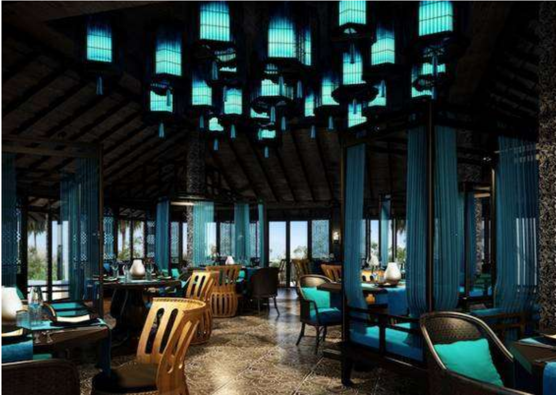
All-day dining restaurant.