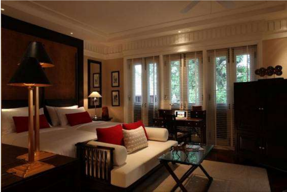
Bedroom of the East Borneo Suite. There are 4 suite types range from 70 to 135 sqm, each named after a famous colonial settler.