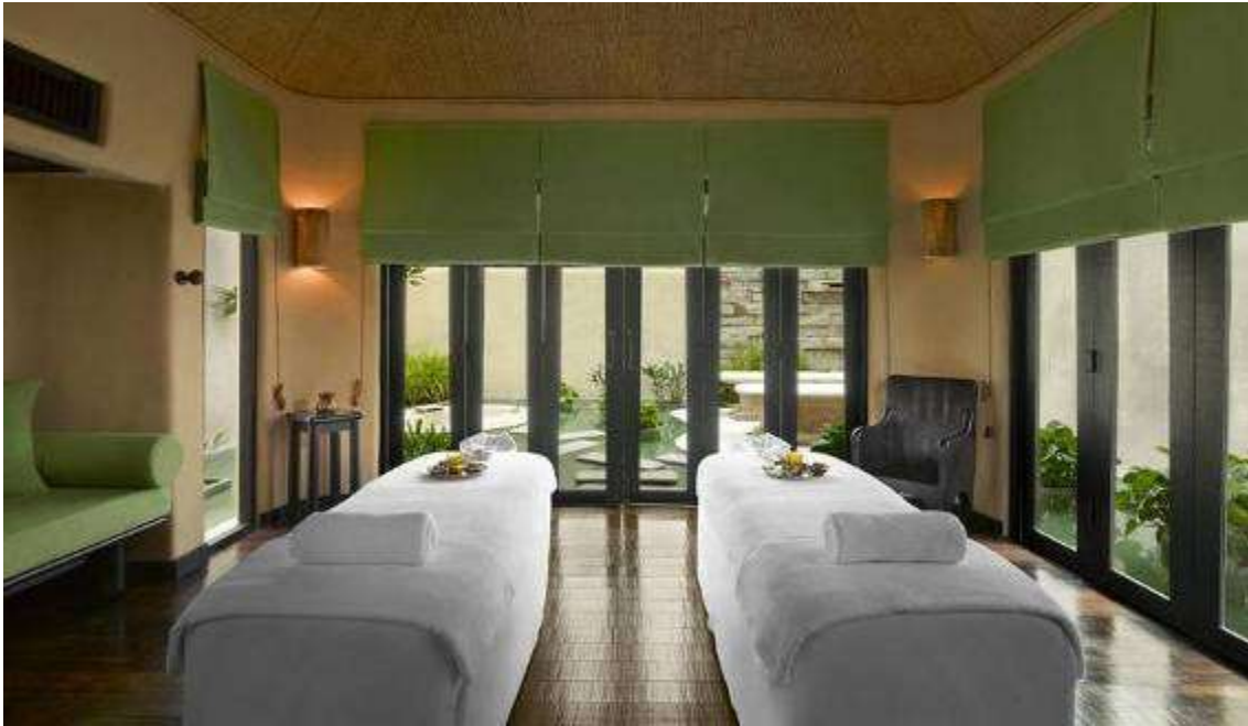
Spa treatment room.