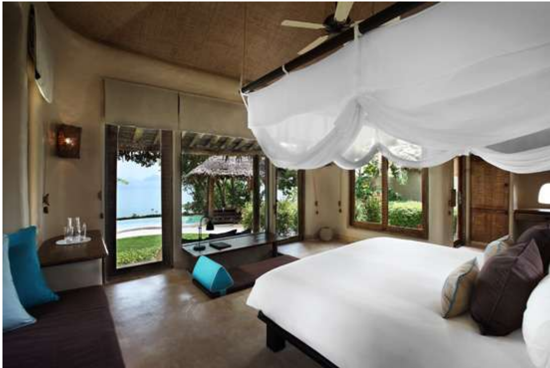
Villas feature private plunge pools surrounded by tropical gardens.