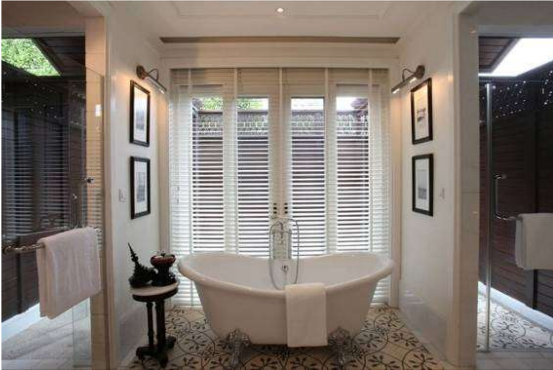
Freestanding Victorian baths allude to the residence's colonial past.