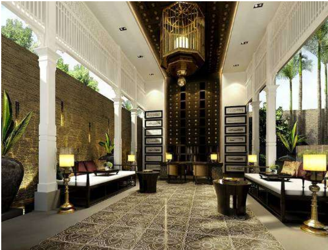
Reception area. Tiled verandas, cane shades and rattan furniture are reminders of days gone by.