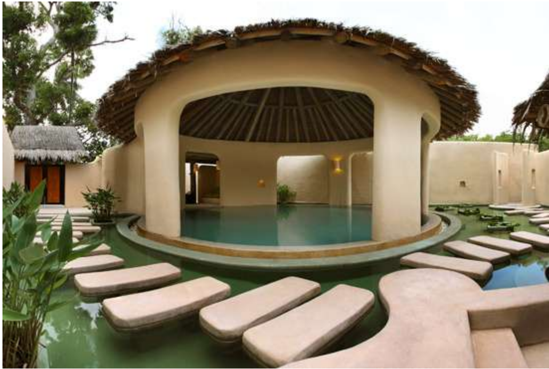
The resort's signature spa, which is the largest in the region.