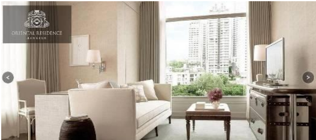
Executive deluxe room.