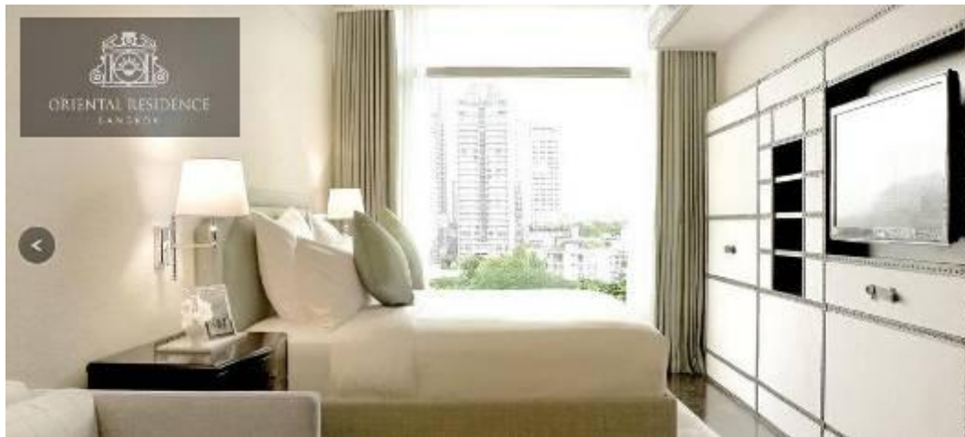
Executive deluxe room.