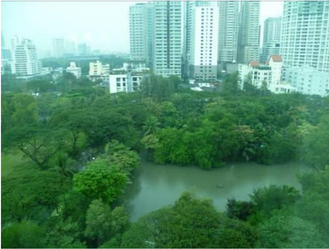
The residences overlook the lush gardens of the US embassy.