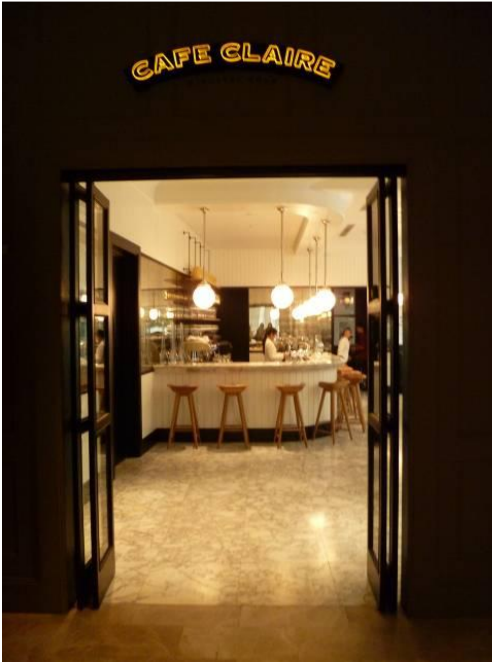
Entrance to the hotel's signature restaurant Café Claire.