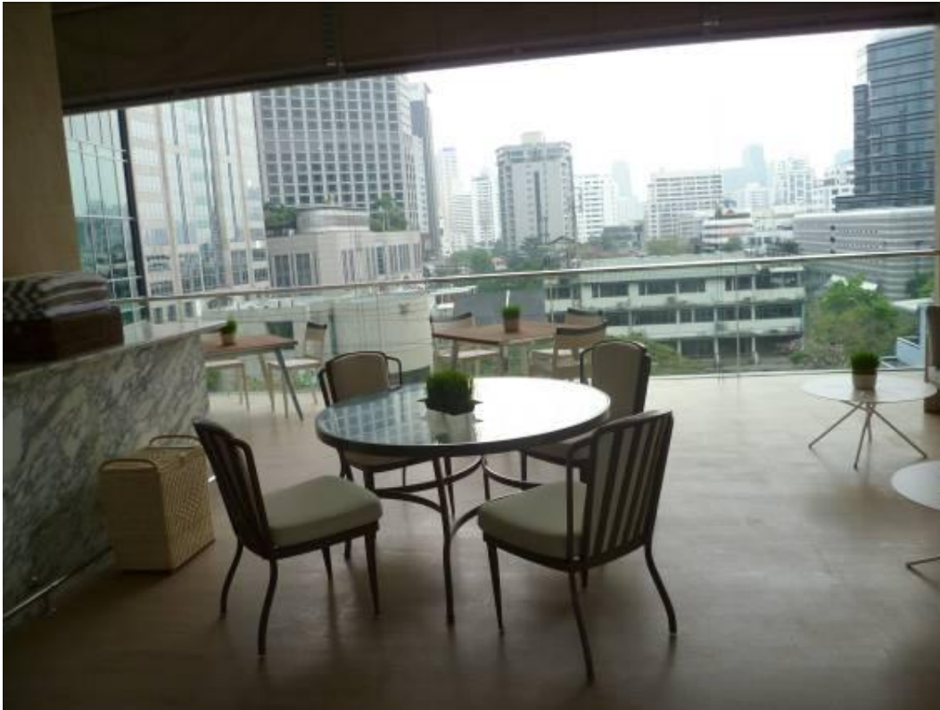
Pool deck area.