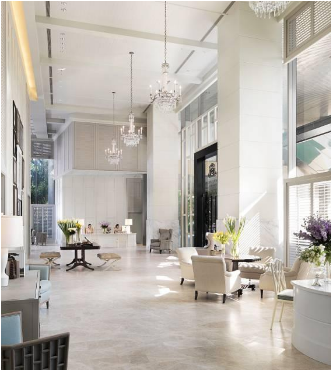
The lobby area.