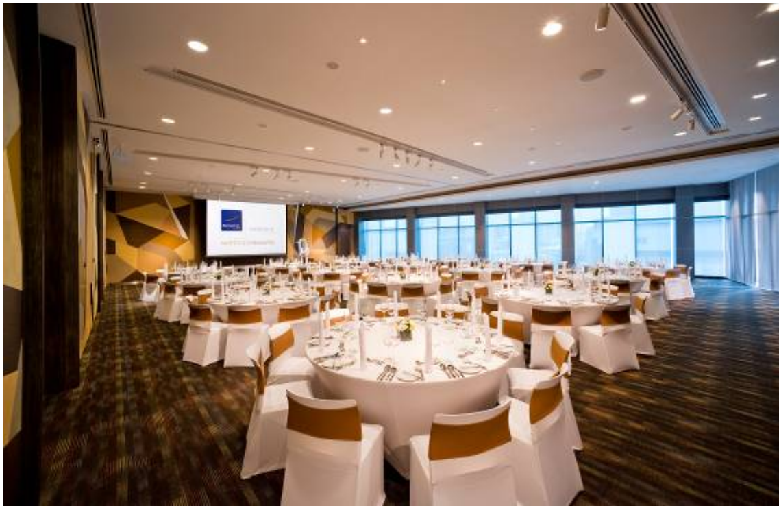
Sapphire Suite meeting room