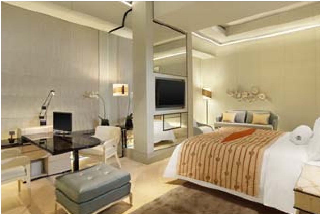
An entry-level Grand Deluxe Room.