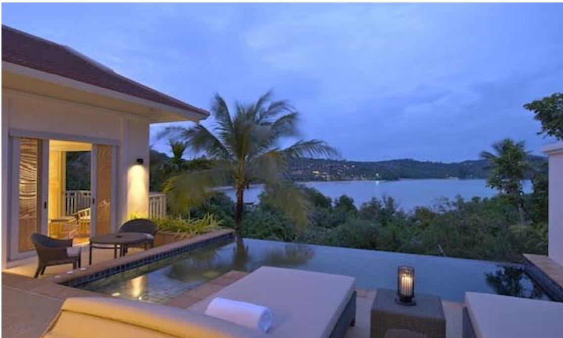
Exterior of Pool Villa