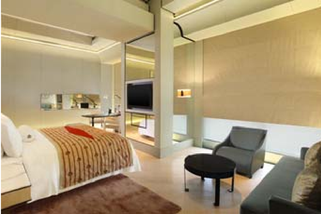
Grand Deluxe Room