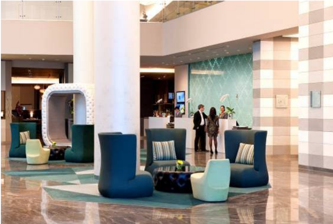
The interior design of the hotel entrance exudes a modern and spacious feel.