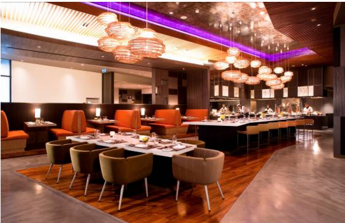
The Square restaurant