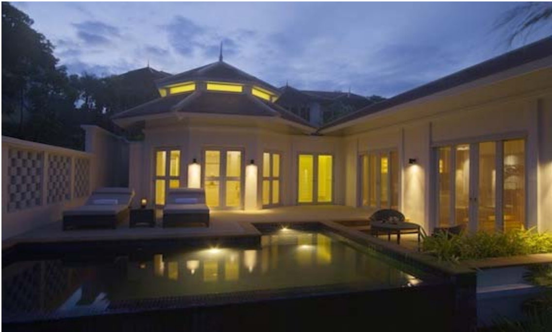
Exterior of Pool Villa