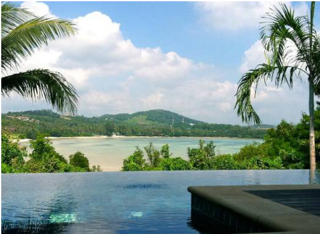
Infinity pool of Pool Villa