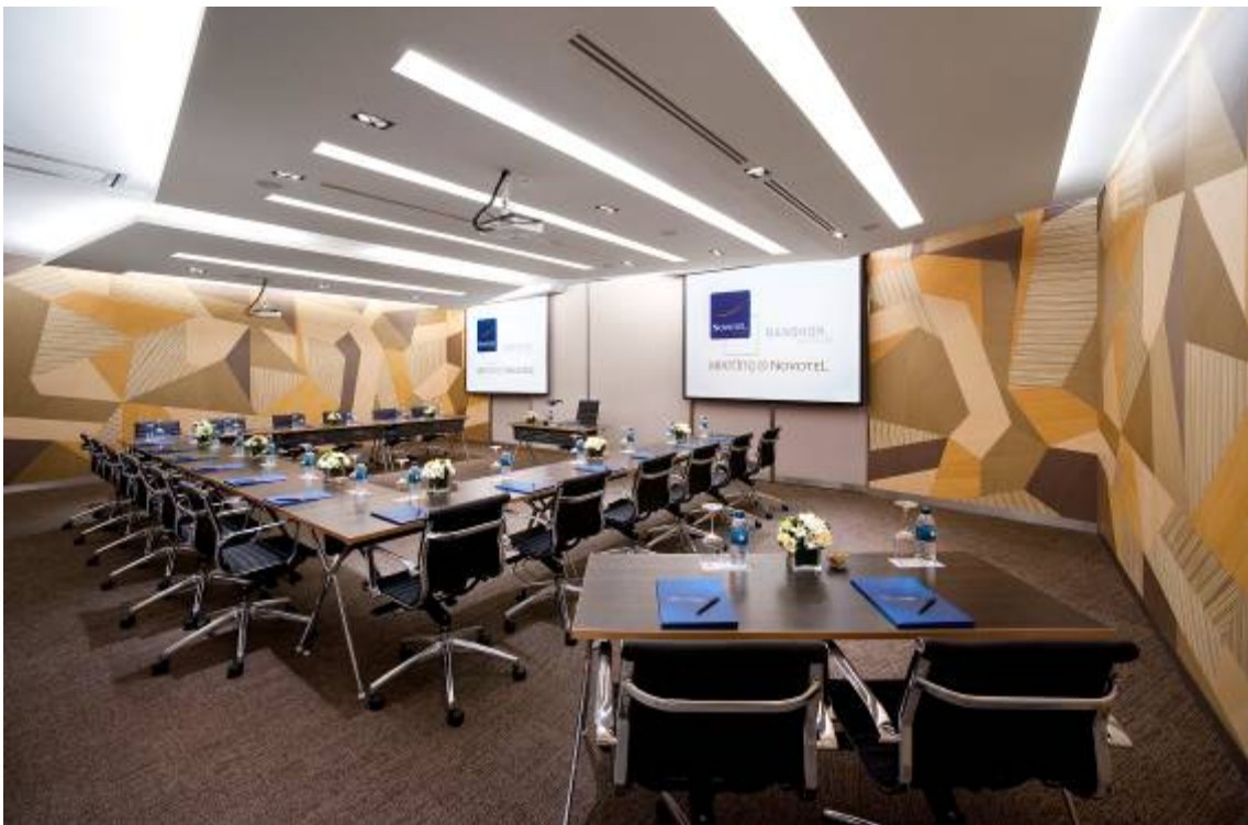
Topaz meeting room