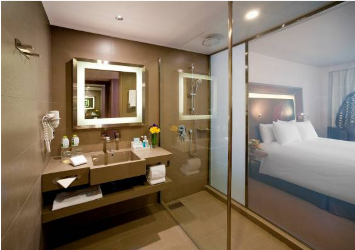
Executive Suite Toilet