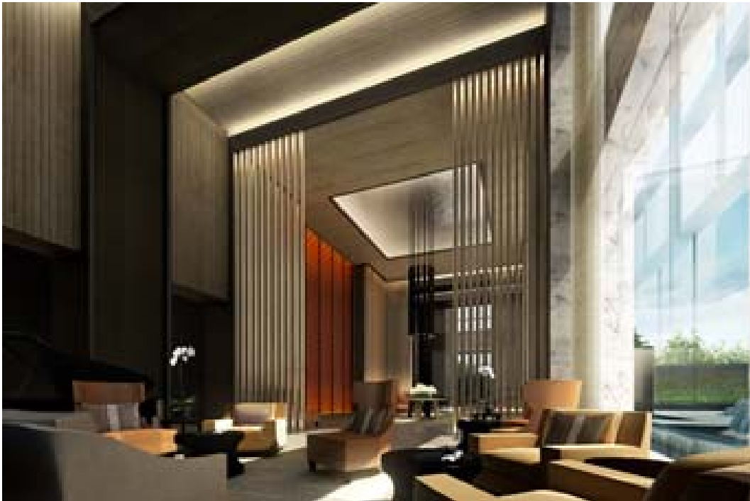
Different designers worked on the interior. The hotel lobby features steel beams, grey marble and the clean-cut lines.