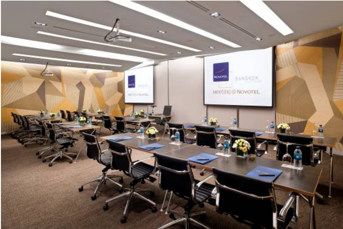
Topaz meeting room