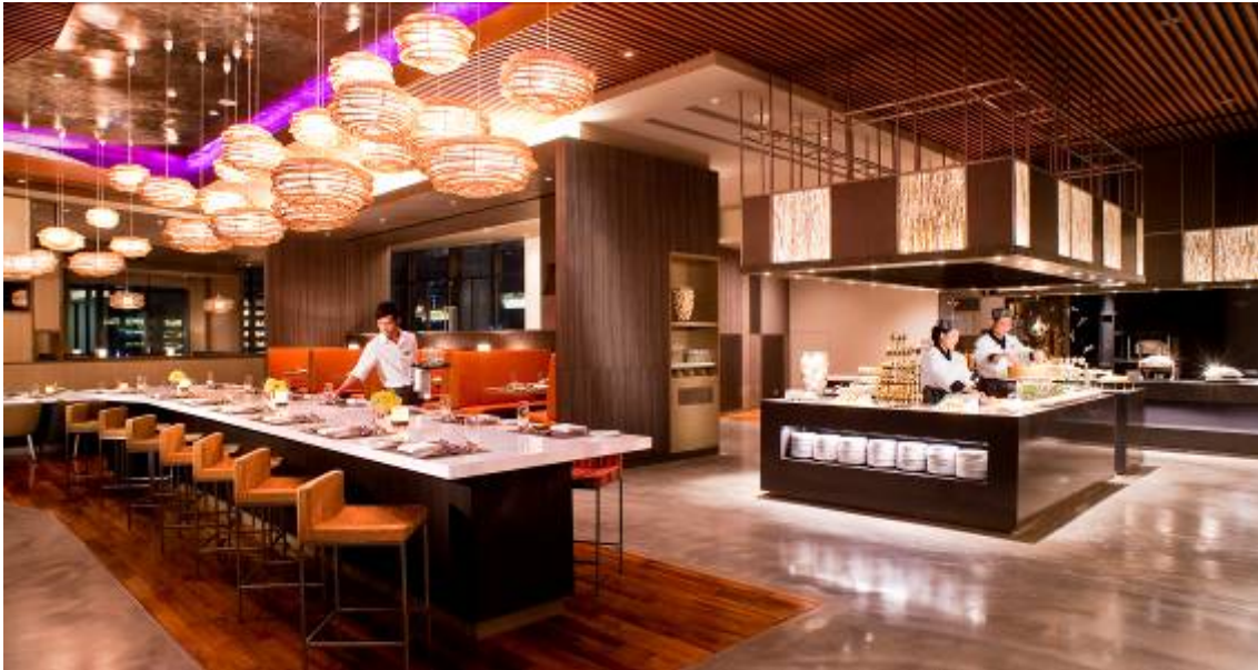
The Square restaurant serves international, Asian and traditional Thai cuisines.