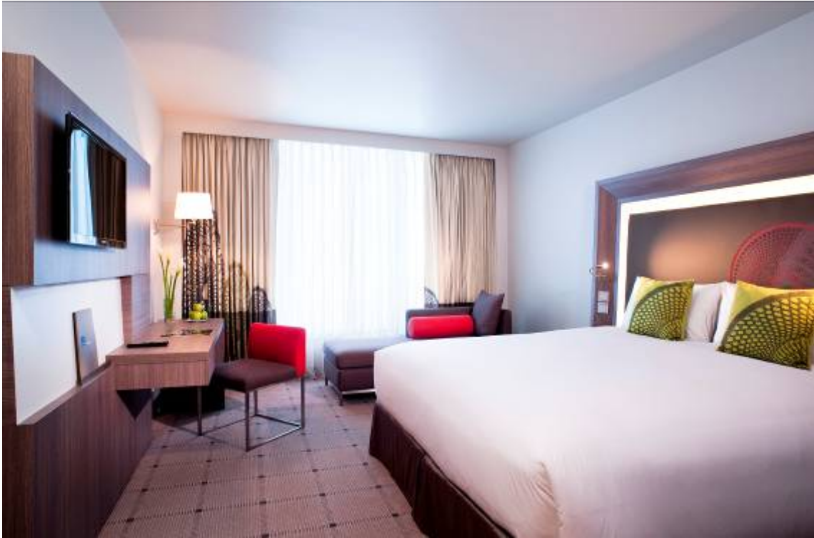
Superior Room. The interior is modern and contemporary, with splashes of color.