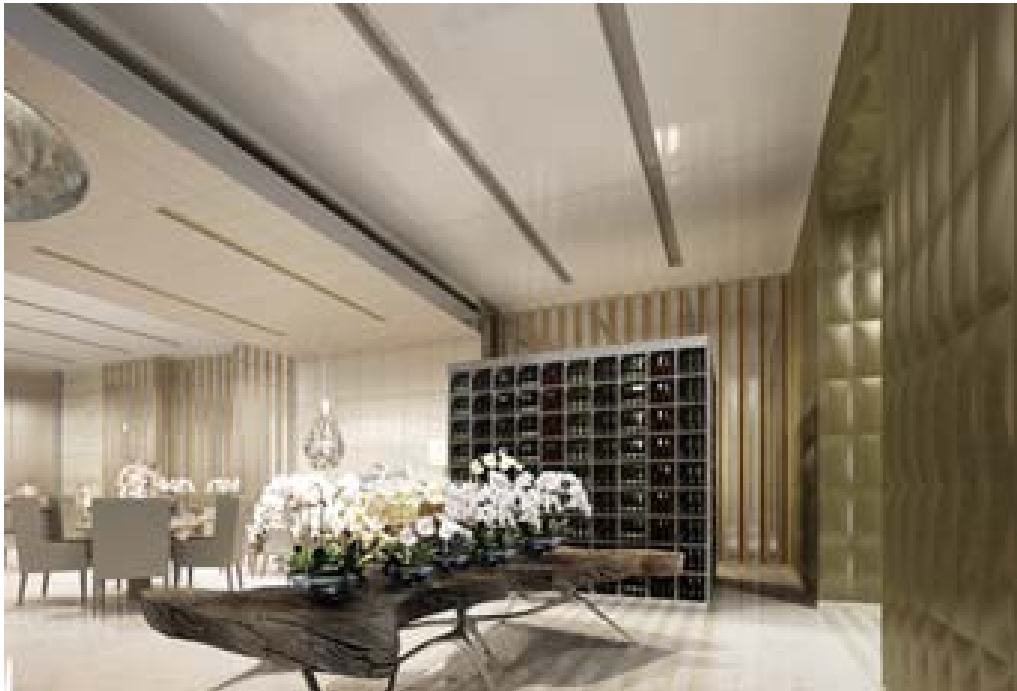
Rendering of Yan Yu Chinese restaurant