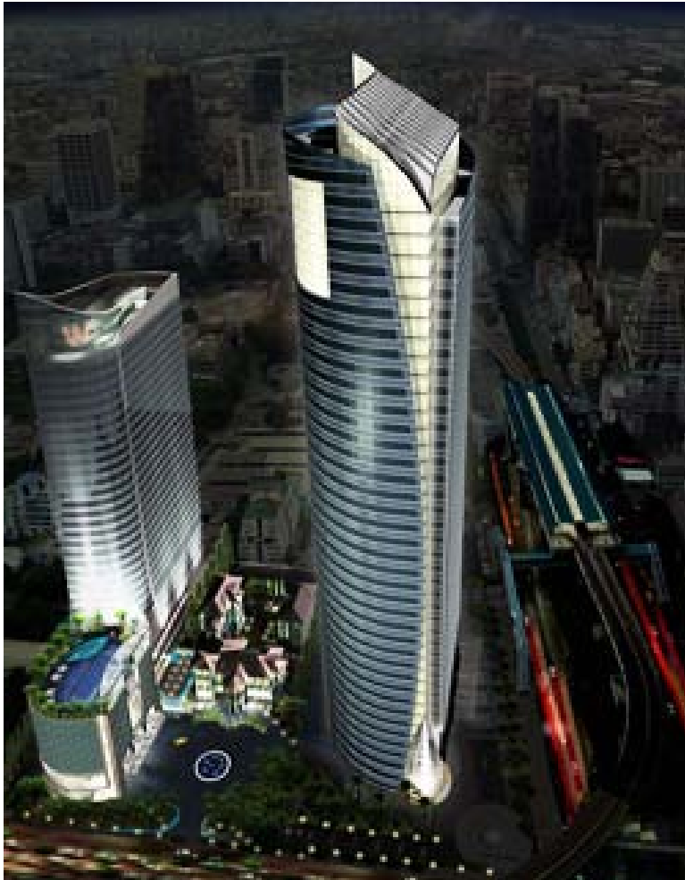
The towers share a common architecture language.