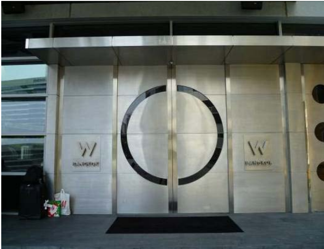
Entrance to the W Hotel with its imposing silver-colored sliding doors.