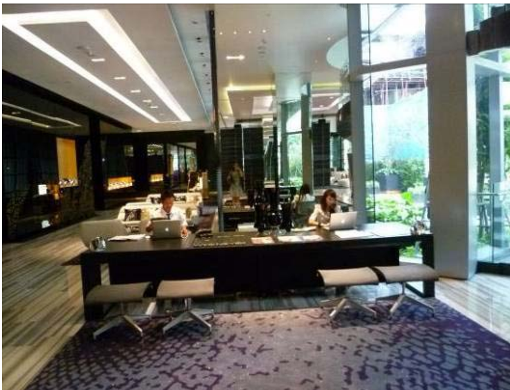
Concierge desk next to the entrance.