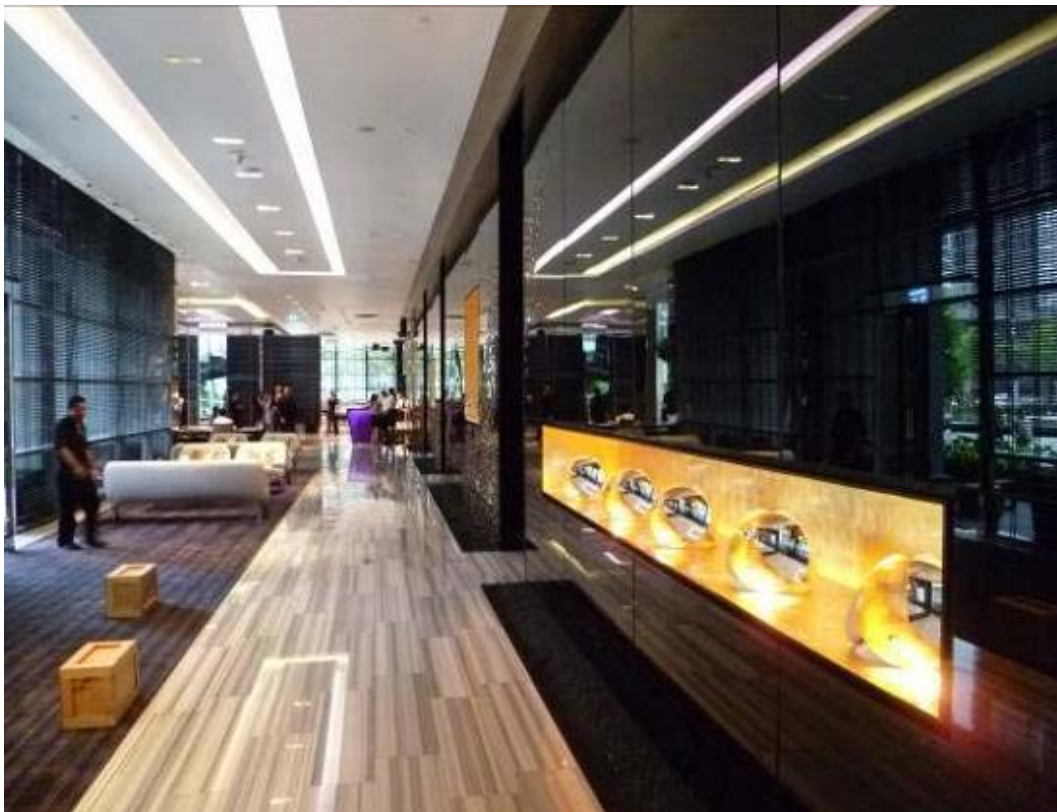
Corridor between lobby and elevator area.