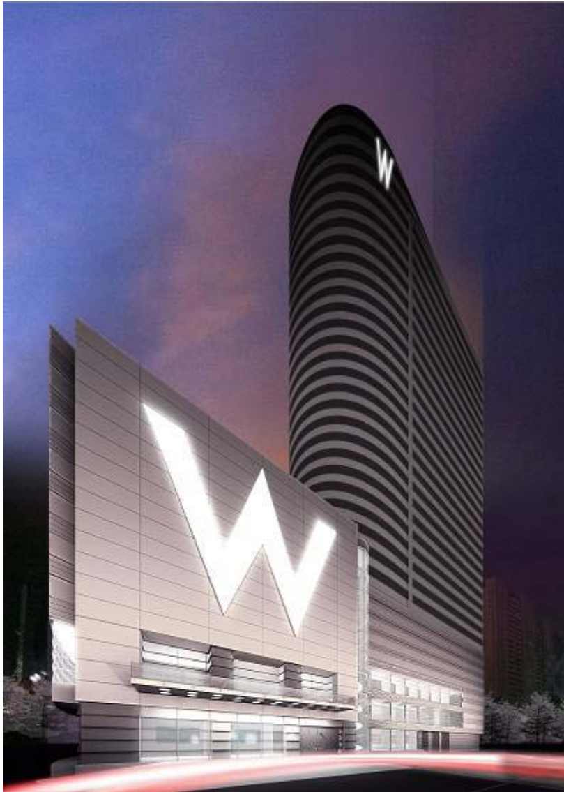
Artist's rendering of the façade.