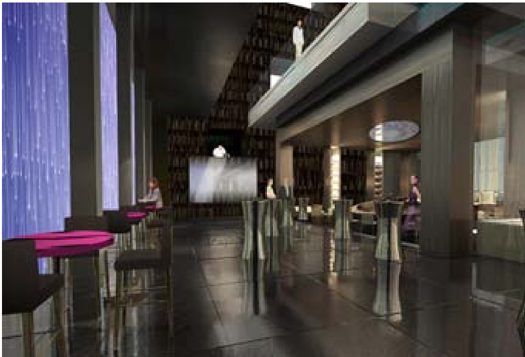
Rendering of lounge area

Innovative installations will be found throughout W Guangzhou, including the stunning three-story “Luminous WaterWall” in the entrance of the hotel. Developed by WETDesign, the piece has been inspired by impressionist paintings and is a liquid mosaic of light, lines and color that evolve, entwine and collide to create a vibrant, dynamic entry.