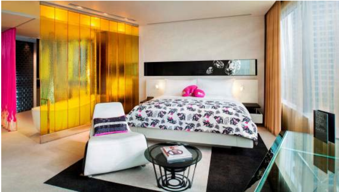
Rooms feature custom-designed chrome furniture.