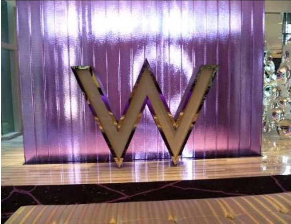
Signature "W" in the lobby area.