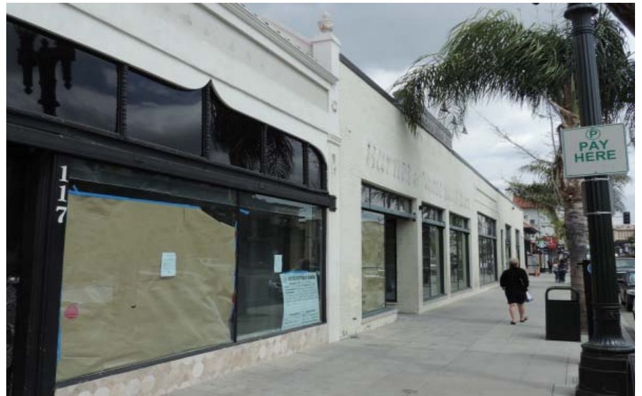
Van's selection of Beatles' Yellow submarine shoes. Barnes & Noble will be replaced by Tesla car dealer.