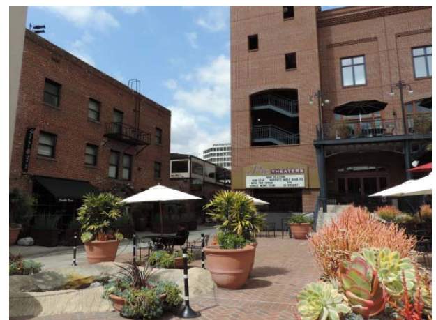
Japanese restaurants and sushi shops like Gyu-kaku are very popular.