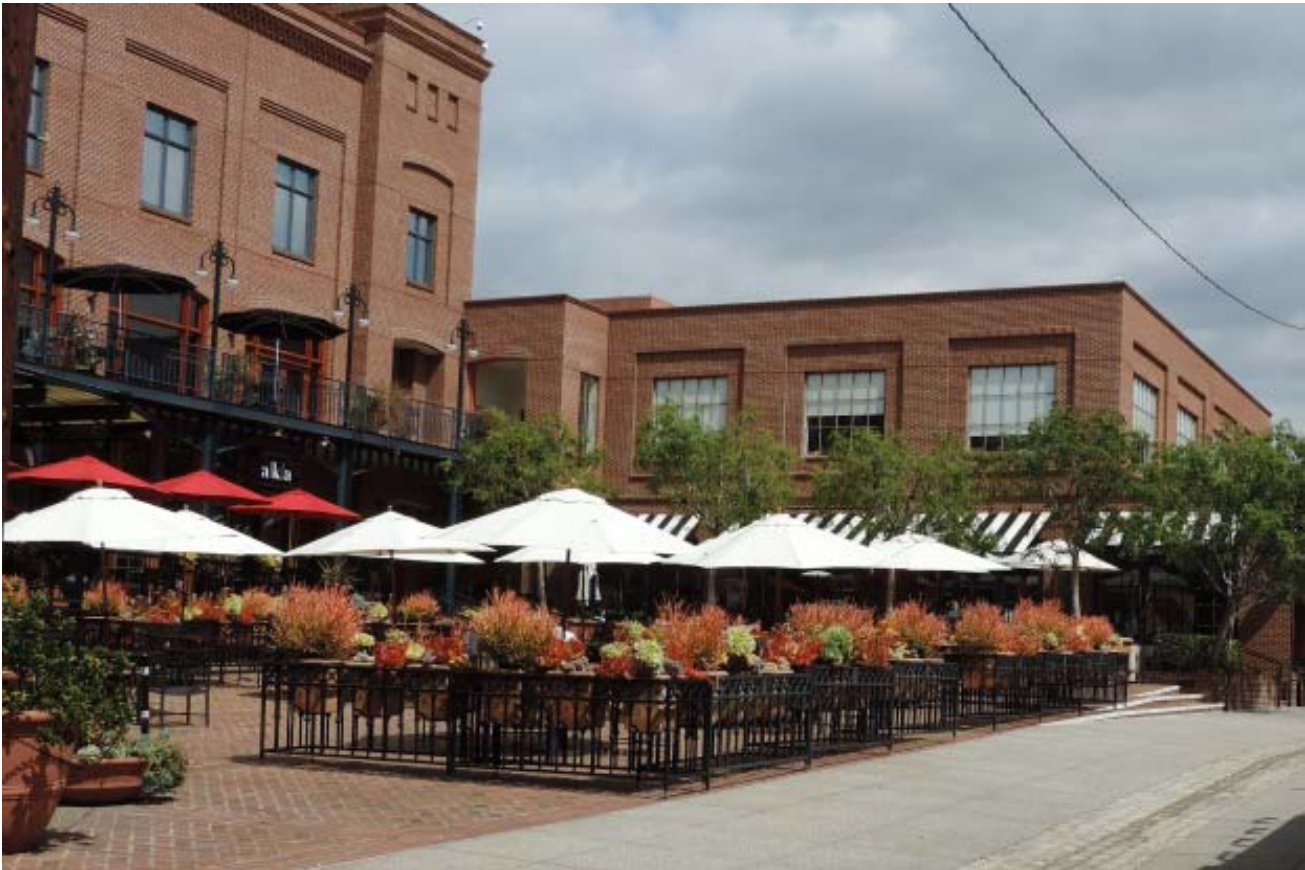
Restaurant Il Forno and old buildings with outdoor seating.