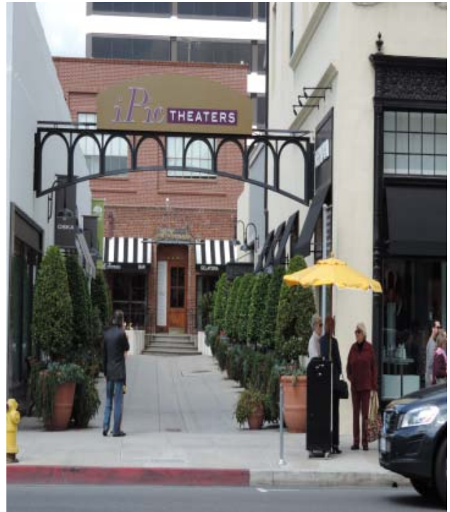
Alleys in Old Pasadena. iPic (right pictures) is a movie theater with dinner served during the show.