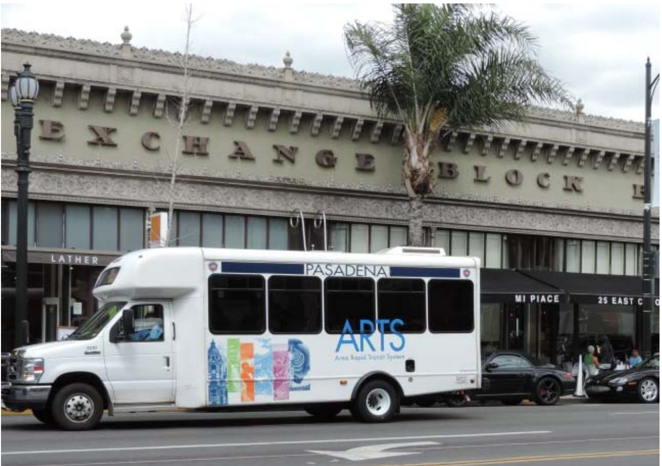
The bus called 'chiibus' in front of the popular Italian restaurant Mi Piacce.