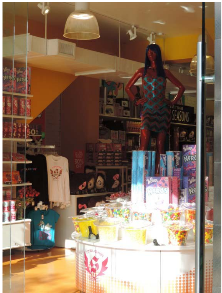
The facade of the candy store IT'S SUGAR offers a grey and pink color scheme with a colorful window display.