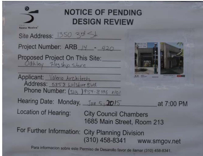
Example of a Notice of Pending Design Review published on the front facade of the building on the left. The notice explains that the new store will be Oakley Flagship Store.