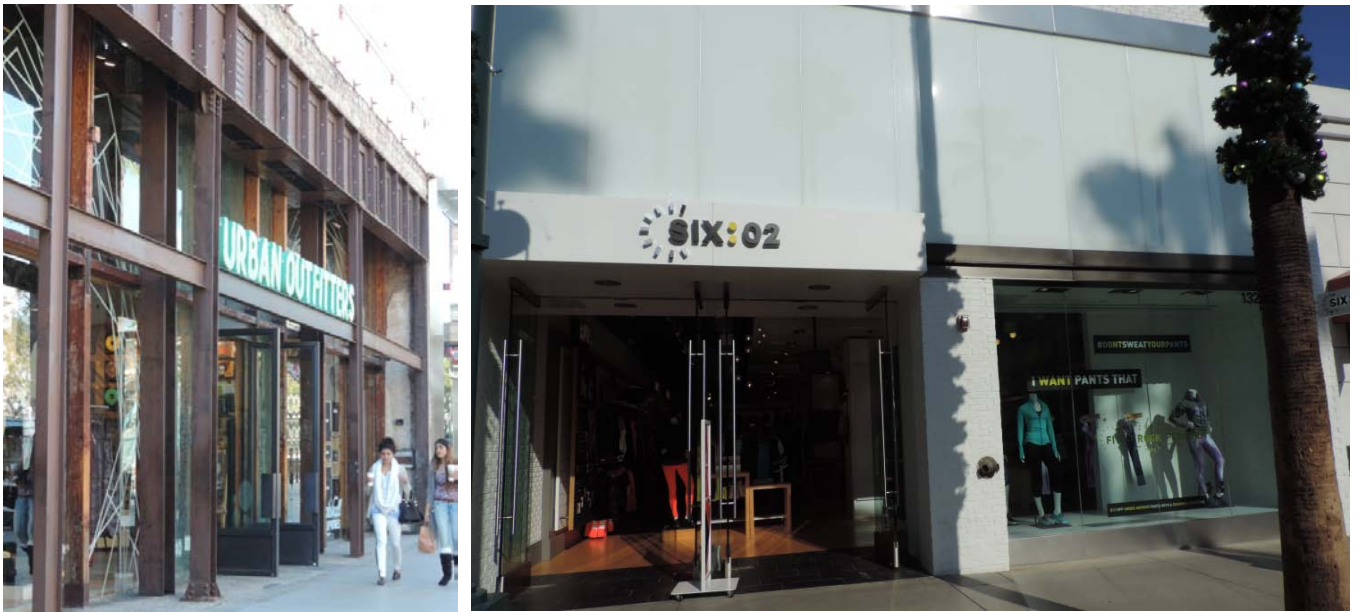
On the left, the facade with a modern steel structure of Urban Outfitters's store.