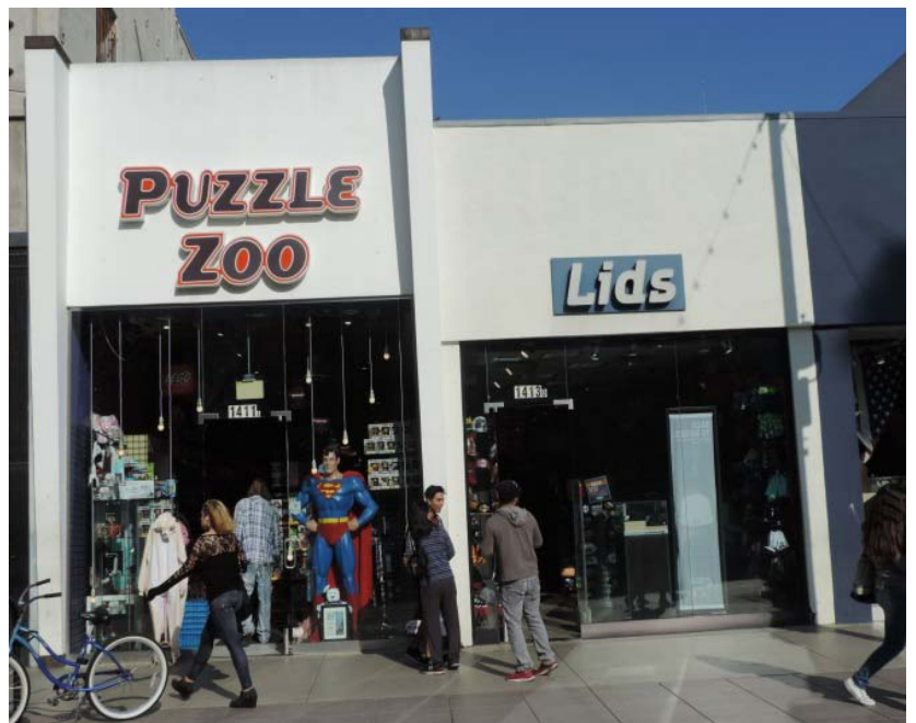
Several facades of local stores such as Puzzle Zoo and Forever 21.