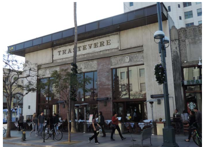
On the left, the facade of the Japanese convenience store Famima!! with outdoor dining. On the right, the facade of Trastevere, an Italian restaurant in Santa Monica. The building was an old branch of Savings & Loan.