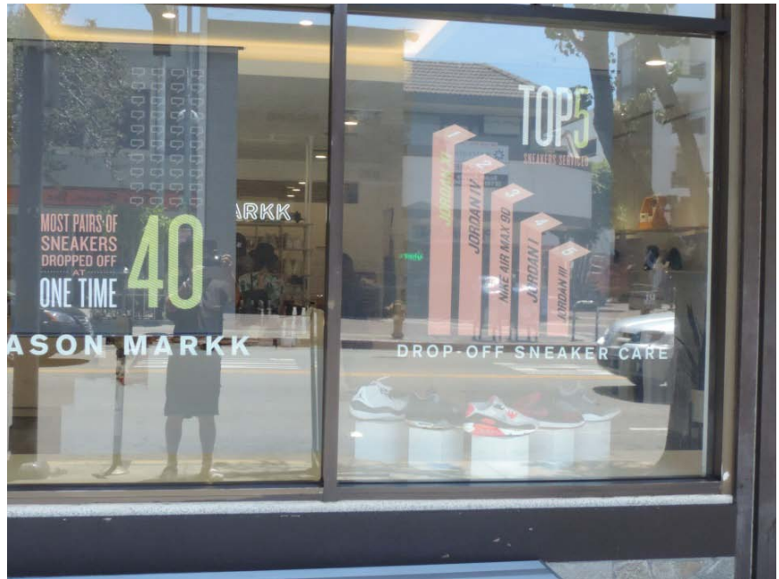
Shoe-shining chair and graphic design on the shopping window.