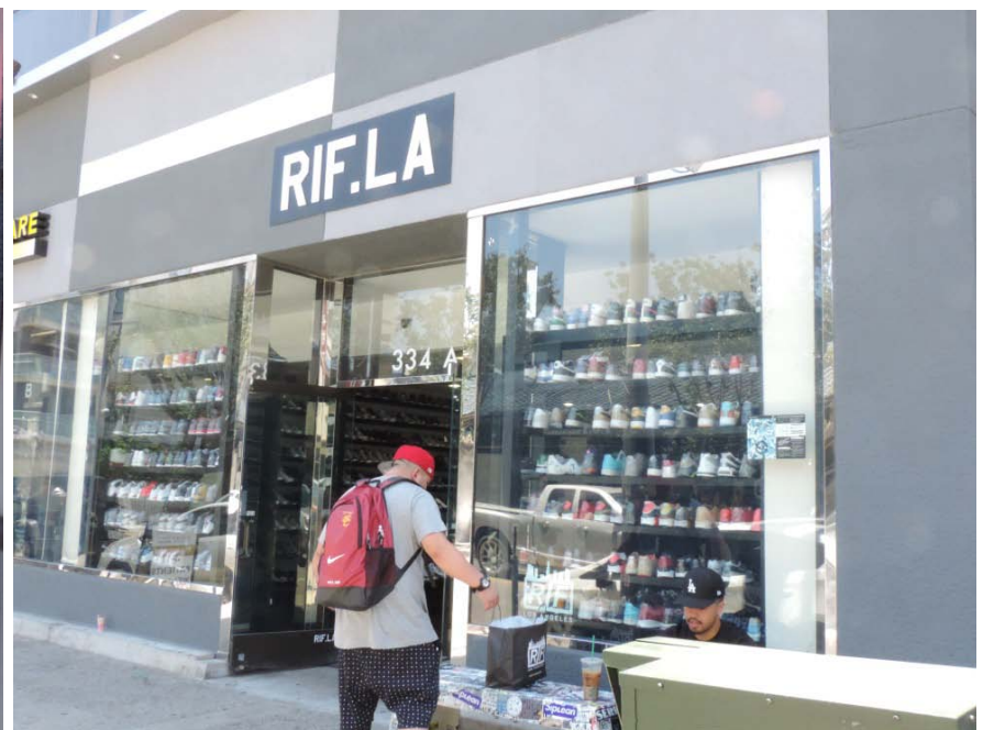
Other two shoe stores in Little Tokyo: one with Japanese design and the other called RIF.LA store