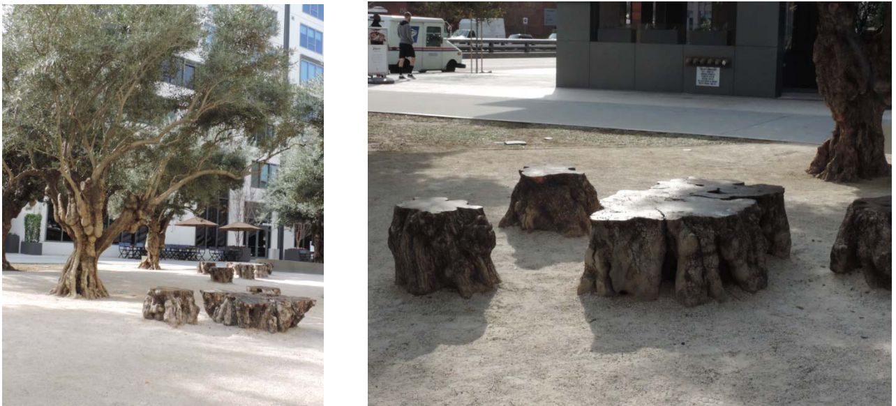
Ancient olive trees decorate the small park covered with pressed sand. Wooden benches were made using tree trunks as seating positions. The layout resembles the Zen rock garden in Ryoanji in Kyoto.