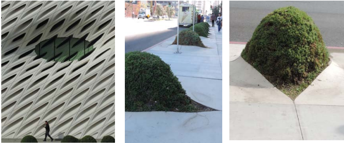
The pedestrian pavement in front of The Broad Museum features green mounds that emerges from the ground.