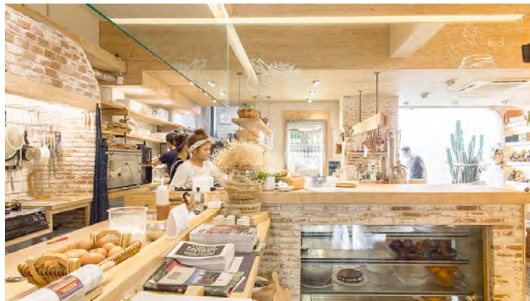
The interior has a rustic vibe and is basked in natural light.