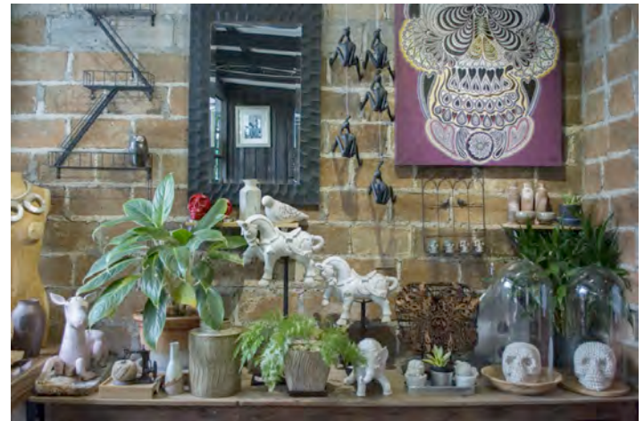
On display at the art gallery is a curated selection of Thai fine artists, while the artisan craft shop sells a mish-mash of home décor products and fashion.