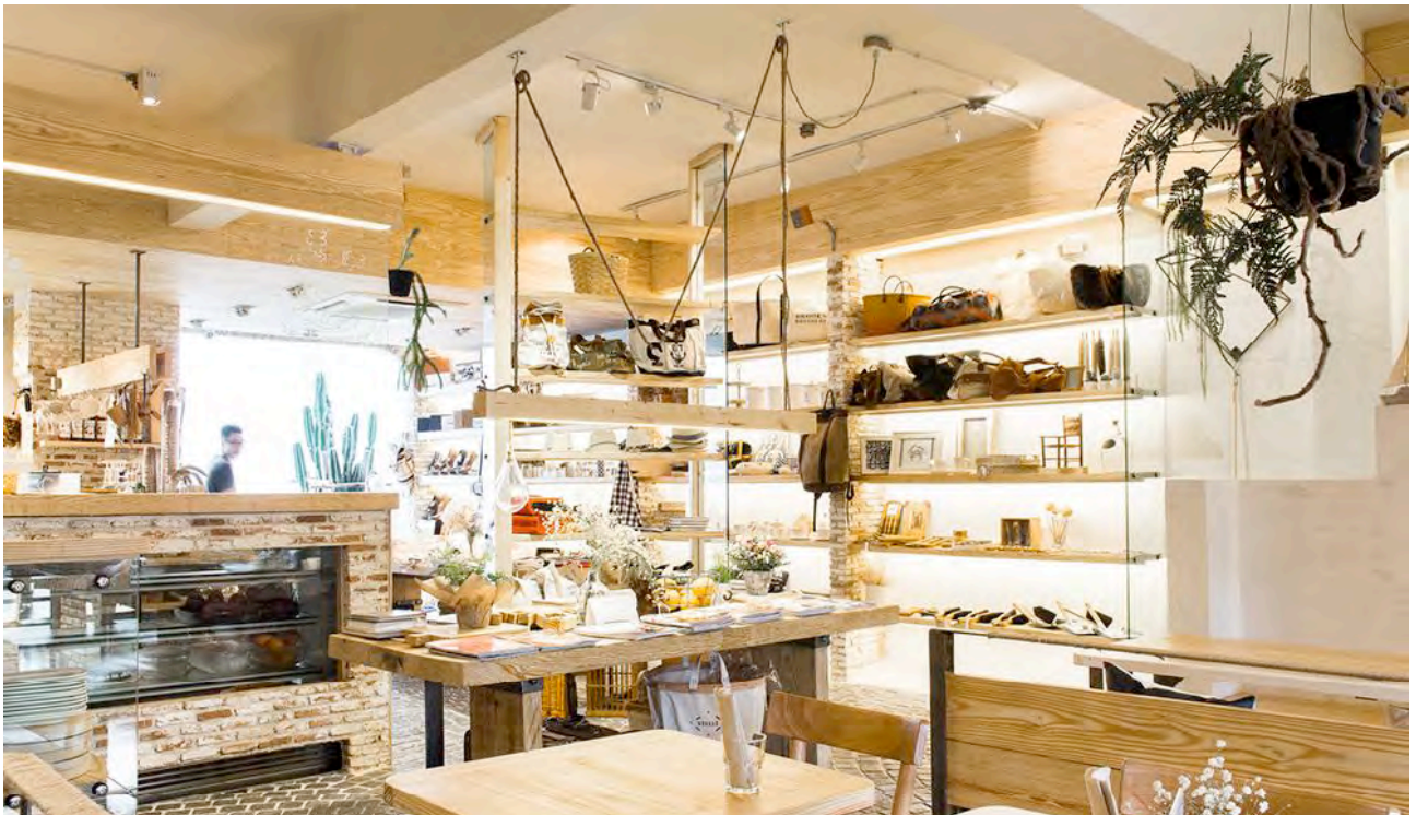
The restaurant was designed to resemble the inside of a house in Portland, Oregon.