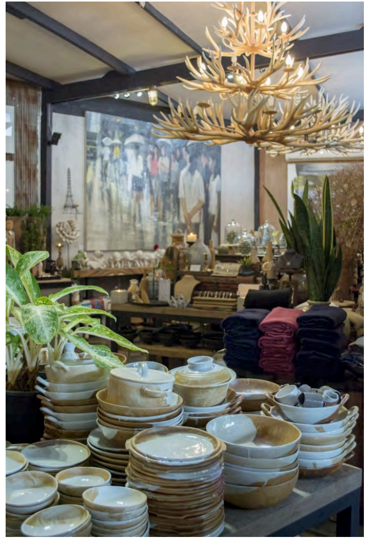
The complex also houses an art gallery and ceramics store.