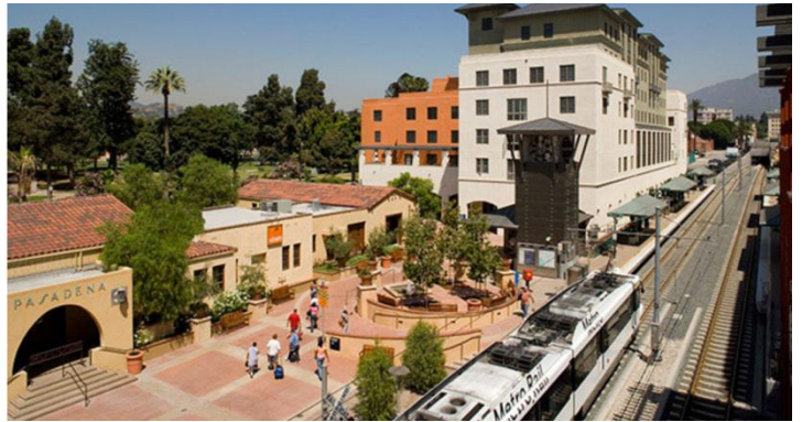
Parallel to the station, the restaurants