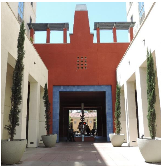
Approaching Del Mar station, view on the apartment units