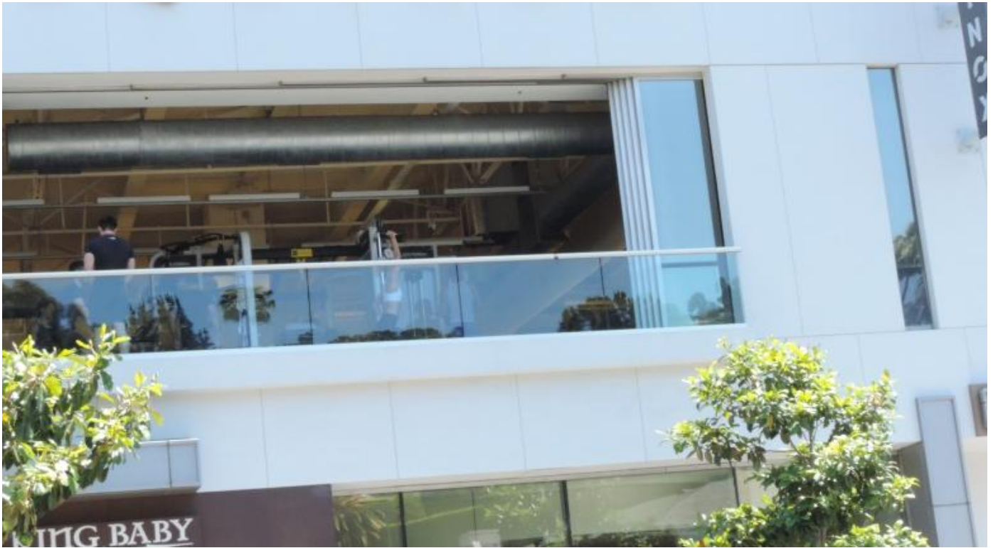
Illustration of one of the gym clubs