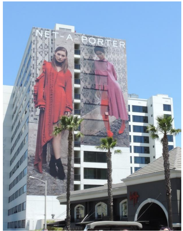
Advertising on the strip