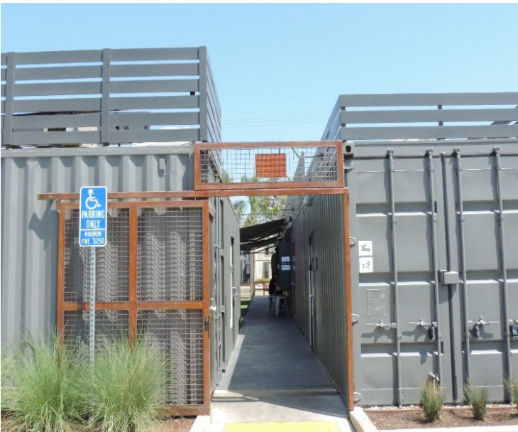
View from the exterior, entrance.