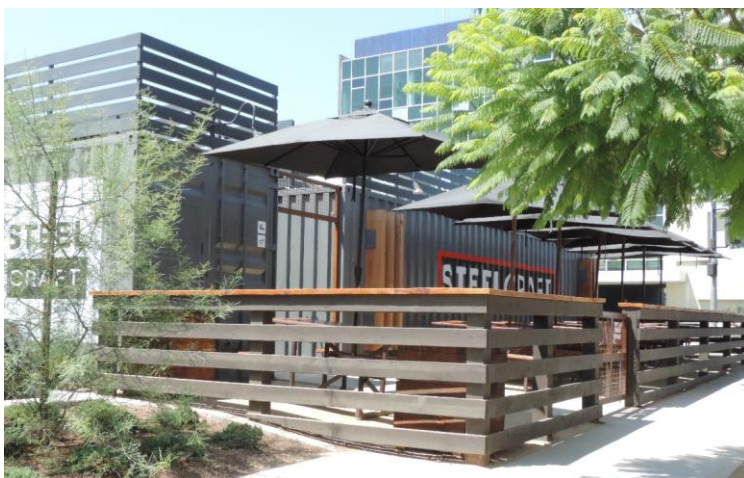
Some more seats