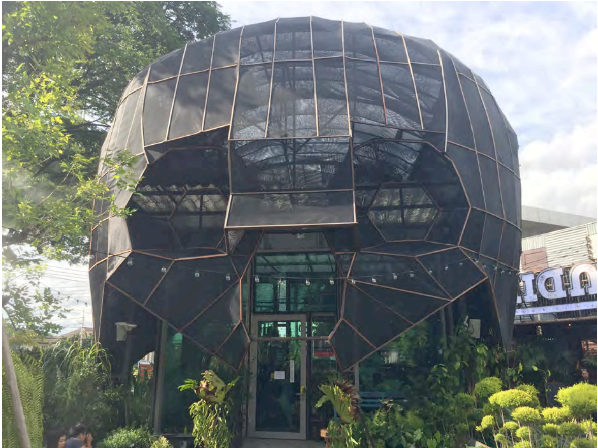
This funky façade hides a plant store.