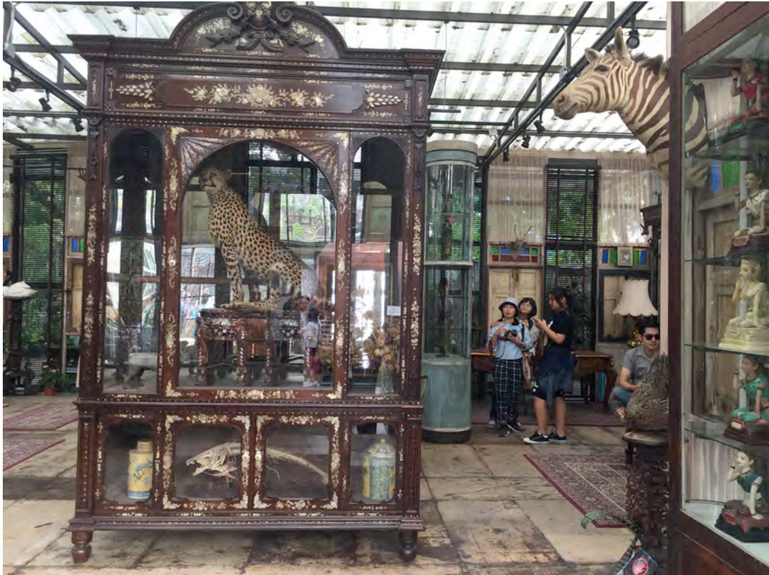
Interesting stores include a “cabinet of curiosities” type shop (above & below).