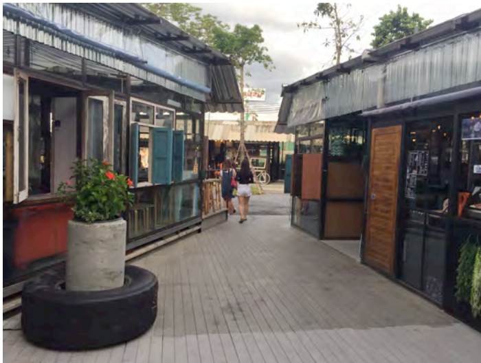
Roofs are made from sheet metal.