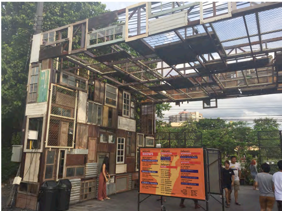
Entrance to ChangChui, all constructed from recycled doors and windows.