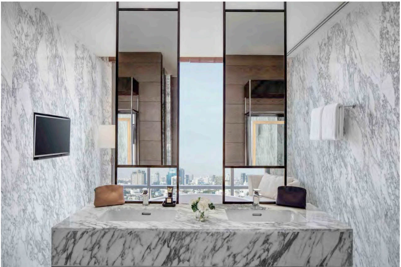
Thonburi Suite bathroom