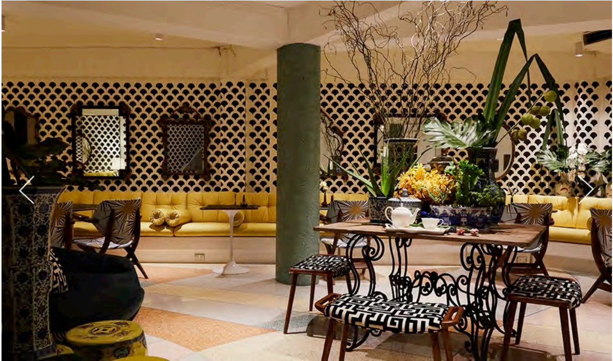
The space's terrazzo floors and mid-century furniture pieces are upholstered in velvet or bold, graphic prints.