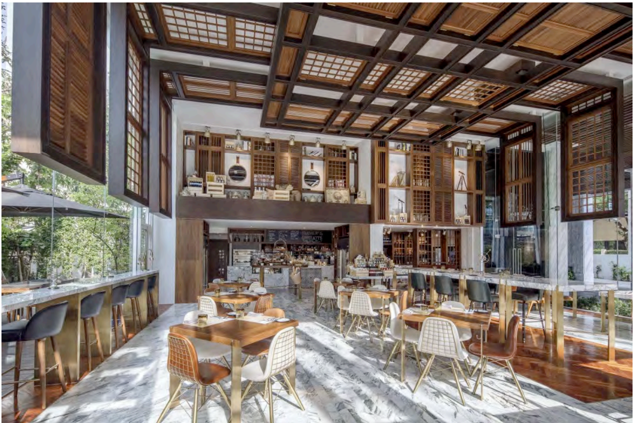
Bangkok Trading Post Bistro &amp; Deli