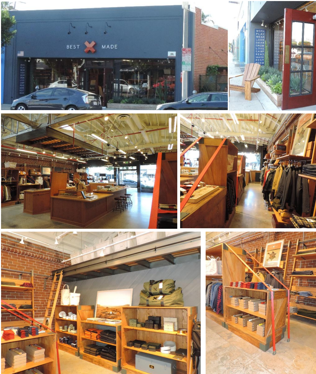
Orange strap used in the store were used to be a real cotton strap to tie down the wooden crate on the boat and as the picture shows this strap is really anchored to the concrete floor. (Best Made)