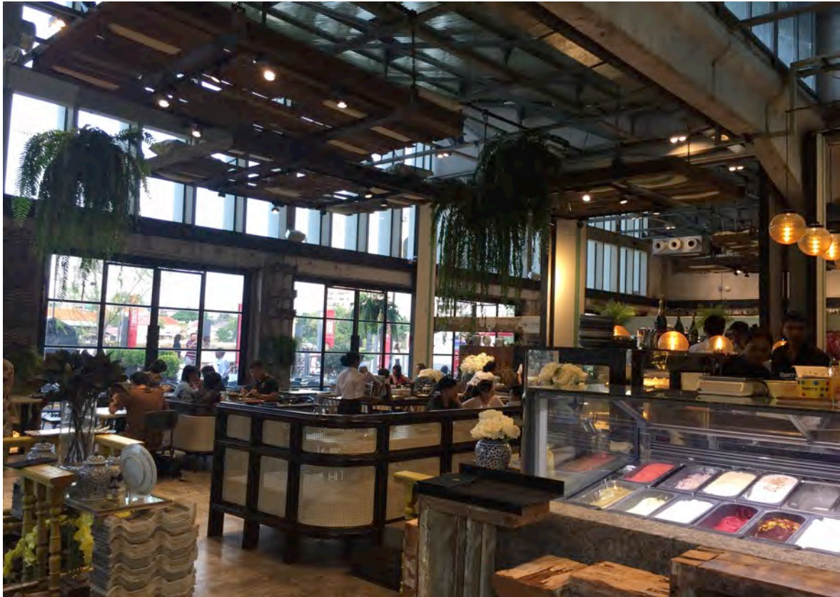
Riverside restaurant Rong Si.