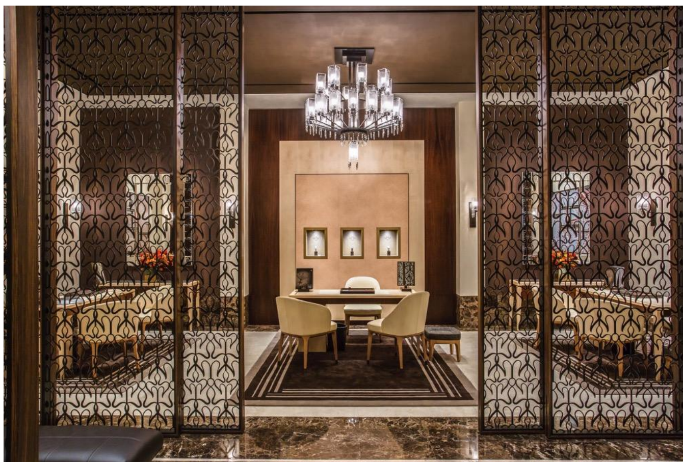
The boutique features a majestic a 5-meter high ceiling adorned with special lighting and a bespoke Baccarat crystal chandelier.