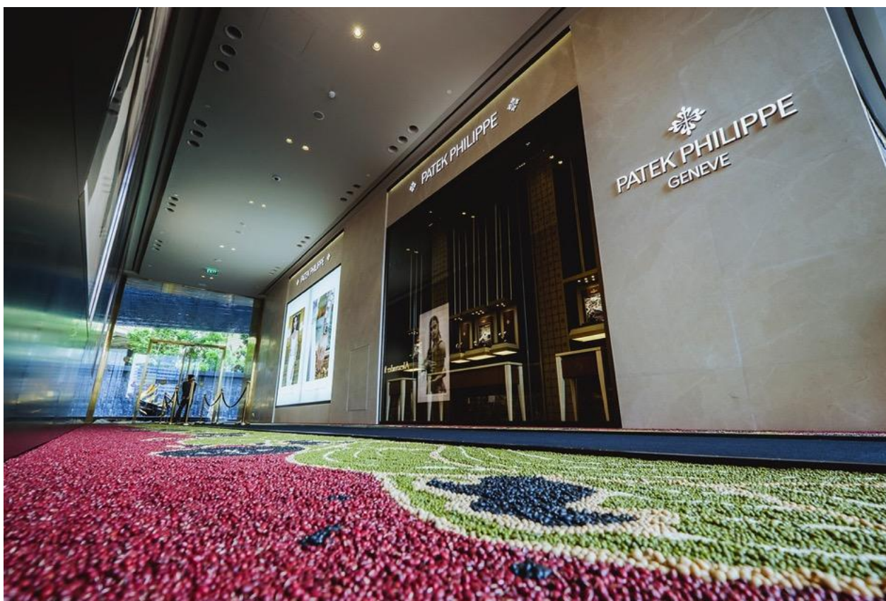
The boutique has a 50-meter façade fitted with a large animated screen backed by a special glass wall with the brand's emblematic Calatrava cross etched in the glass.