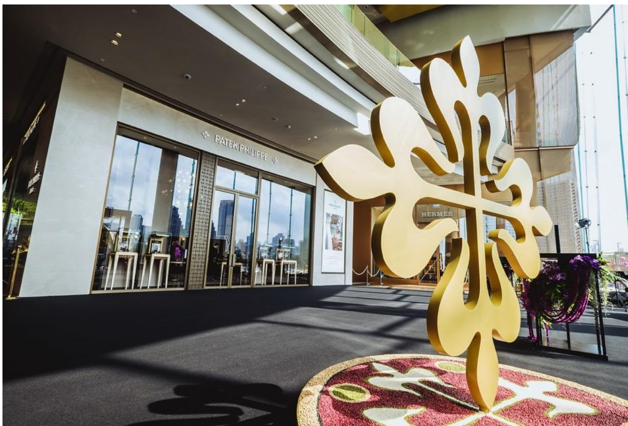
The brand's emblematic Calatrava cross.