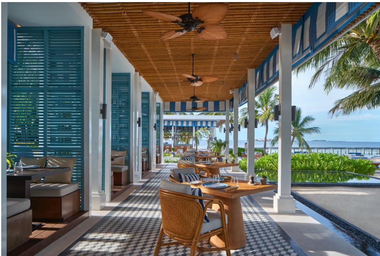
A nod to Raffles' distinct colonial style, striped monsoon blinds and louvered doors and windows, all in a signature grey-blue shade, punctuate public and private spaces.