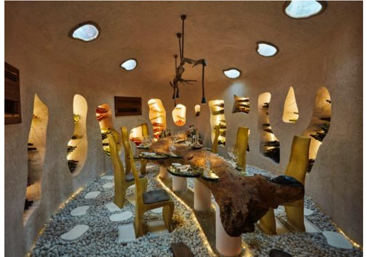
Restaurant and underwater wine cellar.