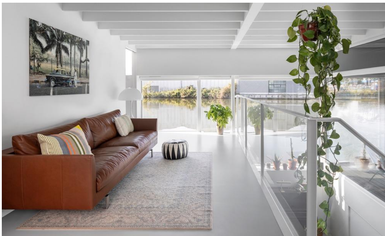
The interior and facade play with the views on the outside.