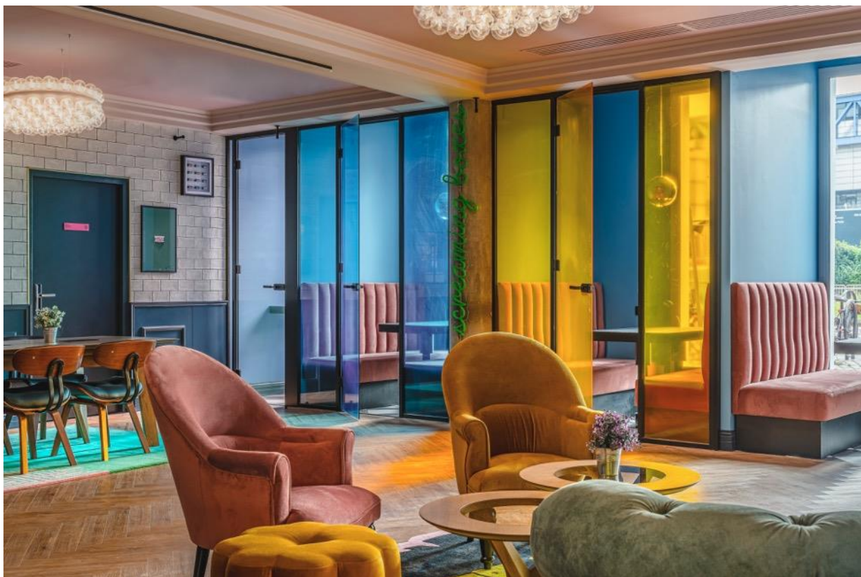
The colorful and nostalgic interior reminiscent of the 1980s transports guests back in time.