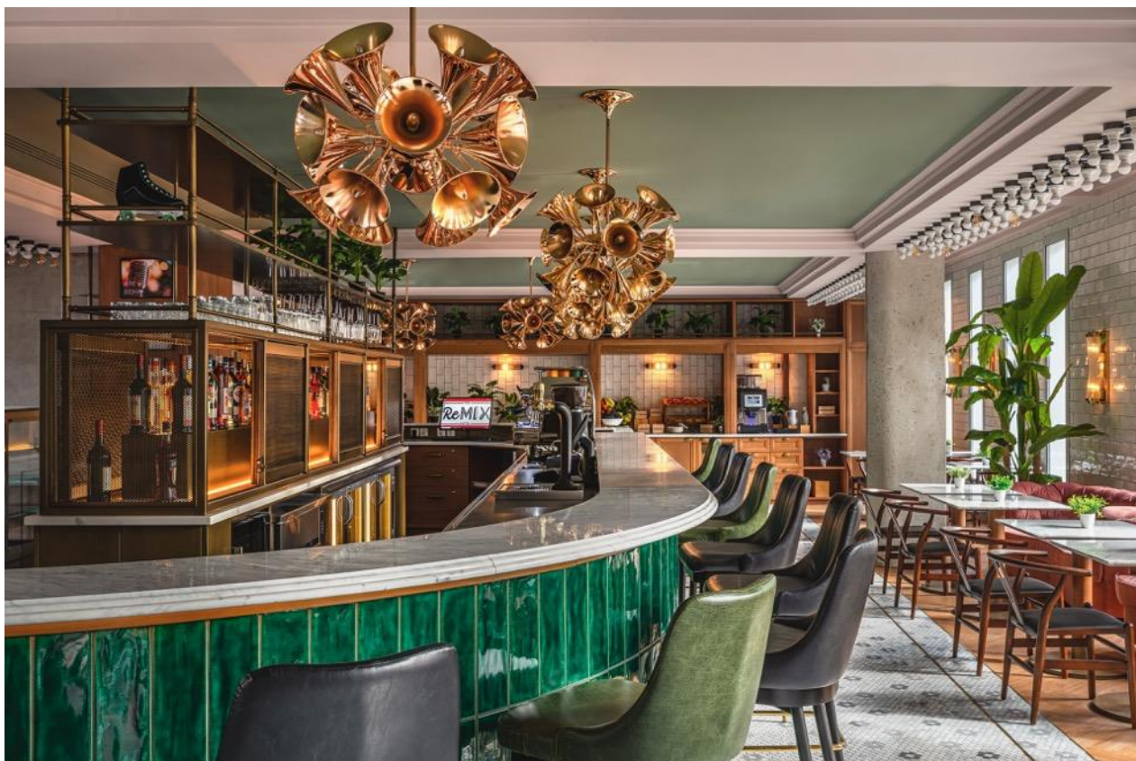
Bar-restaurant Marvin & the Gang has a separate entrance on Corentin Cariou street and looks set to become a local hotspot.