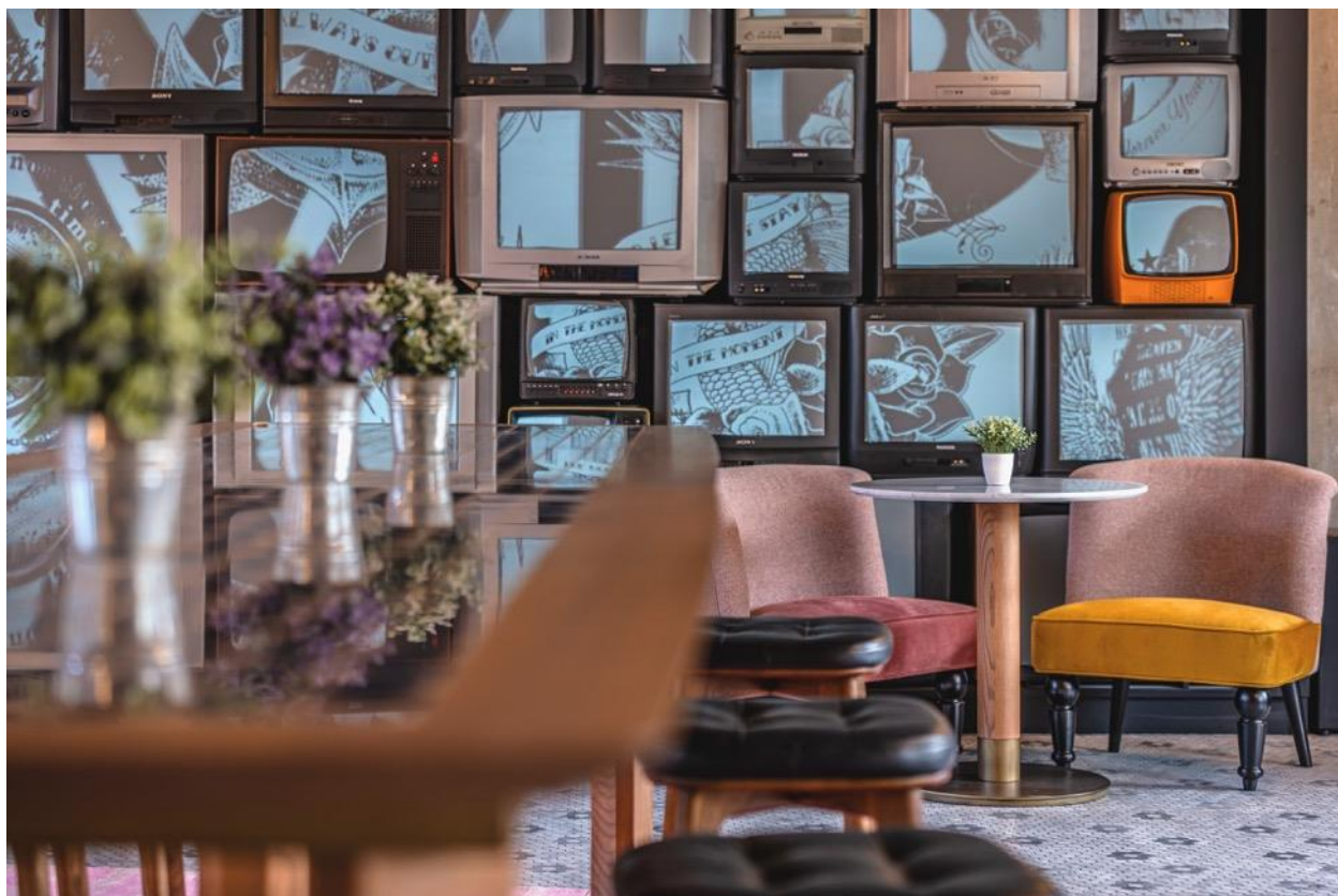
A wall of old, analogue televisions stacked upon each other broadcast 24-hour content through advanced video mapping technology.