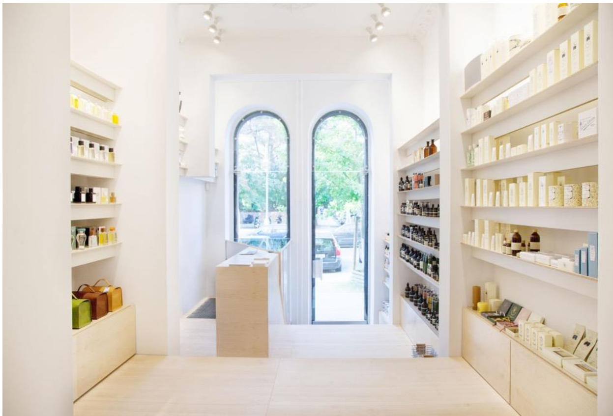
The store's design was also influenced by the year 2020, when there was a growing need for beautiful items, small furnishings, objects and jewelry as a result of the newly discovered domesticity.