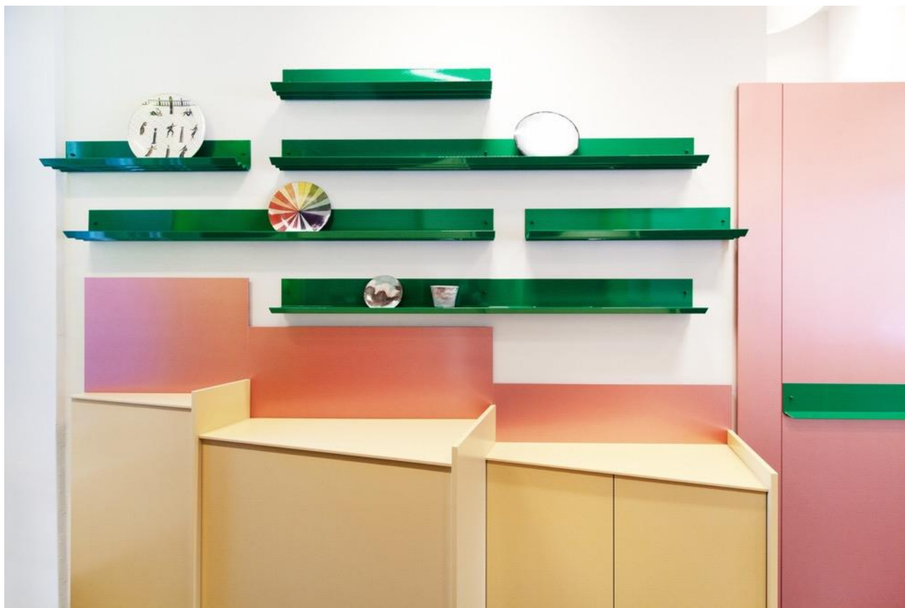
MDC Next Door is designed and managed as a cabinet of curiosities for objects for everyday use.