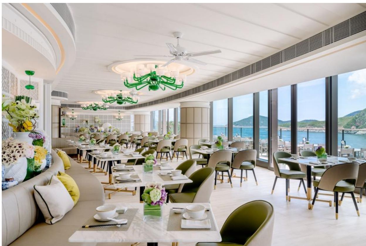
The Satay Inn.