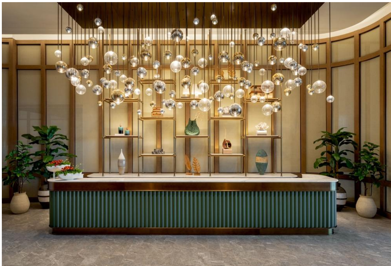
The group check-in counter.