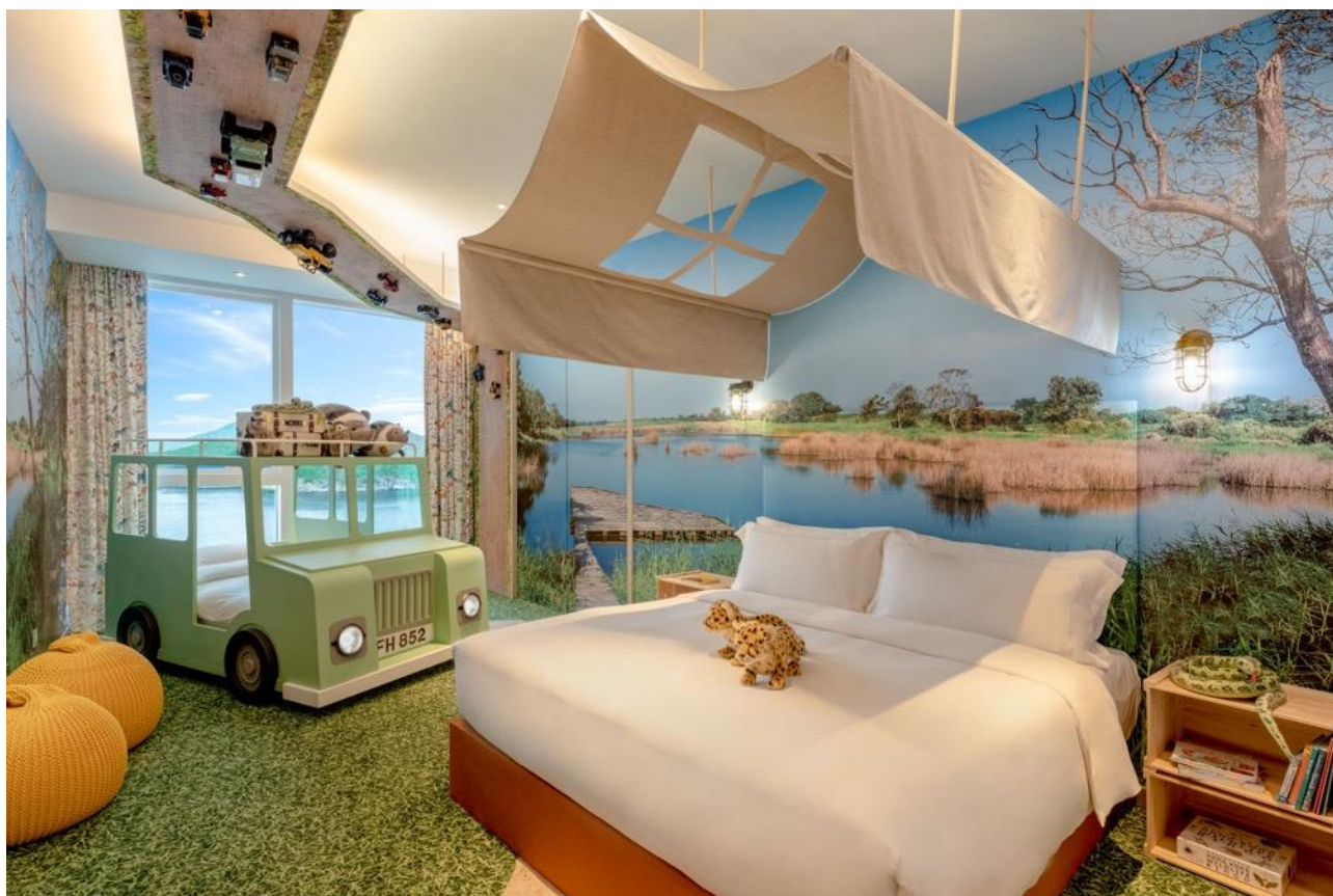
The hotel features 9 different kids-themed rooms to attract families.