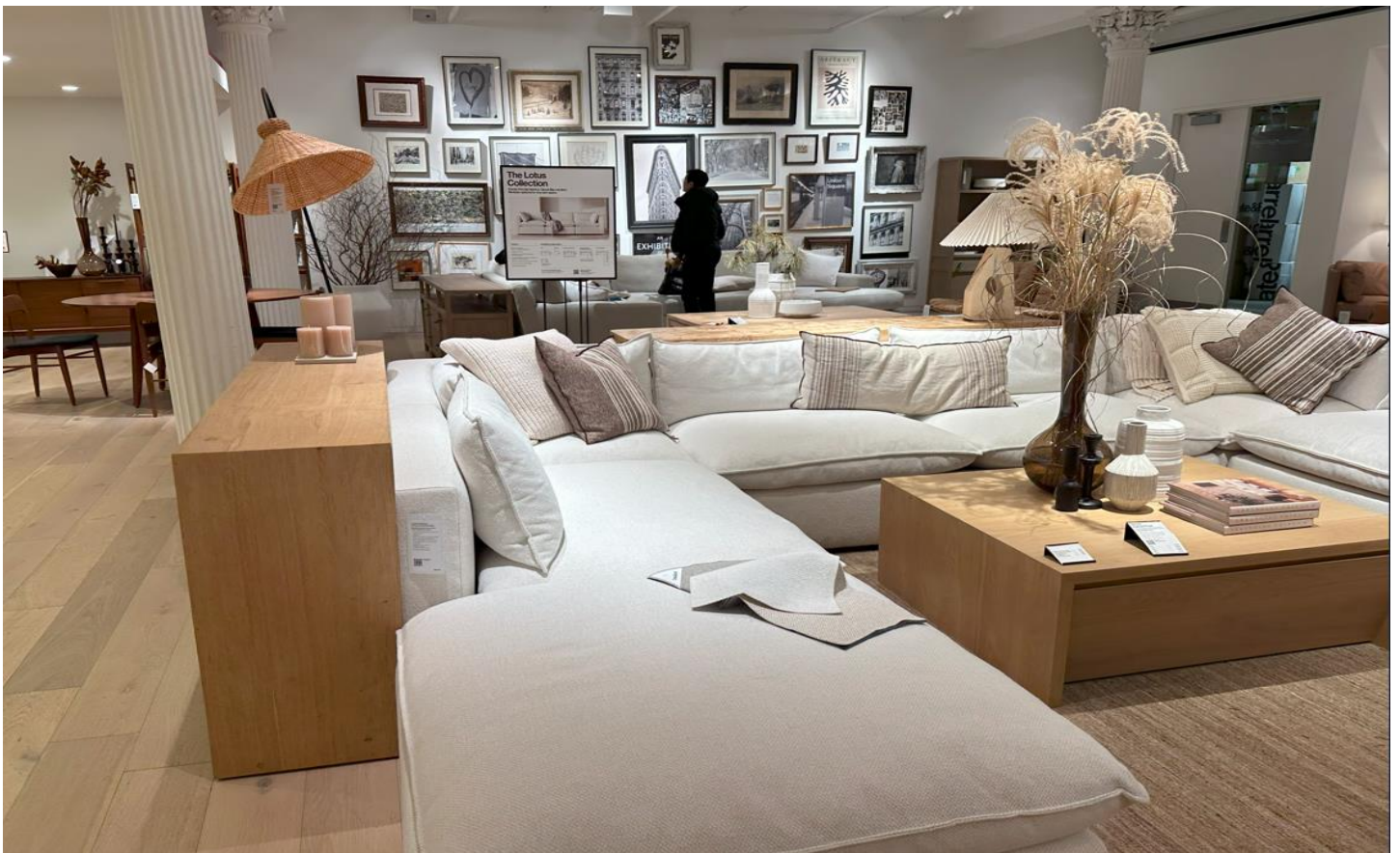
New York-style simple modern theme.