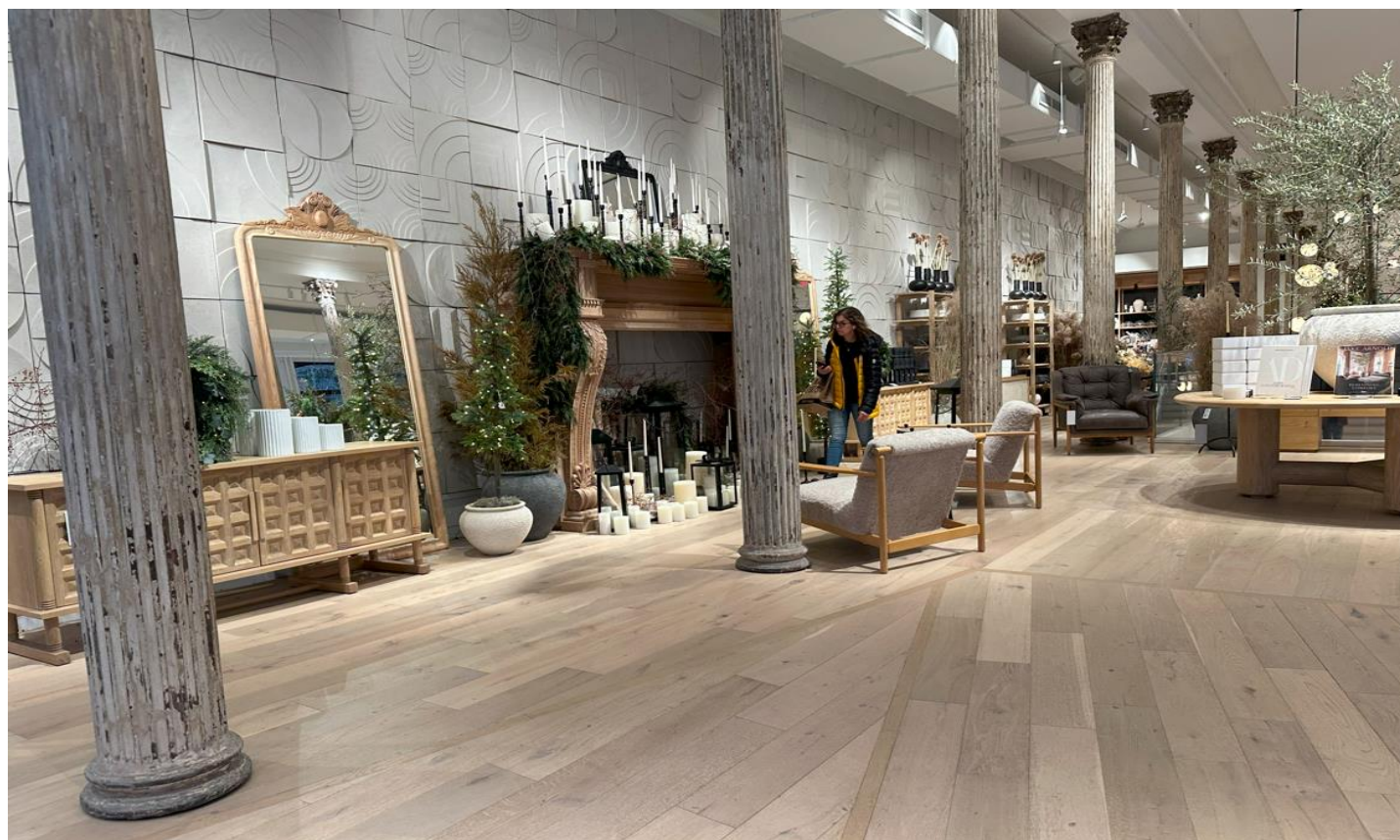
Interior design with original columns