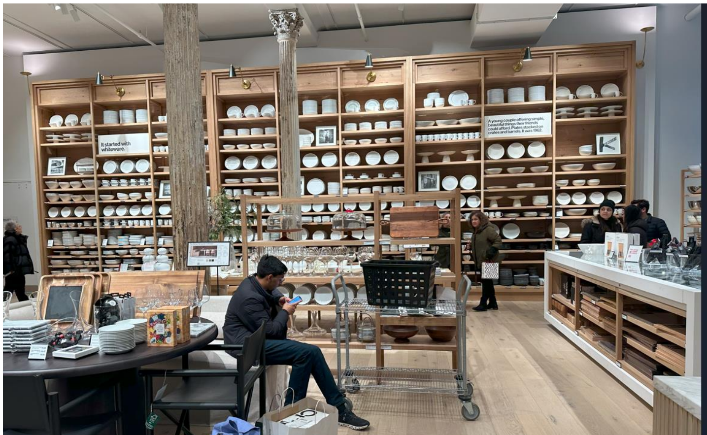
Best-selling, simple, and reasonably priced tableware