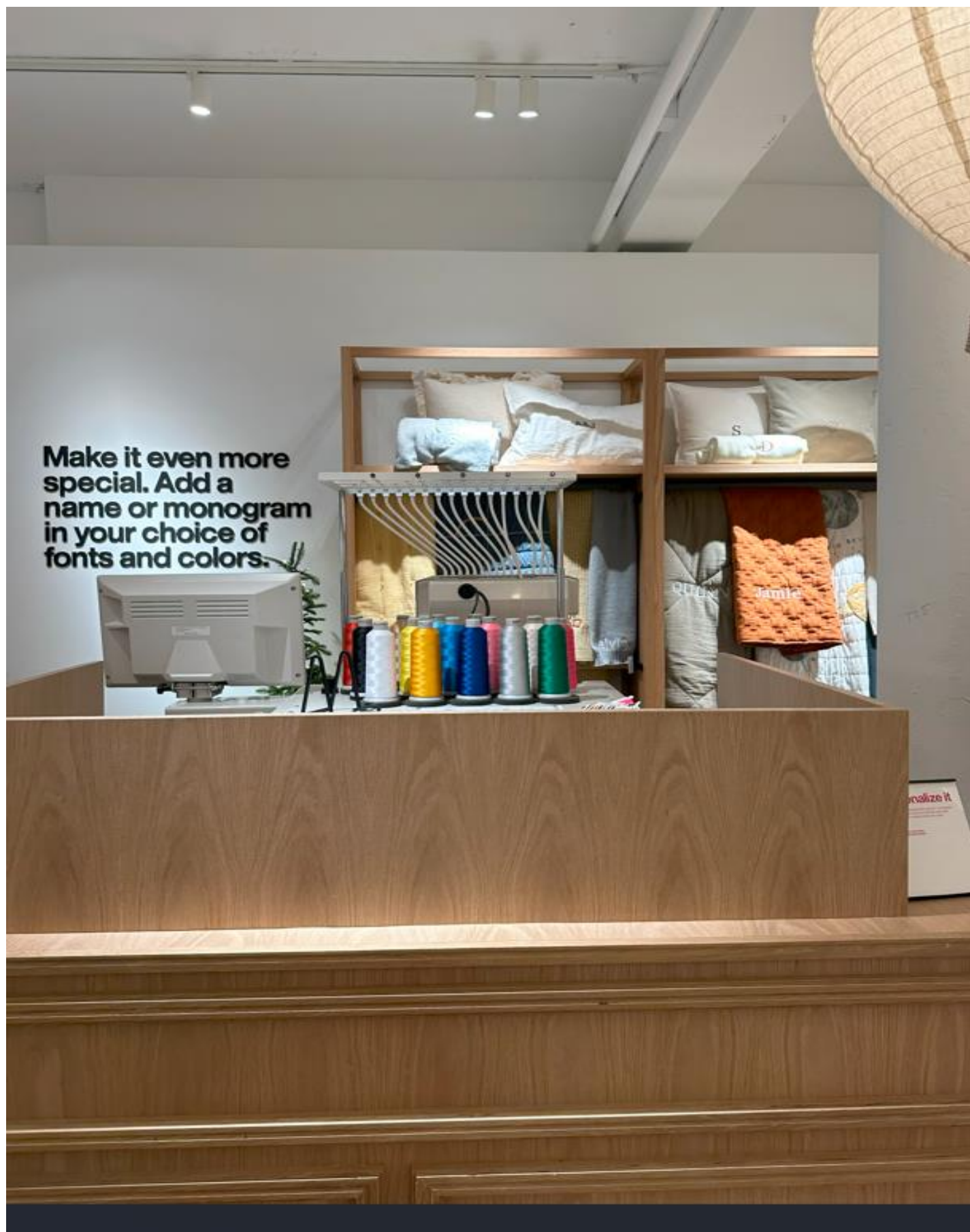
Monogramming service on blankets and linens