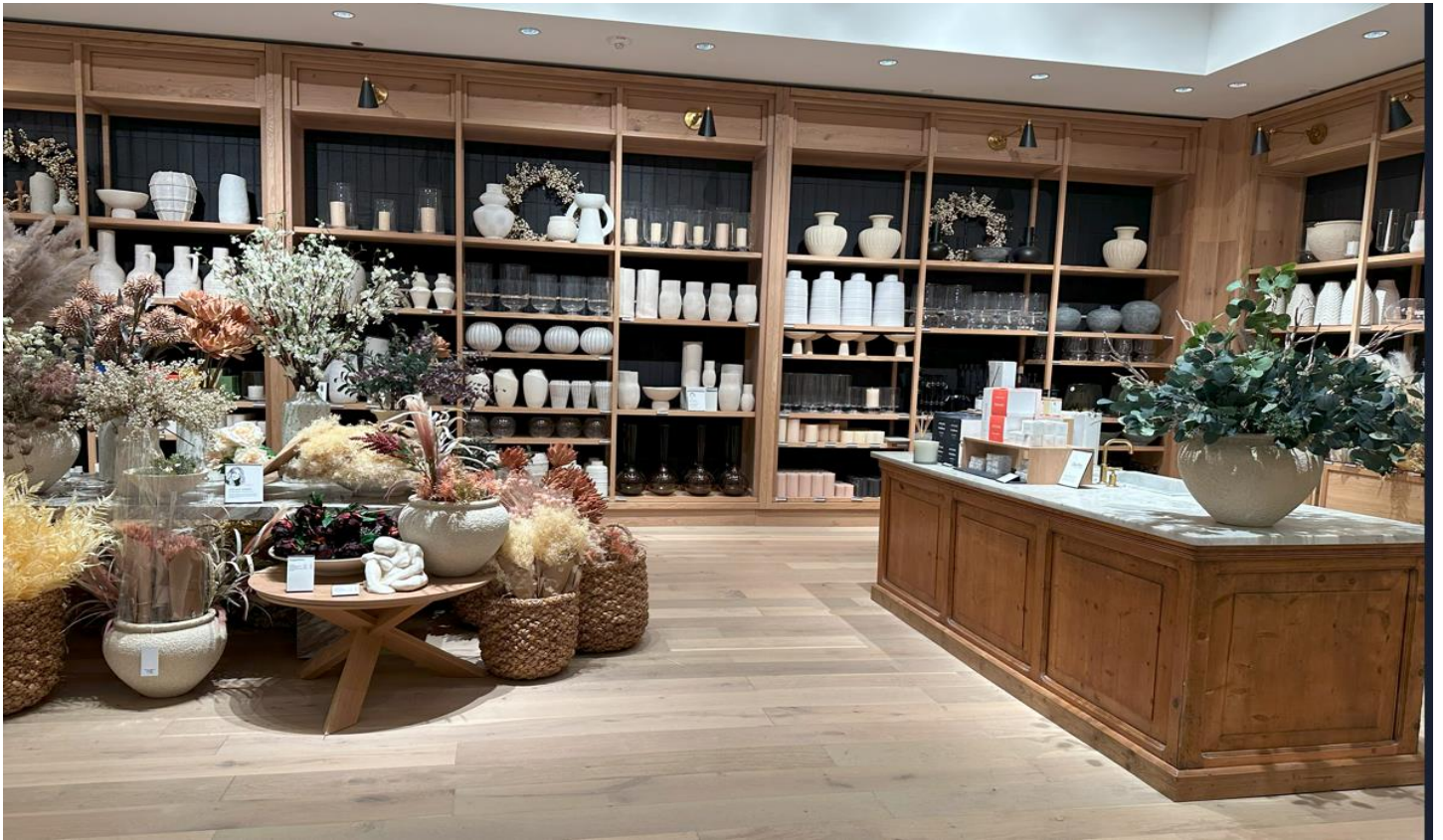
Professional advice is available at the Flower Corner.