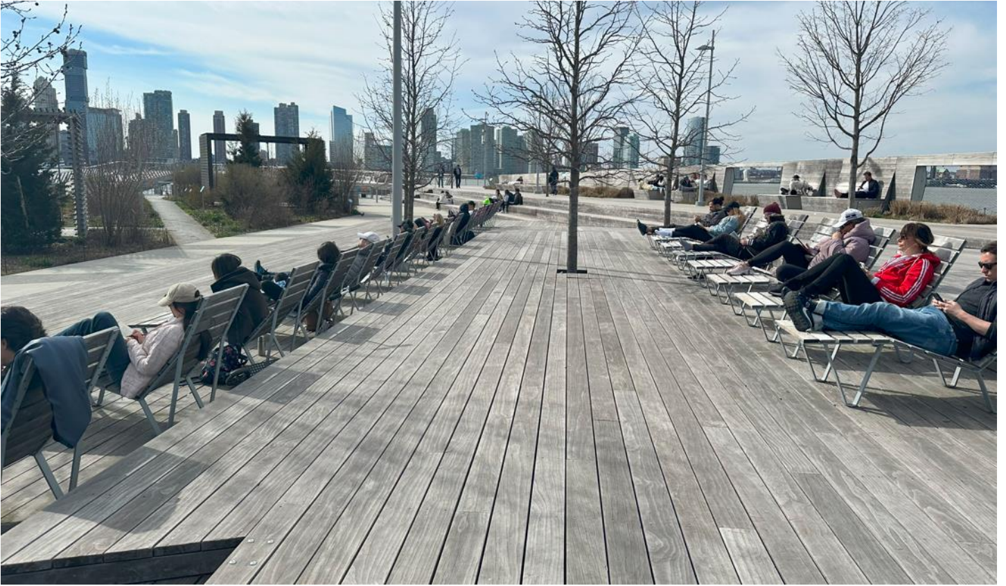
During the summer, people in swimsuits also come to the sunbathing deck.