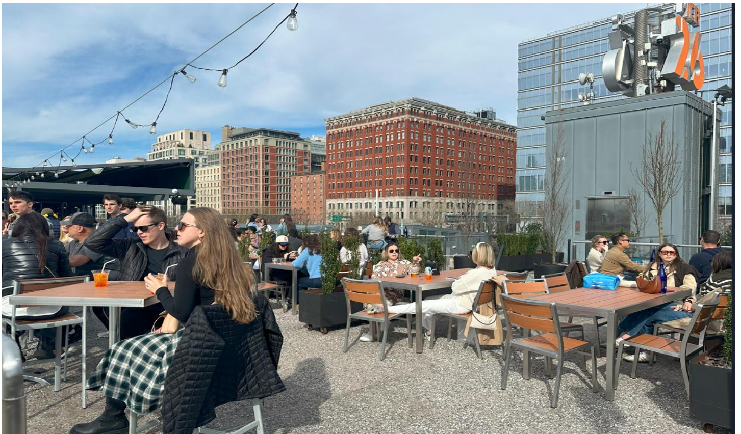
From the rooftop of the scenic winery, you can see all the way to New Jersey across the Hudson River.