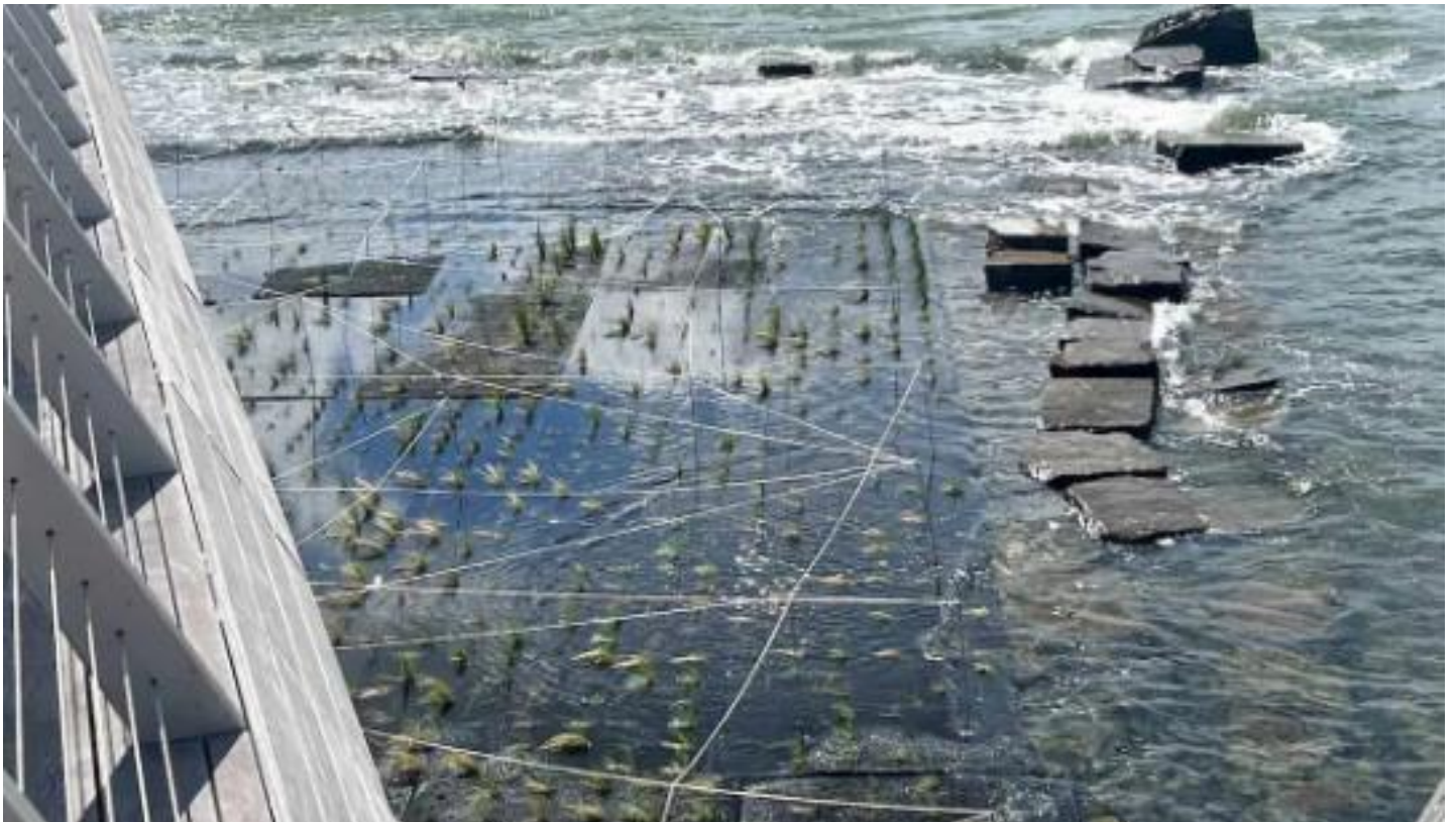
Various organisms inhabit the artificially created wetlands.