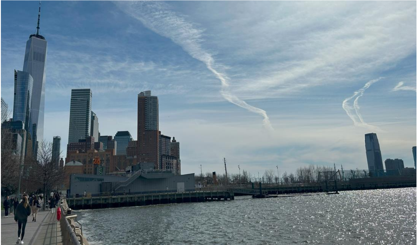
Pier 26, located in the Tribeca neighborhood at the southern tip of Manhattan.