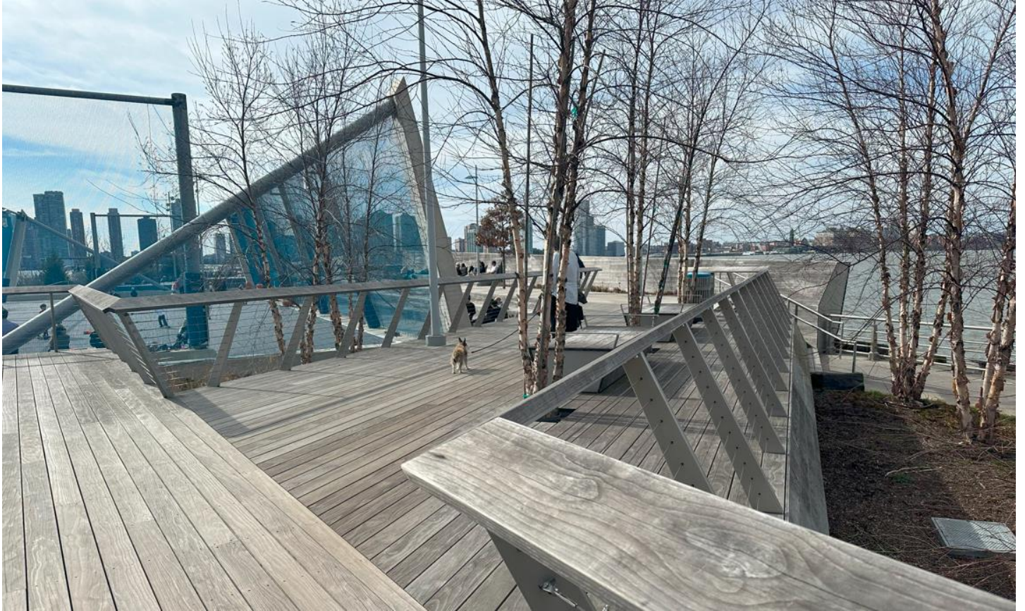
A wooden deck extends, allowing visitors to walk all the way to the tip of the pier.