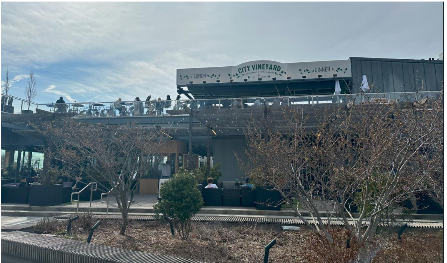
A winery bar and restaurant that also conducts wine fermentation on-site within the facility.