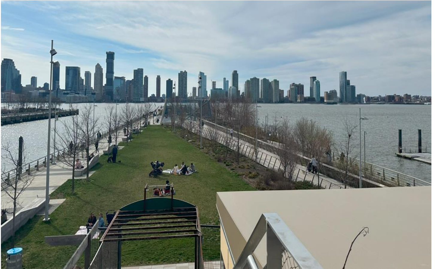
From a bird's-eye view, it's evident that the elongated pier has been converted into a park.