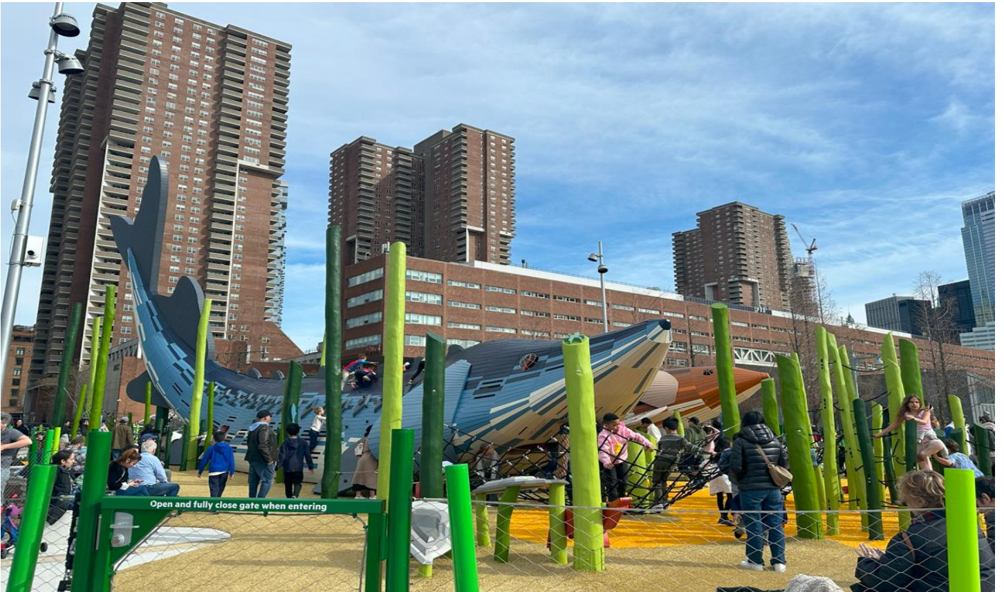
Play structures resembling sturgeons situated in the Hudson River, where visitors can enter and explore.