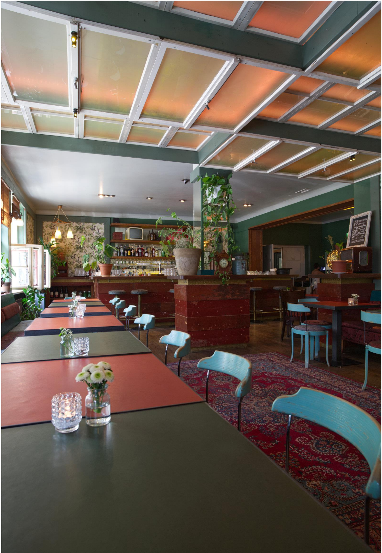
Above: The interior is decorated in green and soothing red tones. To keep it from becoming too dark, light blue chairs and ceiling window panes add bright accents.