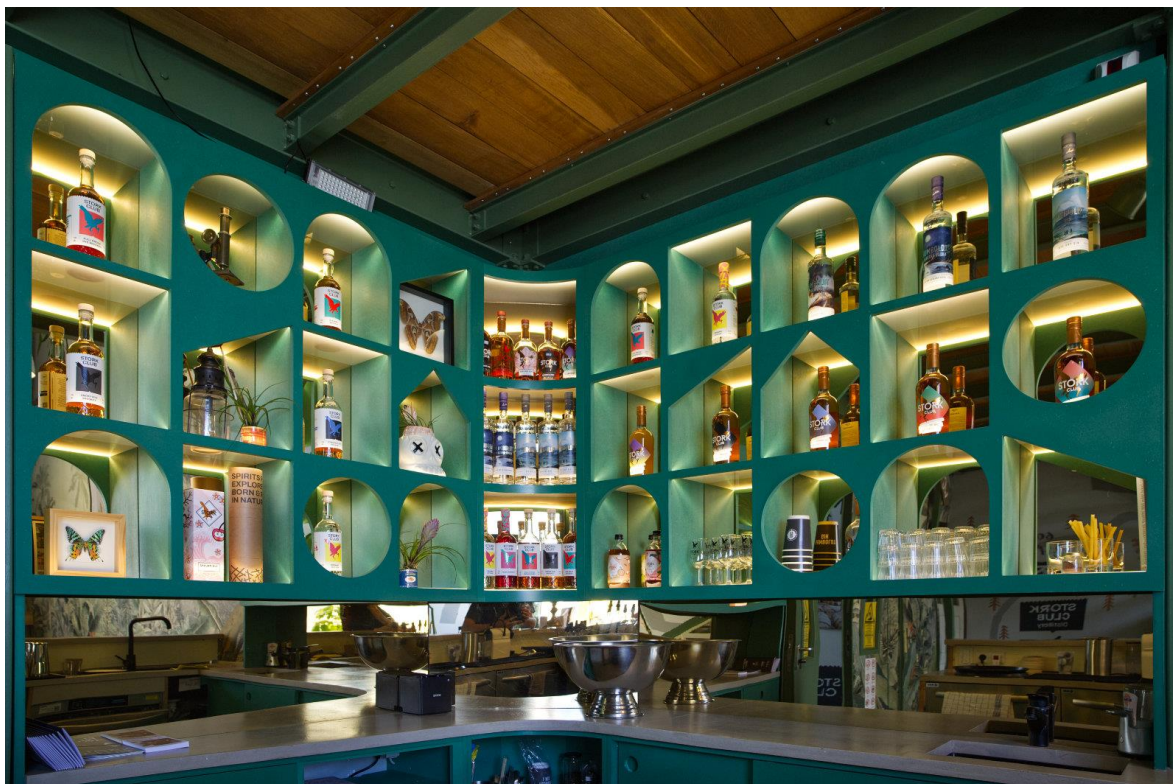
Above: bar shelves pop the shape of the opening. Bottom right: A staircase connects the first floor, which opens fully to the street, to the salon-style mezzanine. Bottom left: Vintage furniture on the mezzanine floor.