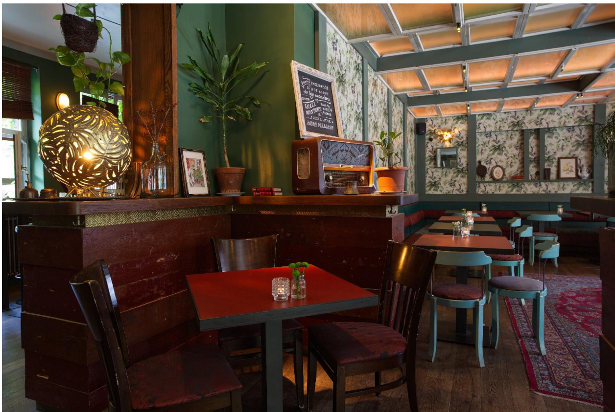
Above: Scattered antique objects and greenery. Below: The hall in the back is partially raised with a platform to raise the floor, and wooden art works cover the ceiling without oppression, transforming the open space with an 8-meter ceiling into a relaxing, low center of gravity space.