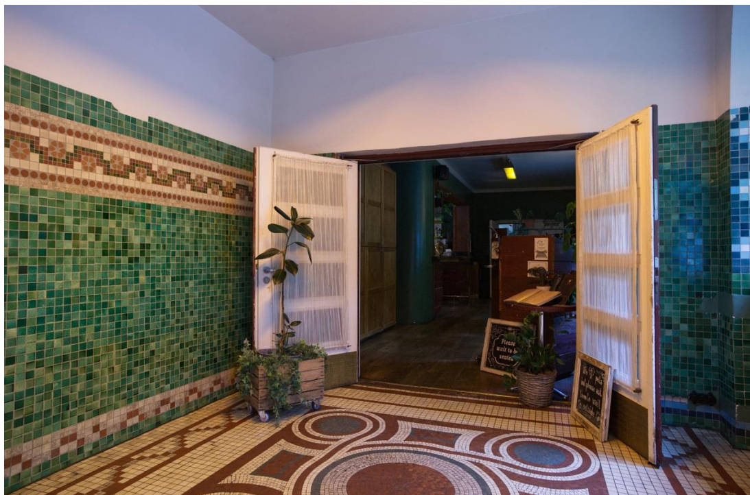
Above: The entrance features a mosaic from the original construction, with red and green as the primary colors. Bottom right: A blindfolded platform is installed in the center of the hall. Bottom left: Old objects are arranged on shelves, creating a partition.