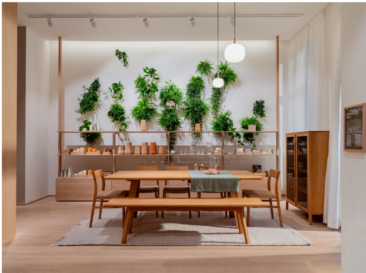
Below: Organic greens in the restaurant are sustained by a specially developed irrigation system