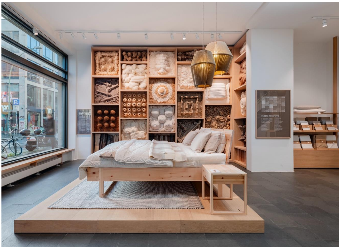
Above: 100% natural mattresses with a wall display of materials such as domestic alpaca, wool, and linen.