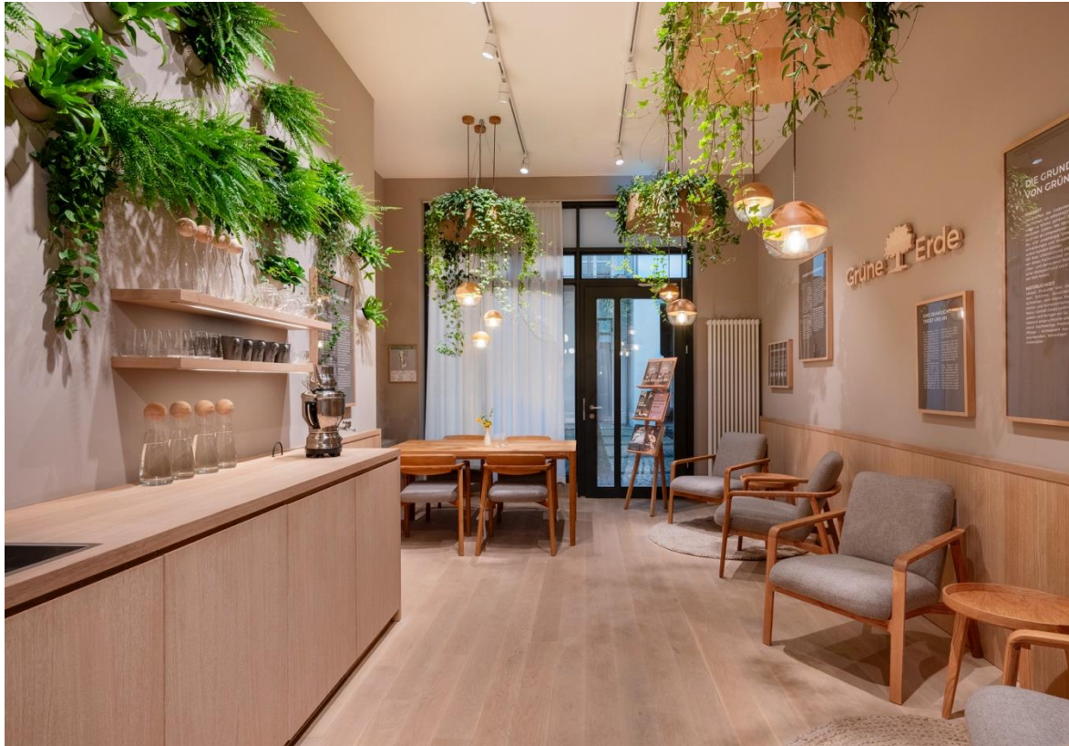
Above: A samovar at the back of the restaurant, where guests can enjoy a drink.