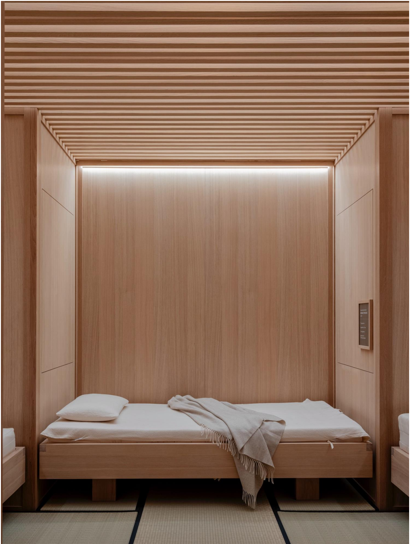
Above: A corner featuring bedding and beds designed in a Japanese style, with Ryokan beds complementing the tatami space.