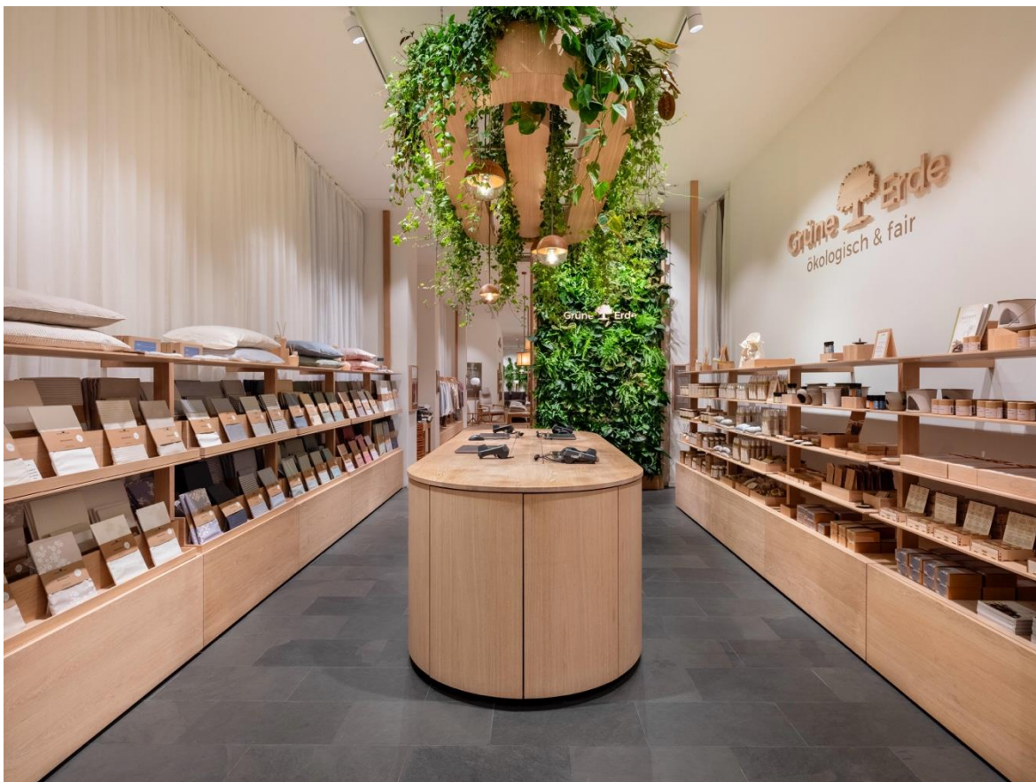
Below: The cashier counter, tucked away and concealed by greenery at the back of the store.