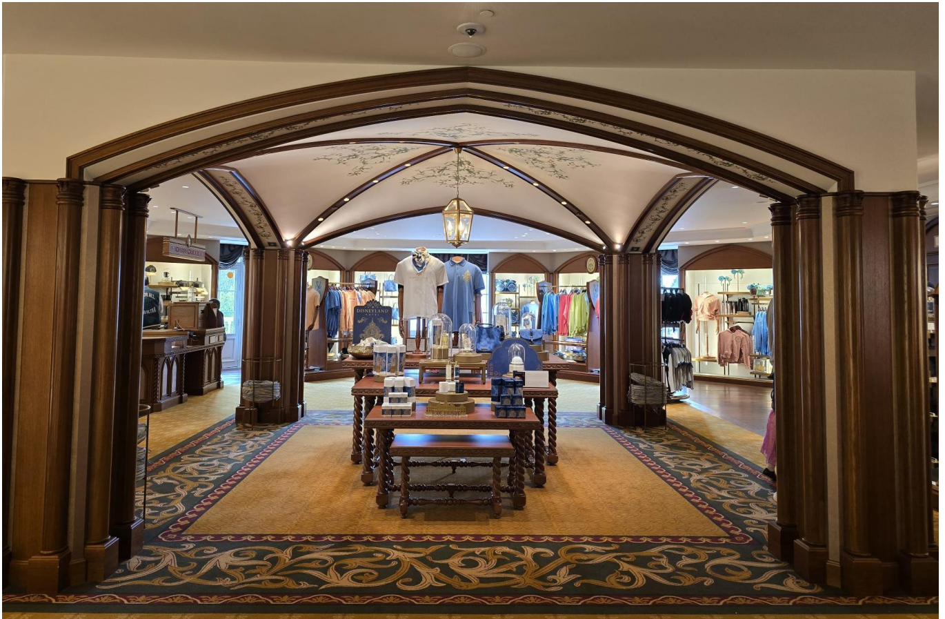
Hotel Interior 4