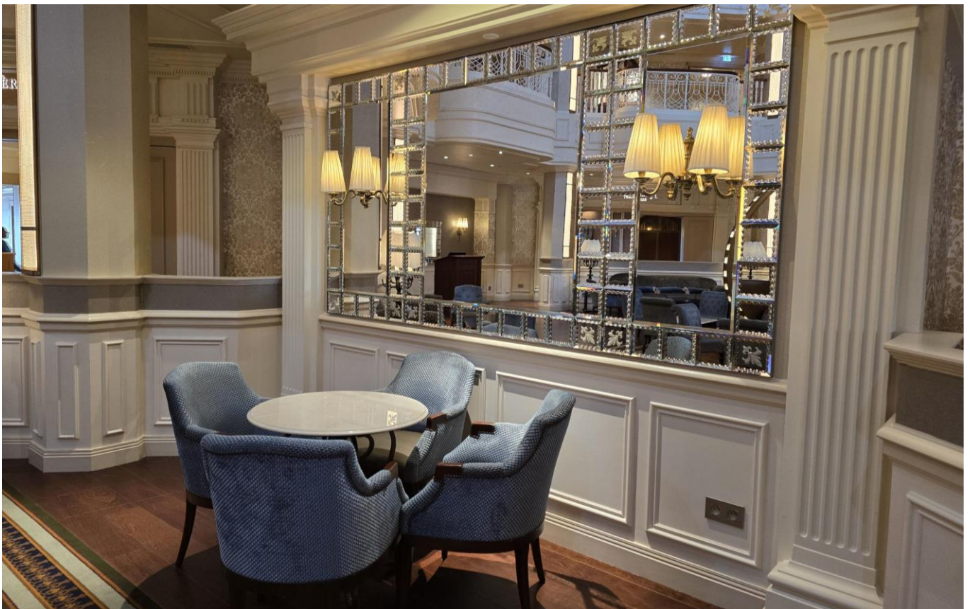
Hotel Interior 3