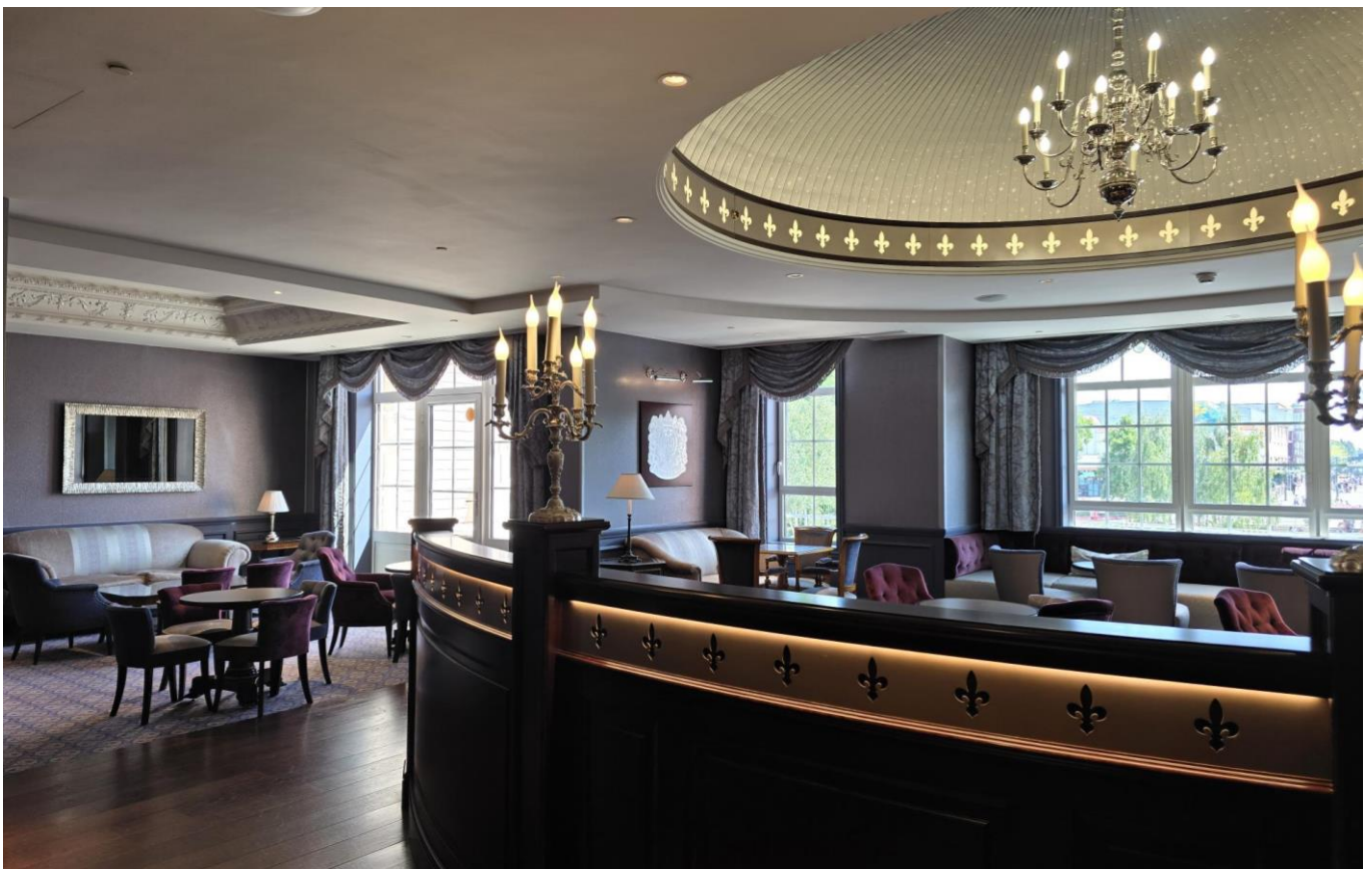
Hotel Interior 5