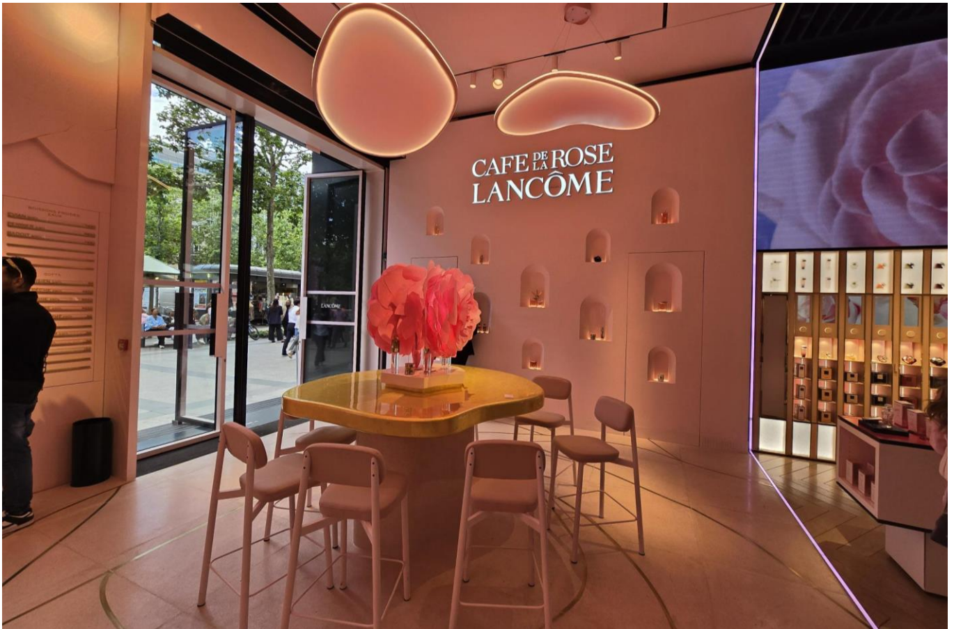
Store Interior 2