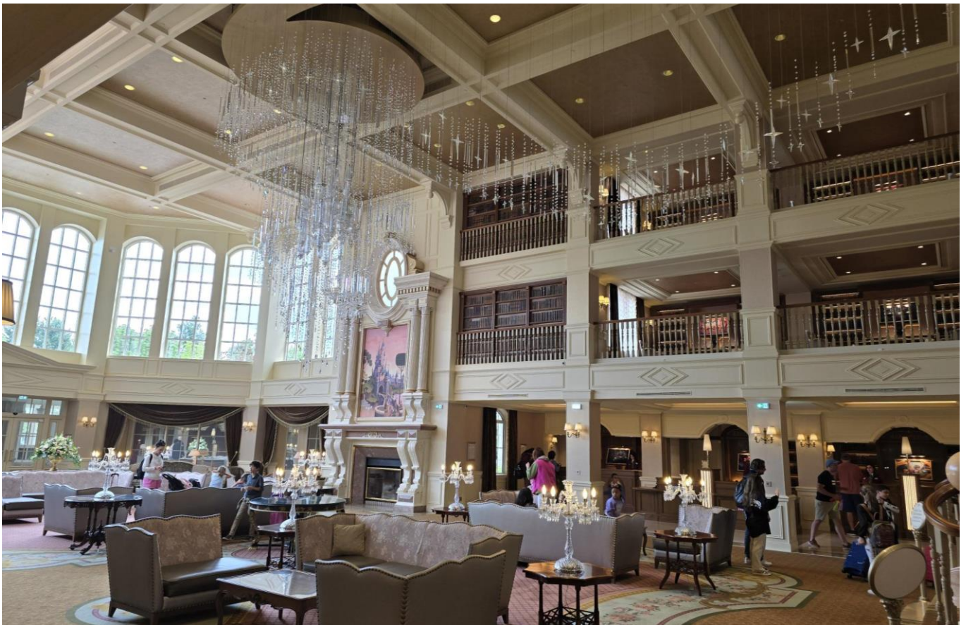
Hotel Interior 1