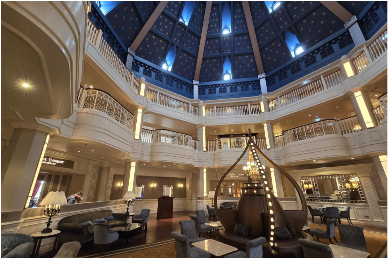
Hotel Interior 2