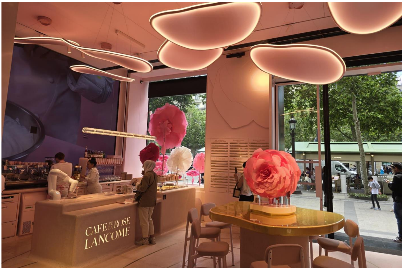
Store Interior 1