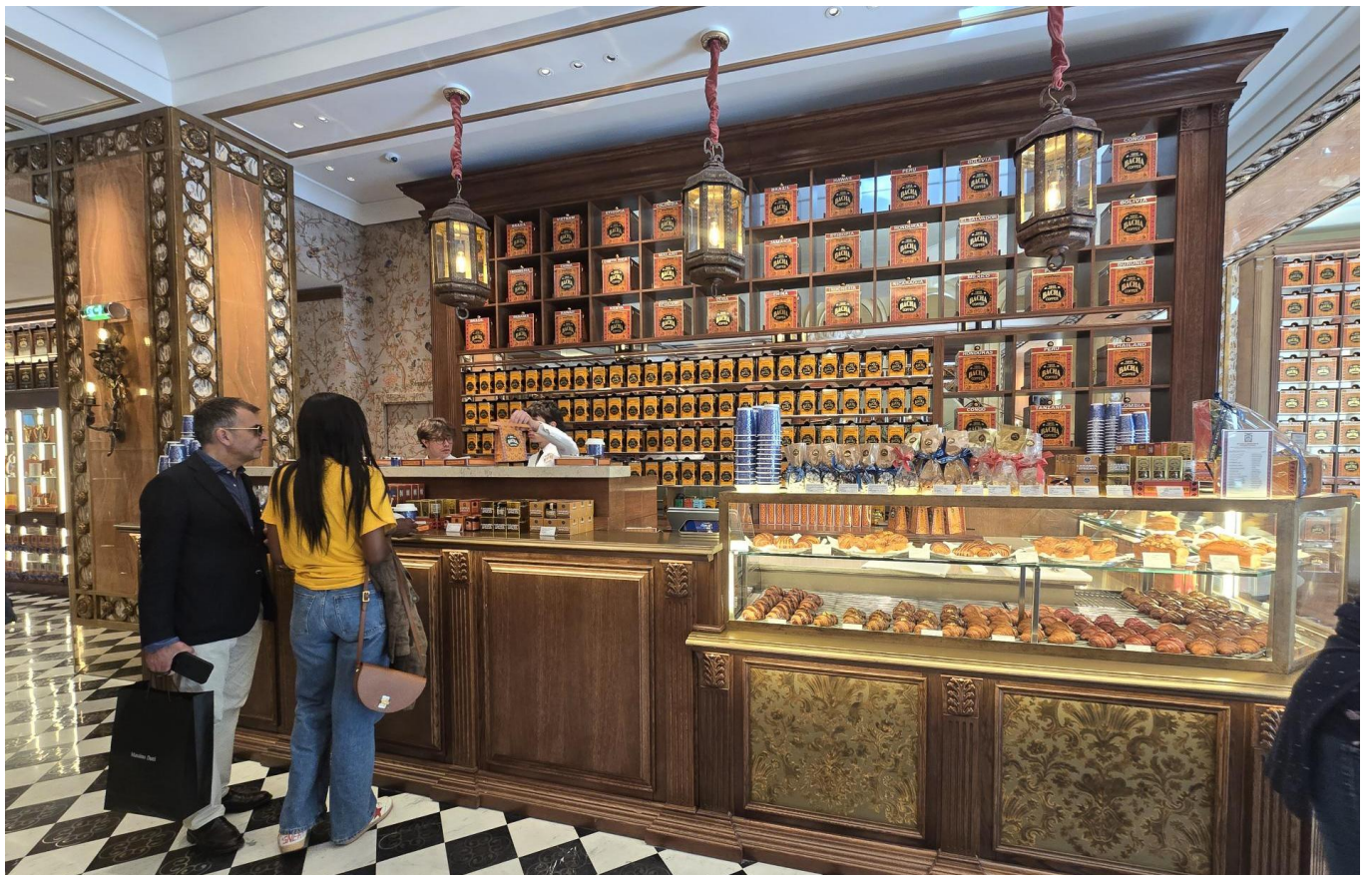
Store Interior 3