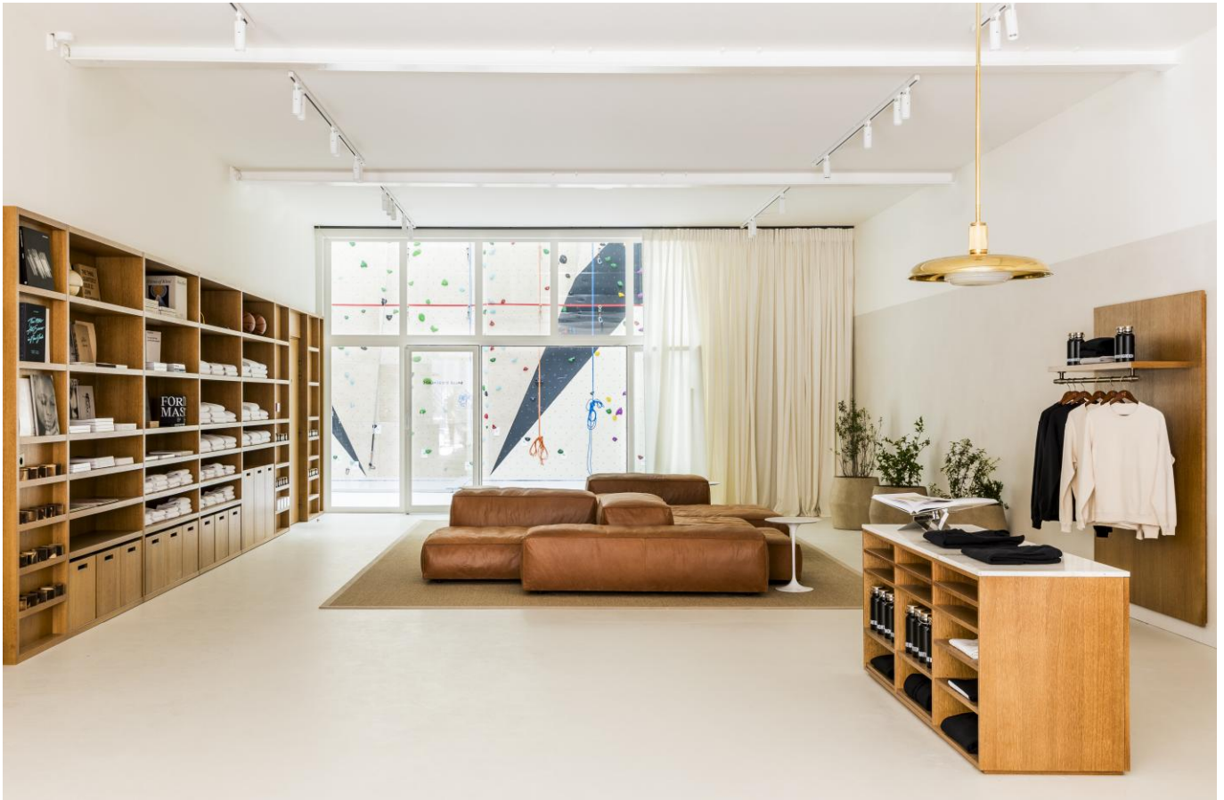
Sports Club 1