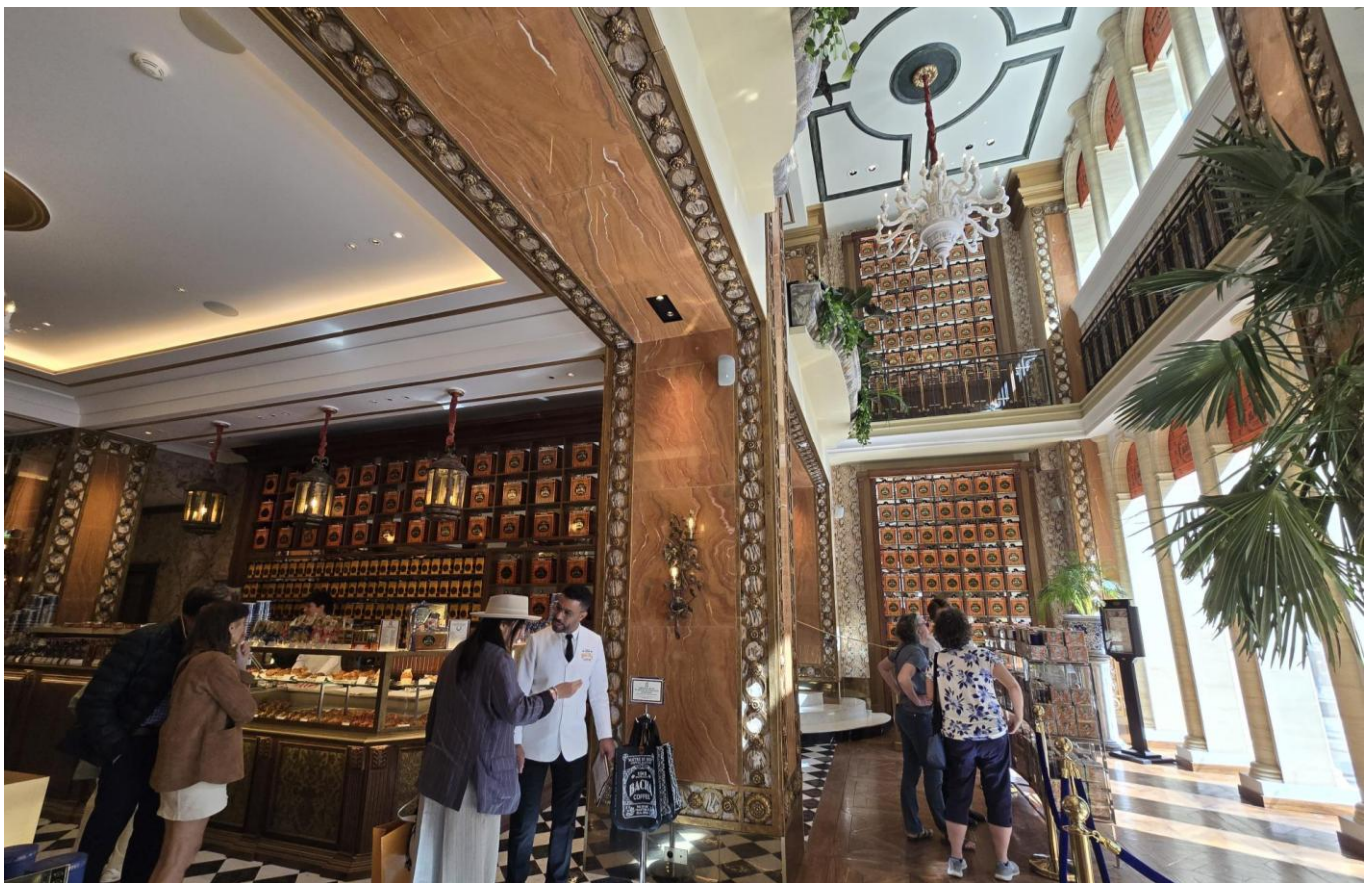
Store Interior 1