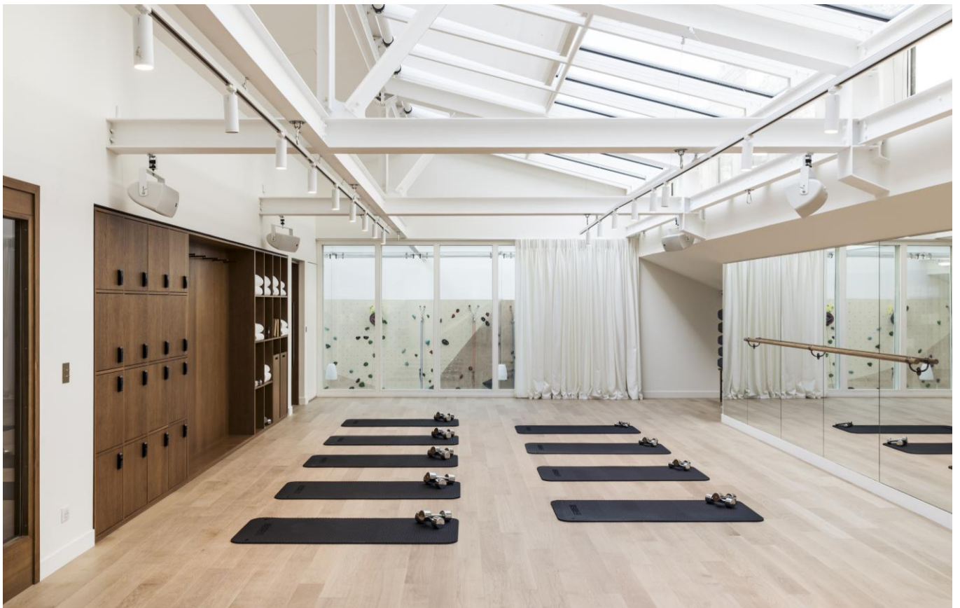
Sports Club 2