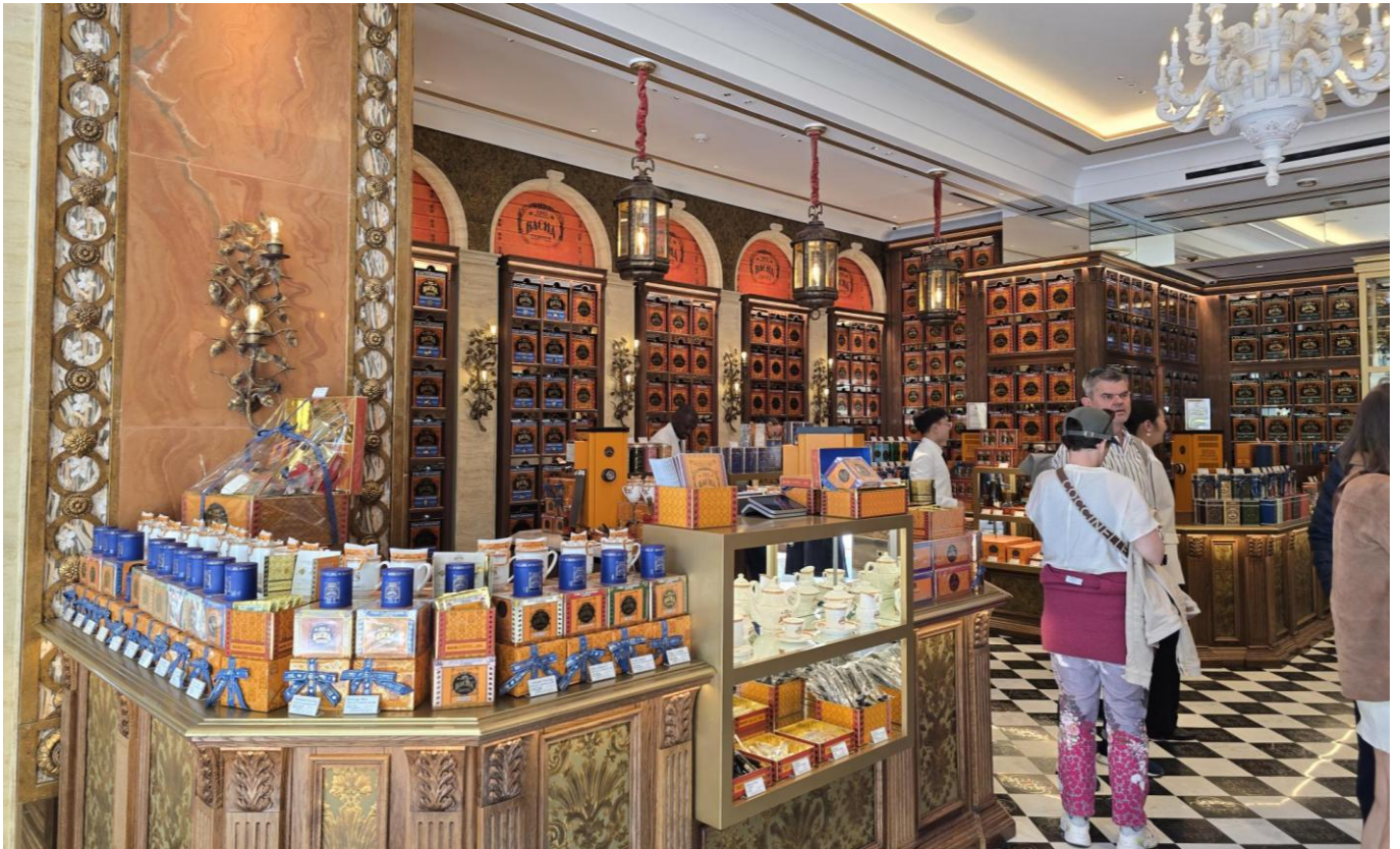
Store Interior 2