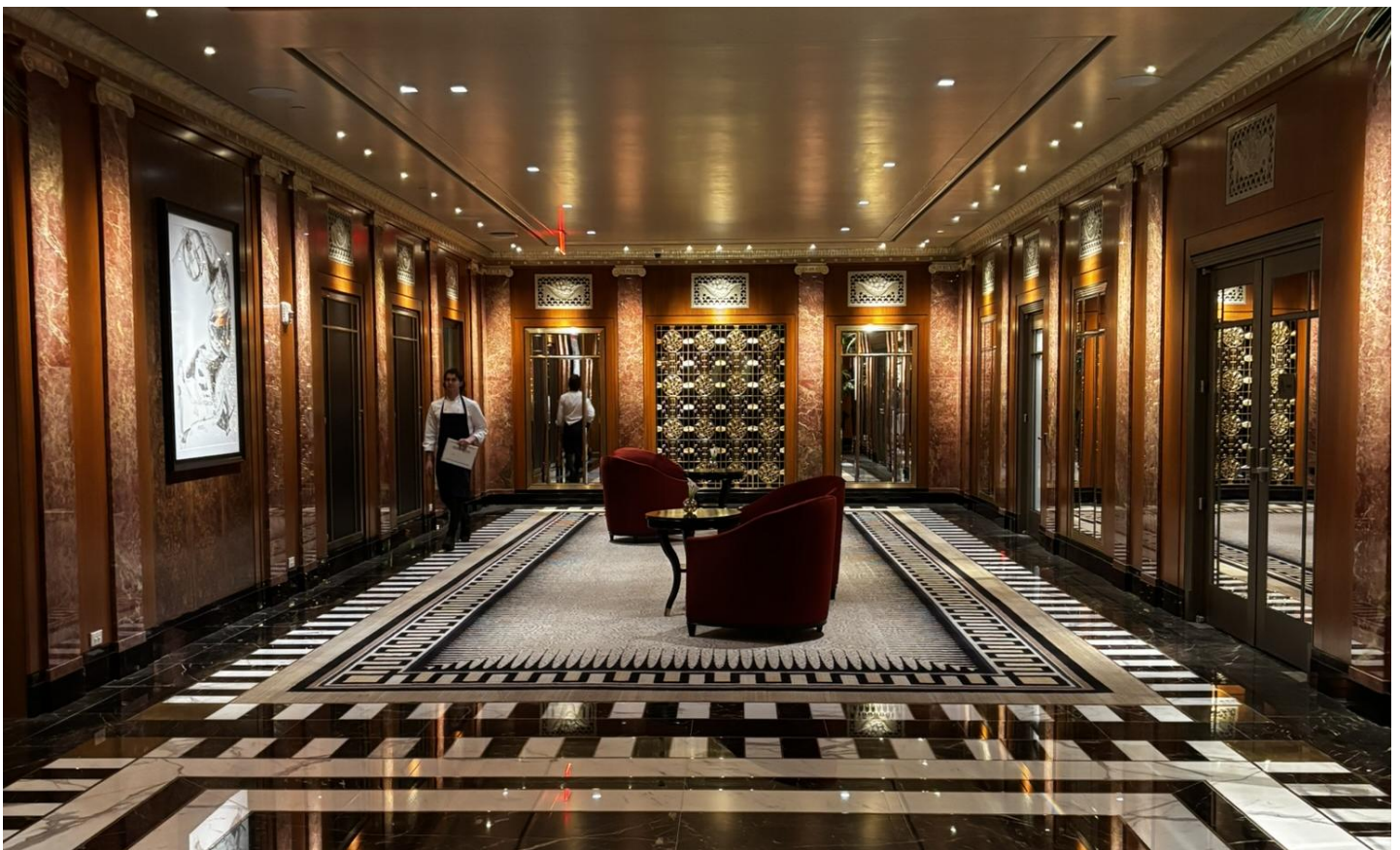
A design that blends classic and modern styles