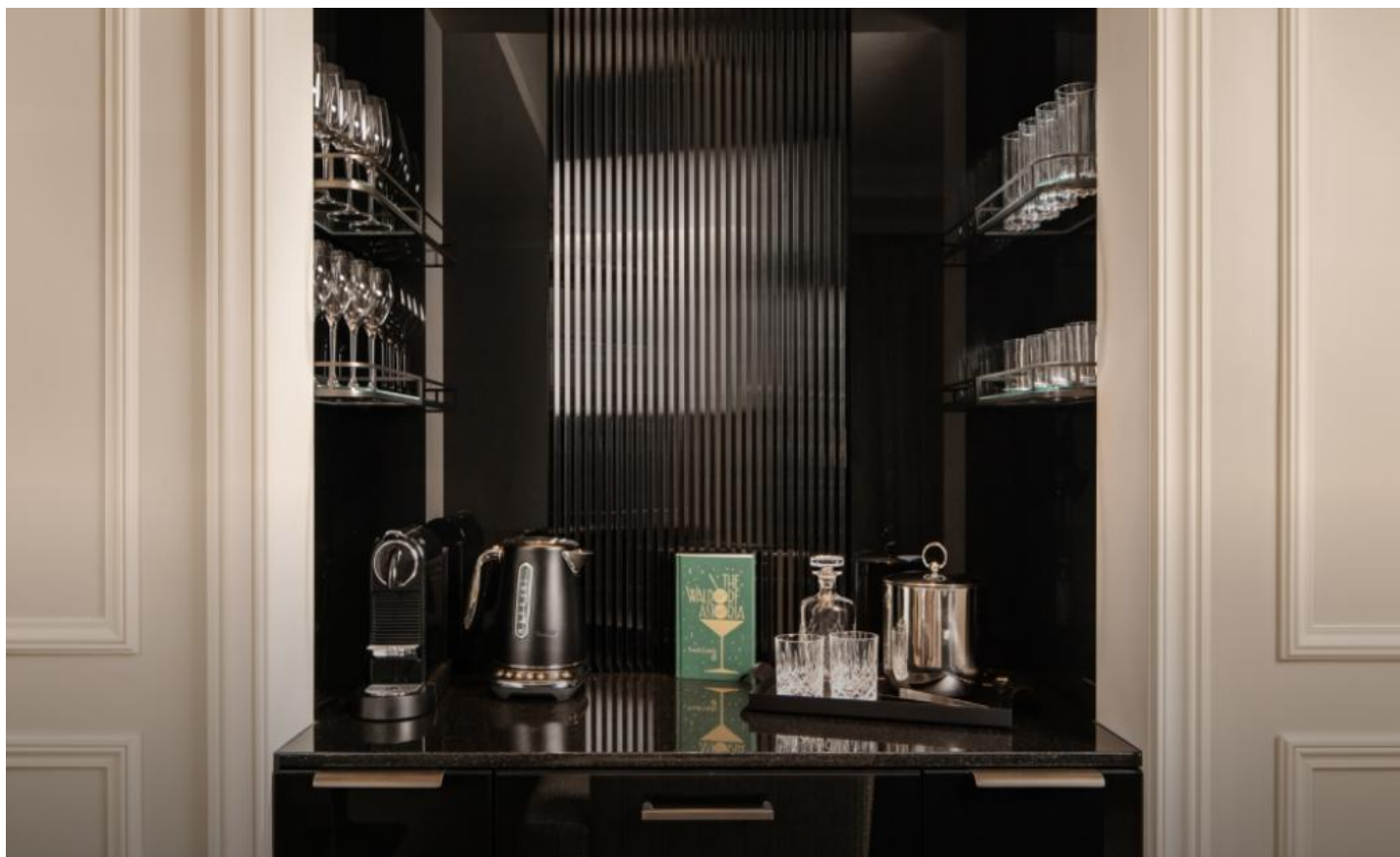
Suites are equipped with a private bar corner