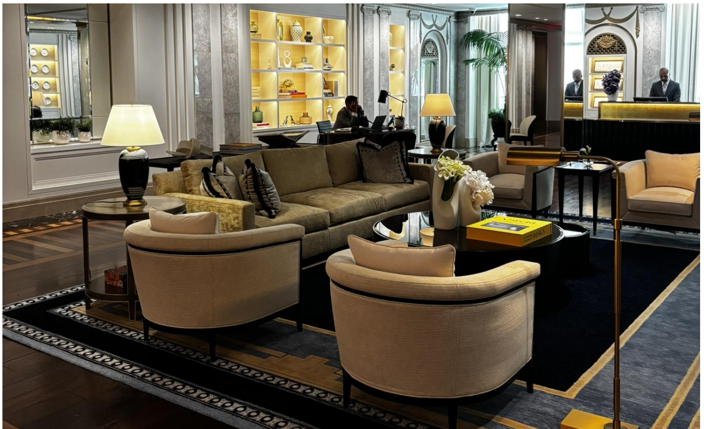
The lounge area is spacious and comfortable.