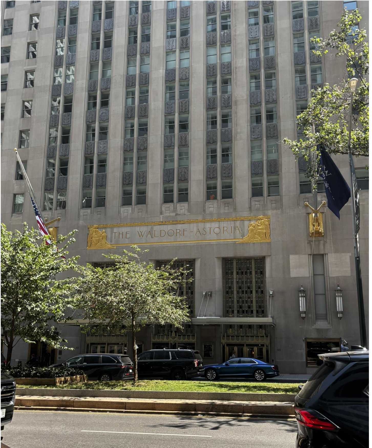
The iconic Waldorf Astoria hotel, located in Midtown among rows of office buildings.