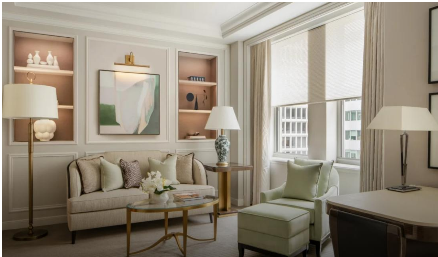
Guest rooms feature simple, modern décor and a comfortable atmosphere