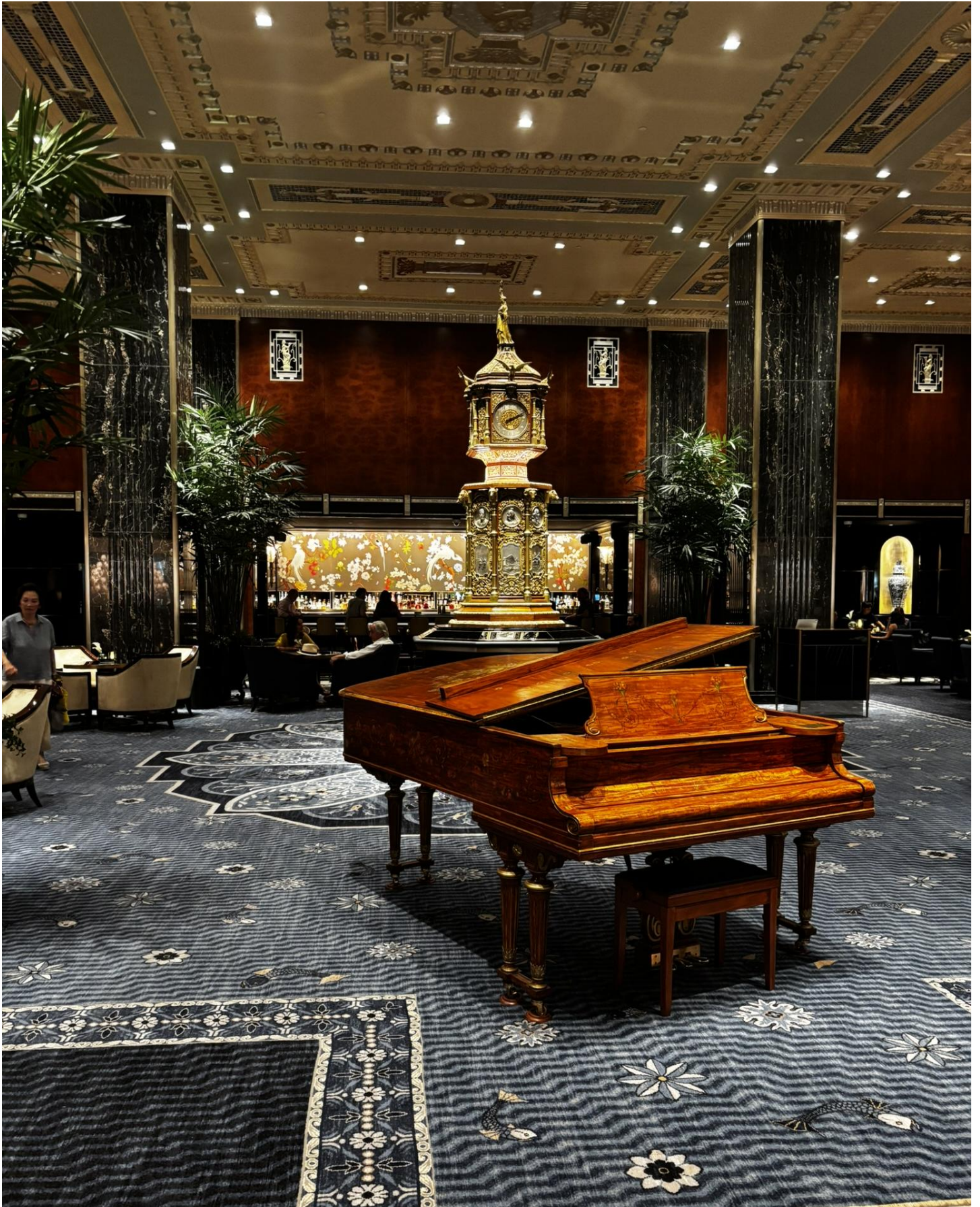
The bar area features a large clock gifted by Queen Victoria; as well as a Steinway piano beloved by composer Cole Porter.