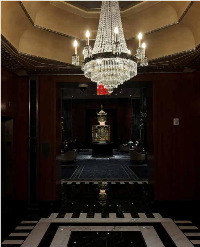
Gorgeous Art Deco chandelier