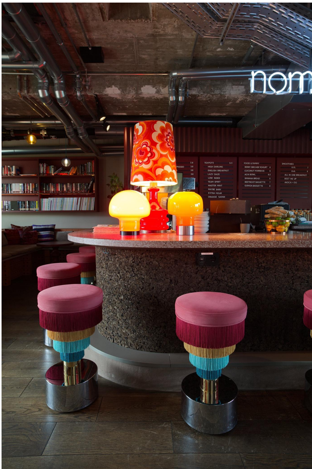
Nomad Day Bar features velvet and fringe stools and floral-patterned lighting for a retro vibe. An upcycled cork counter adds a sense of solidity.