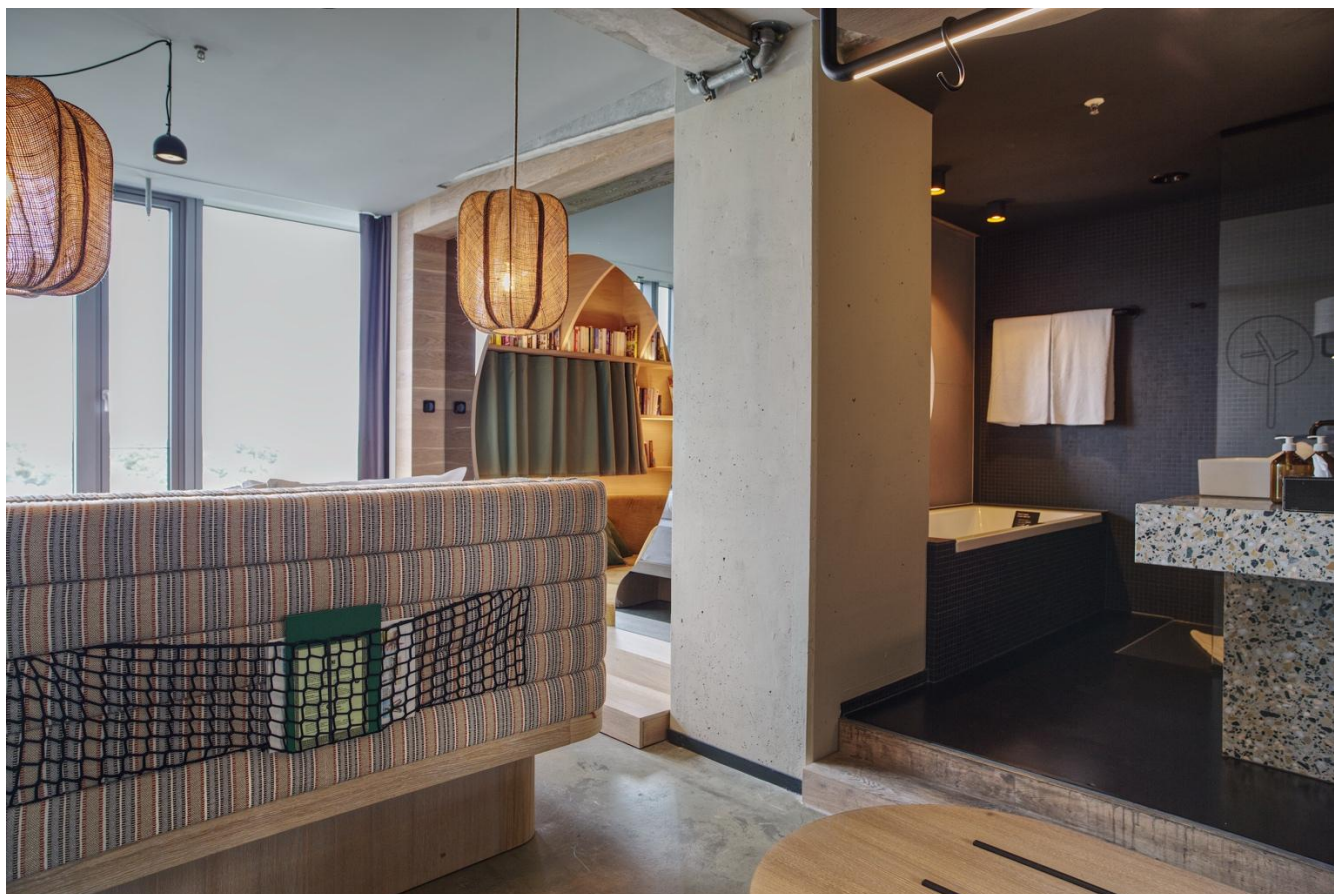
A bed crafted from JAB's uniquely textured fabric. Features a mesh pocket on the back. Free rental bicycles also serve as interior accents.