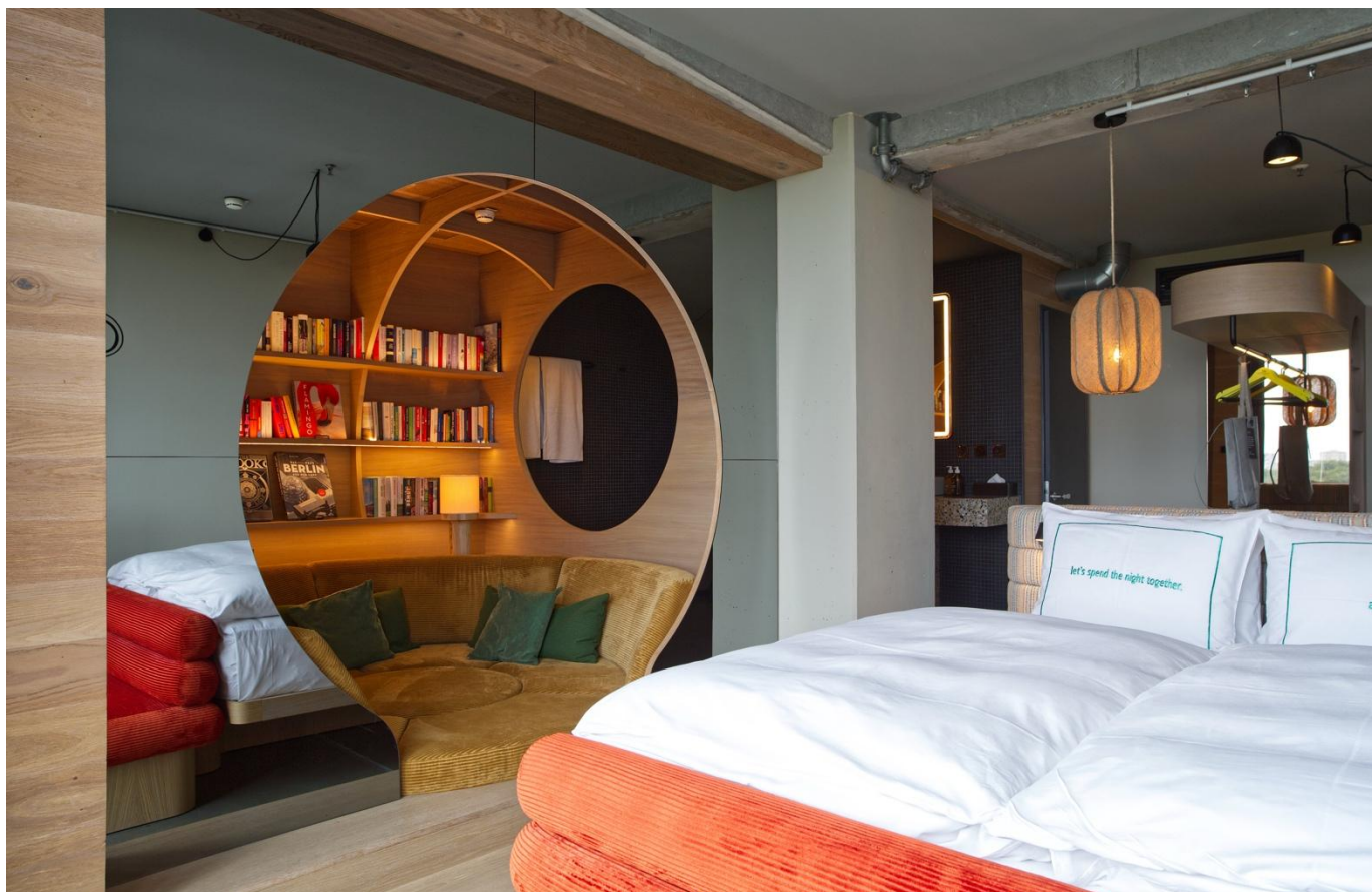
A newly installed reading corner in every suite. Behind a circular cutout mirror lies a spherical bookshelf and sofa, creating a secret hideaway.