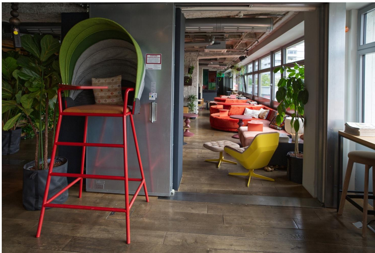
Furniture with a pop aesthetic, combining polyurethane foam and iron frames. The “meeting room” in the back is interestingly designed like a greenhouse, enclosed by colorful window panes.