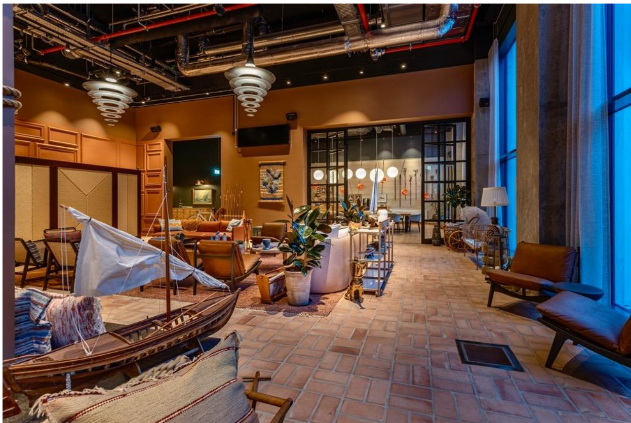
Interior spaces use light wood, muted coastal colors, brick floors, and maritime references, alongside reused and handcrafted elements.