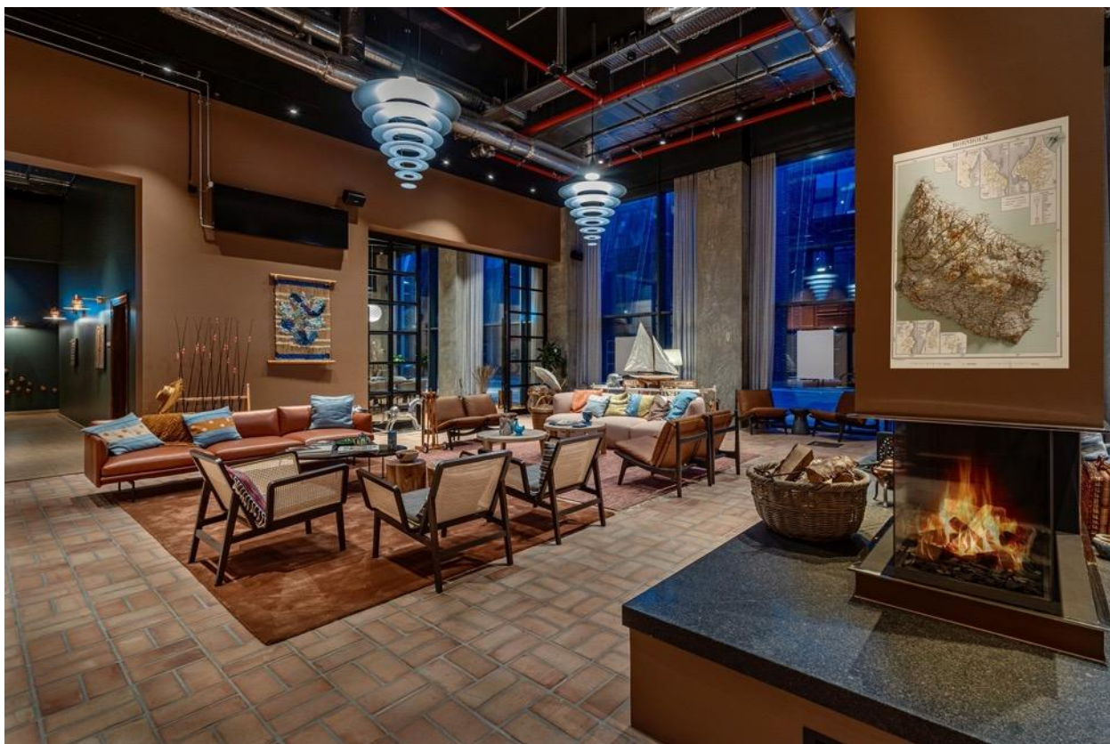
Murals by Danish artists are integrated into key areas.