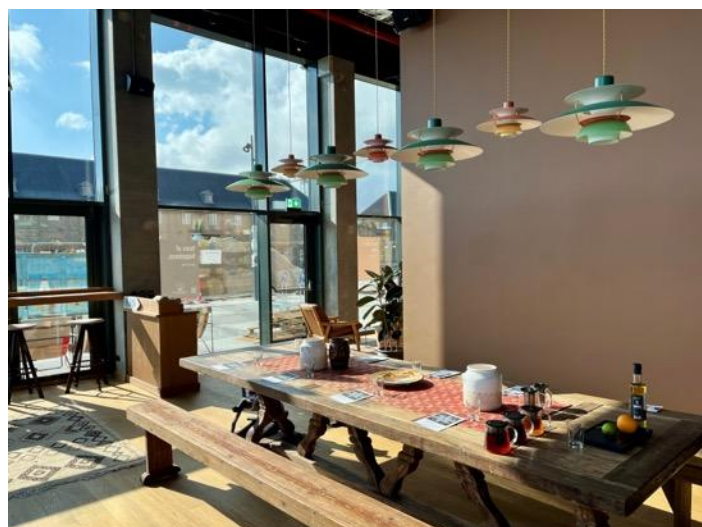
Nomad Day Bar, which opens onto a quay facing terrace and functions as an all-day gathering space.