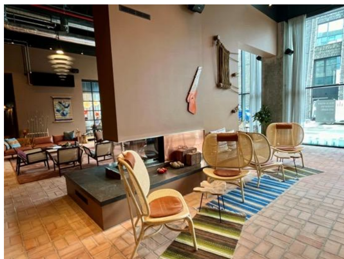
The overall design emphasizes a residential, informal atmosphere while retaining visual links to the site's industrial past and waterfront setting.