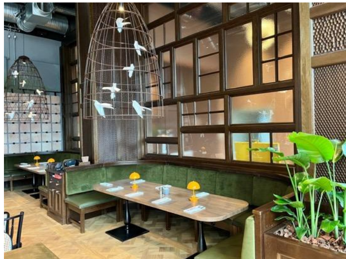
Public areas include the Tiger Lily restaurant, whose interior references traditional food markets through wood detailing and decorative origami elements.