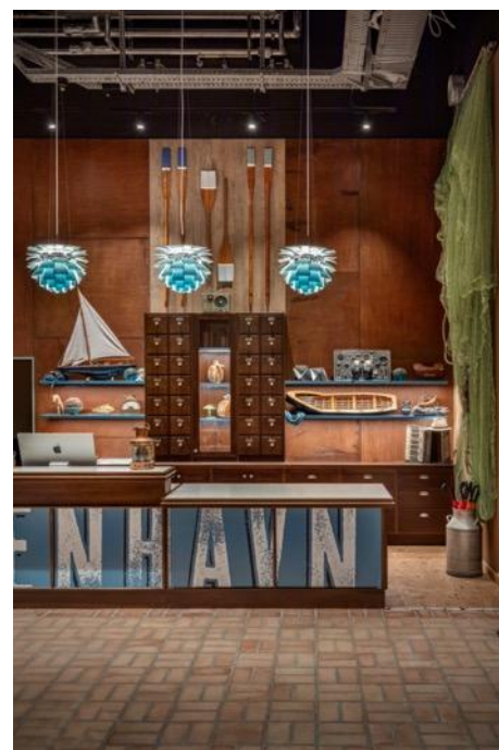
The lobby includes reclaimed materials, rustic metals, flea market objects, and artworks that reflect the site's harbor history.