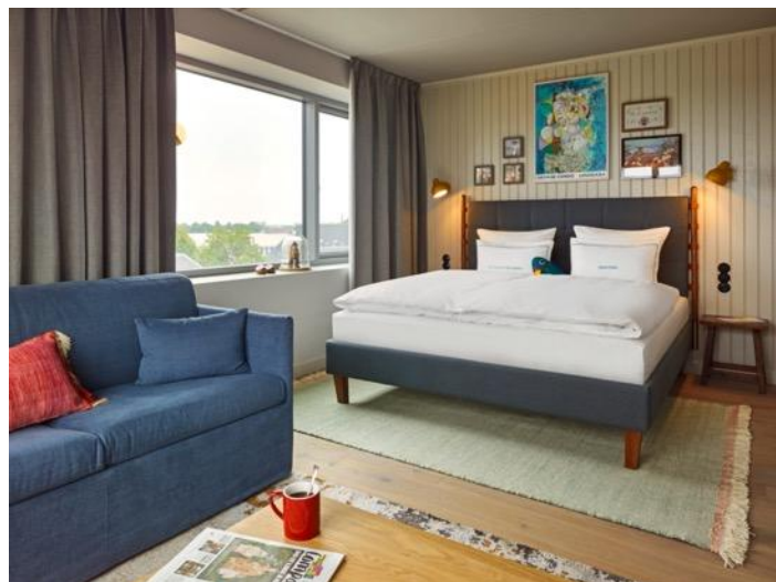
Guest rooms feature wood paneling, stick back chairs and collage style wall art.