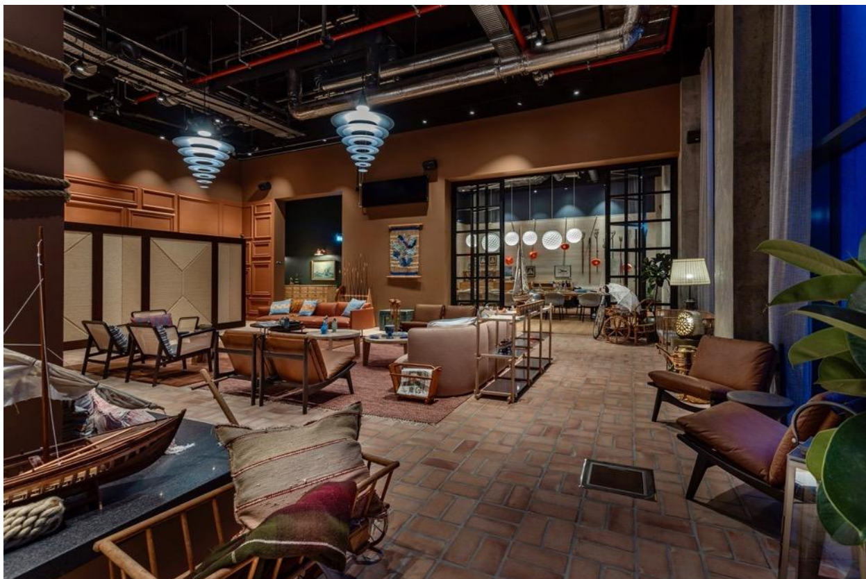
The interiors were designed by Swedish studio Stylt Trampoli with inspiration drawn from Scandinavian summer houses.