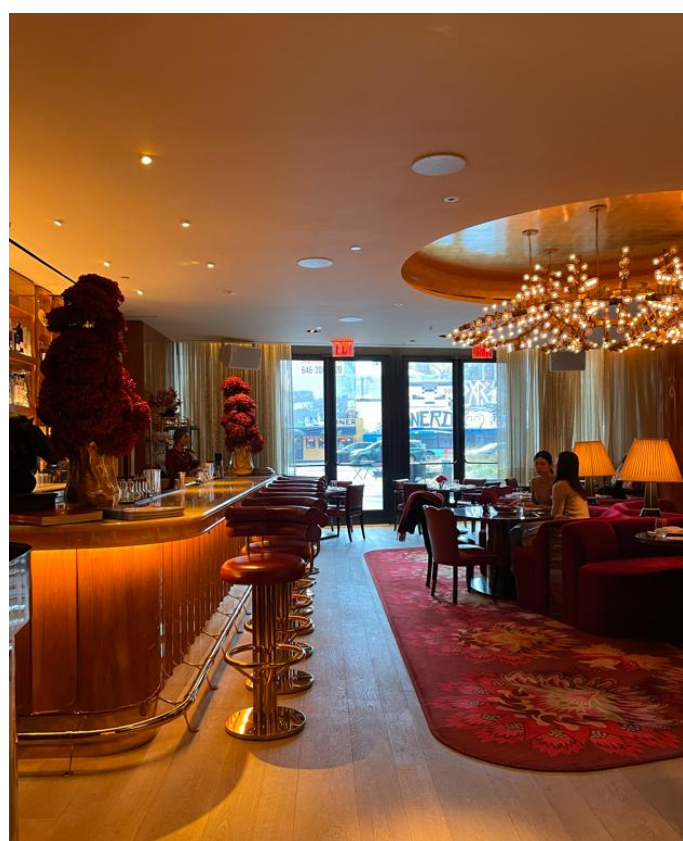
A bar area that is also popular with non-guests