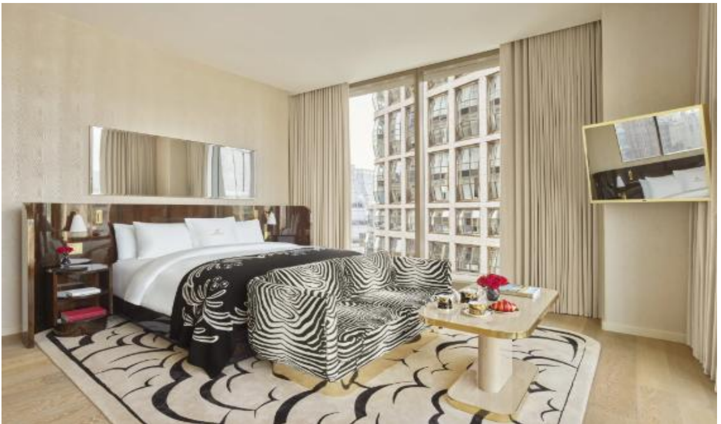
Interior design featuring safari-inspired animal prints