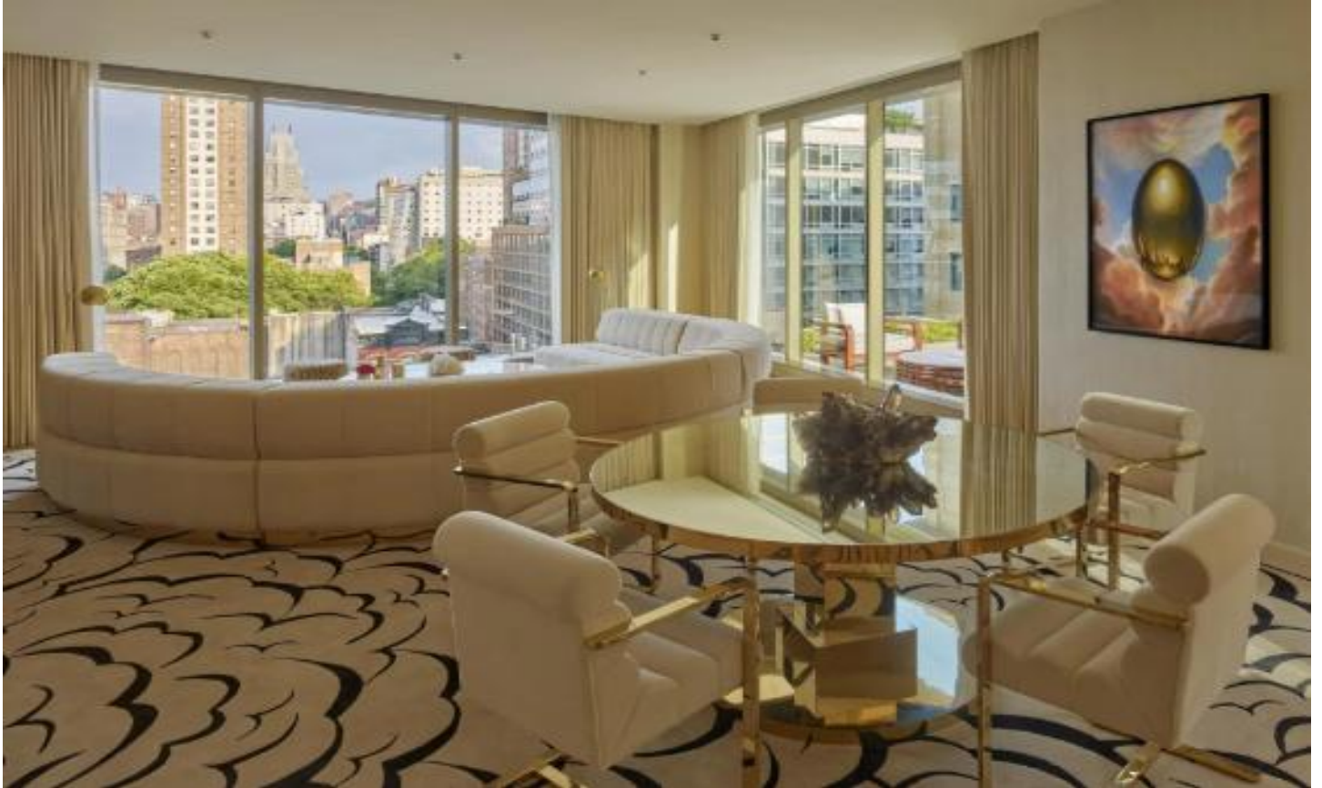
Guest rooms with floor-to-ceiling windows that create a sense of openness