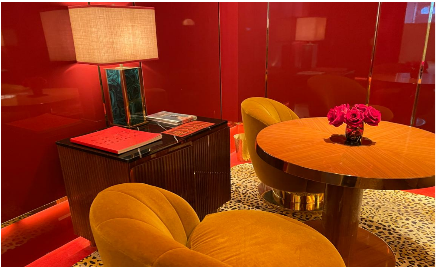
Front Lobby Area