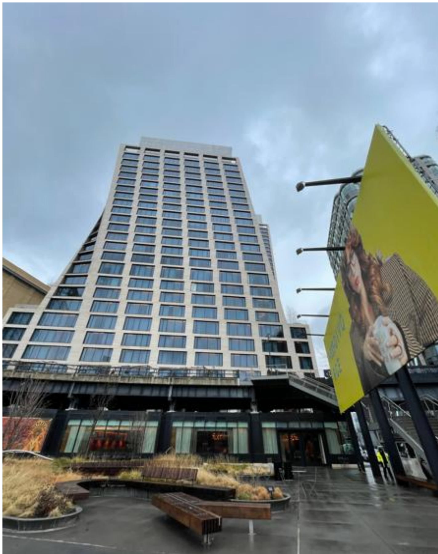
A hotel adjacent to the popular tourist destination High Line Park