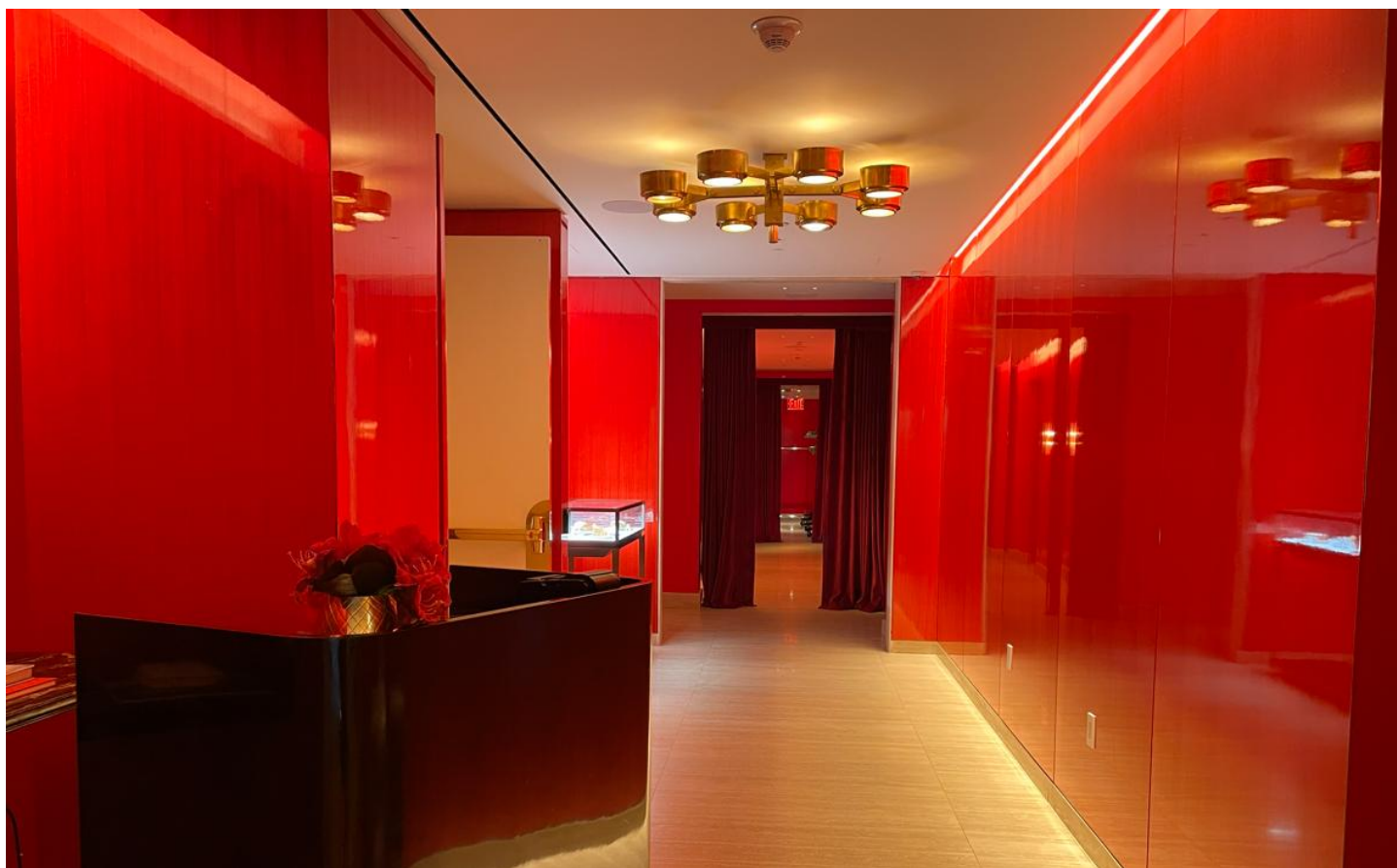
A dramatic red lobby