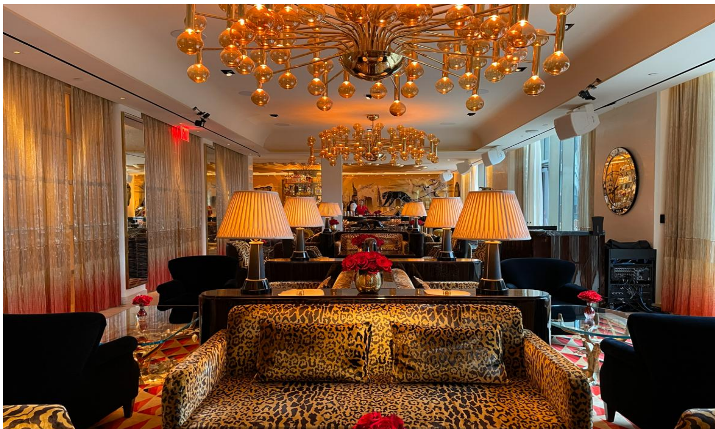
The design varies across each area—the lobby, first-floor restaurant, and second-floor bar.