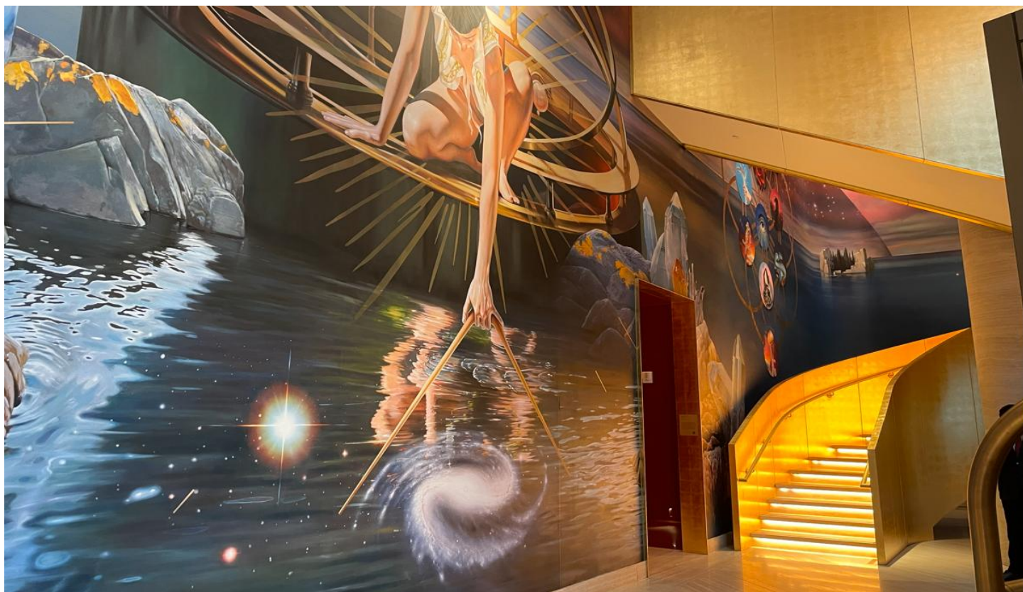
A large-scale mural by an Argentine artist