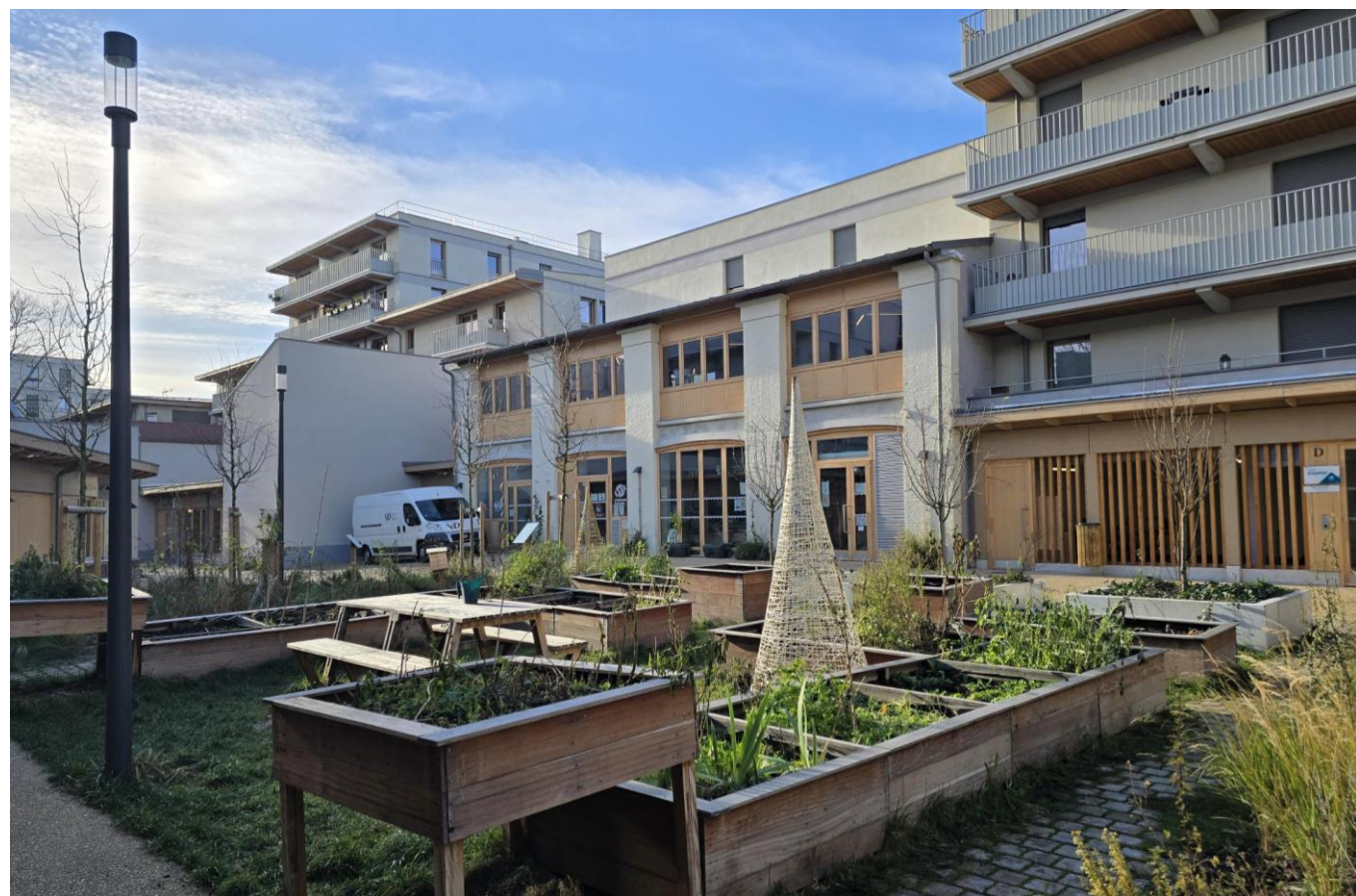
Inside the facility 5