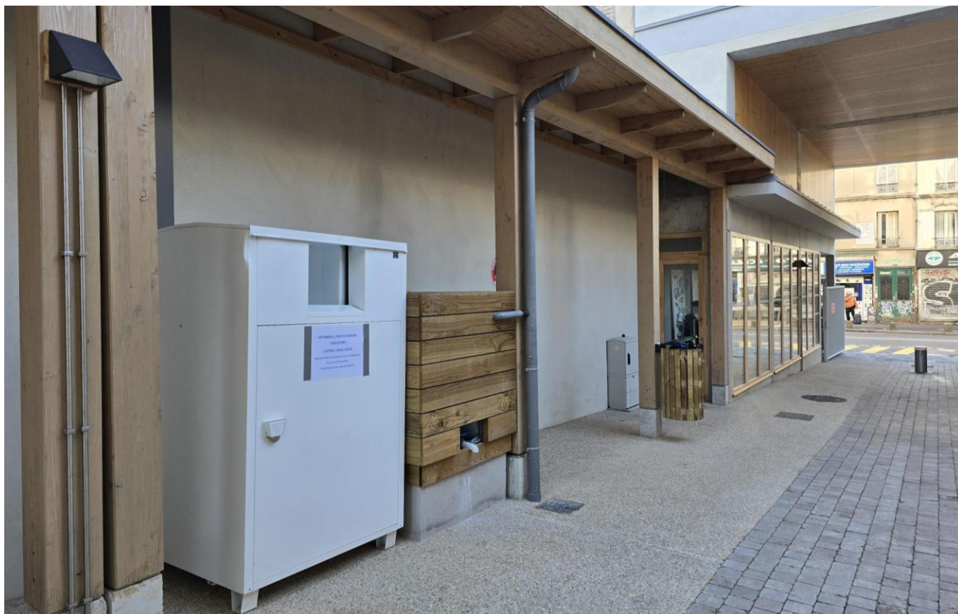
Inside the facility 3