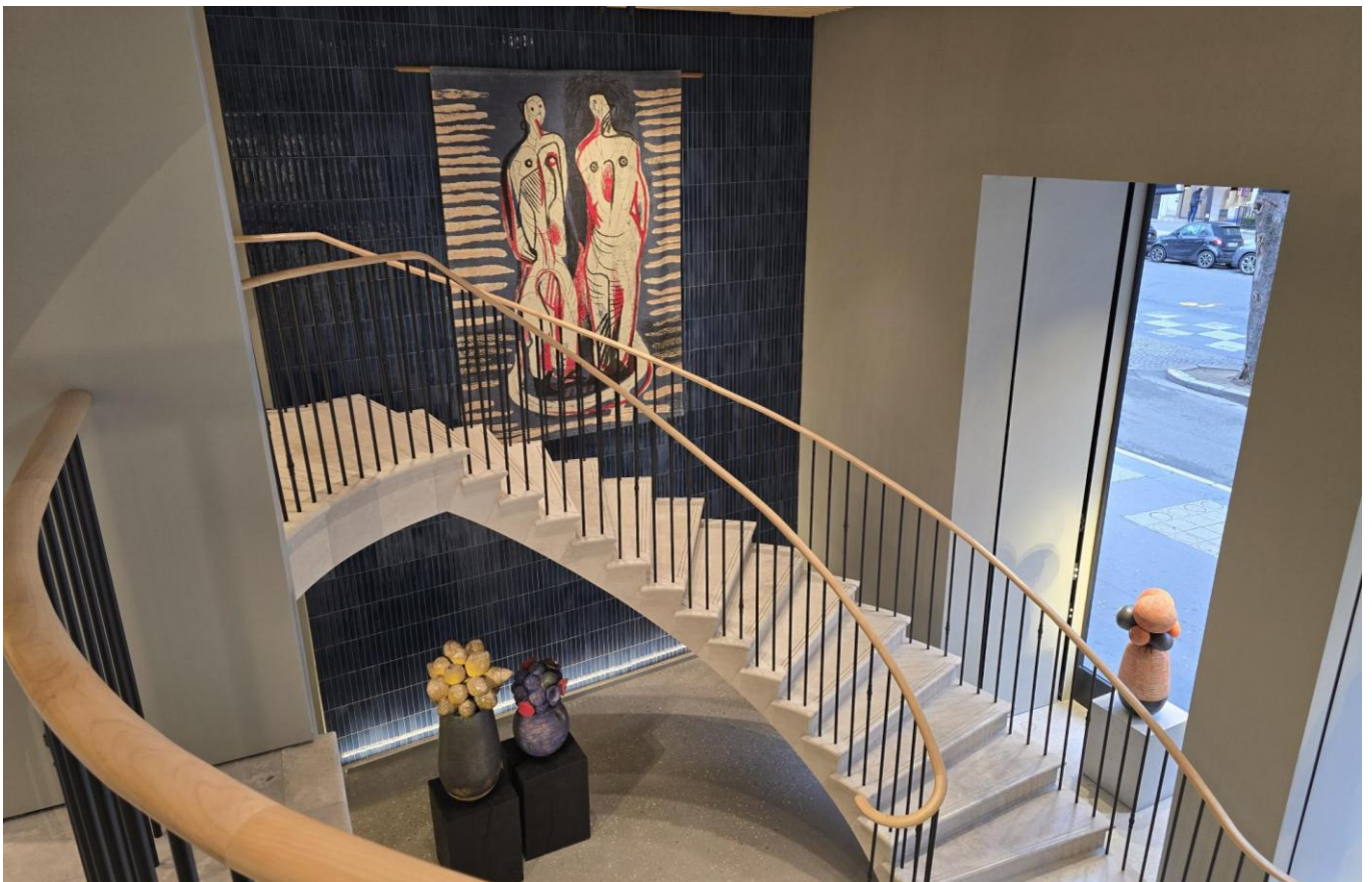
Store Interior 1