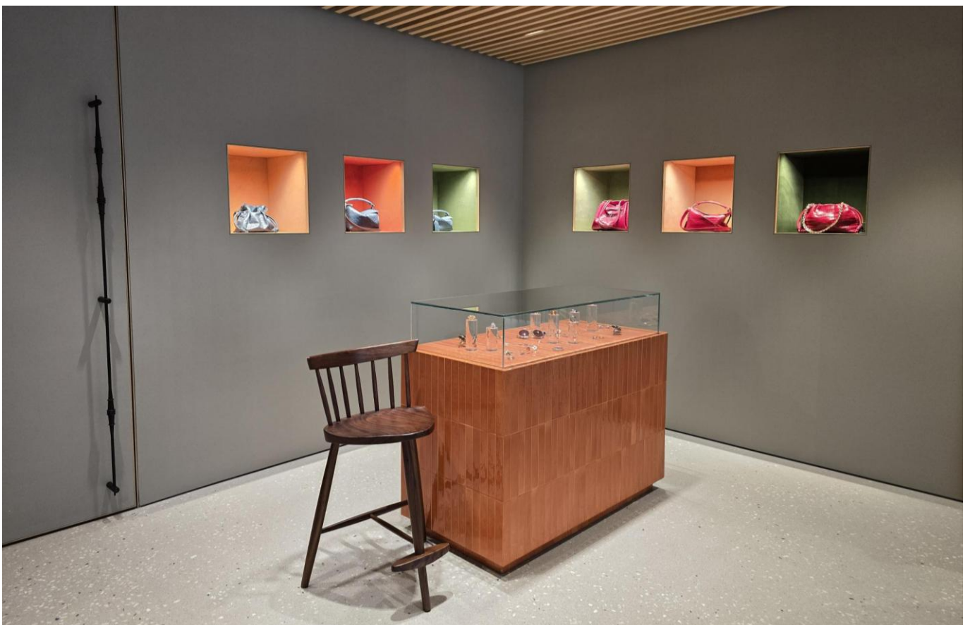
Store Interior 3