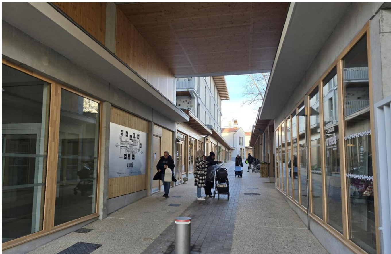
Inside the facility 1