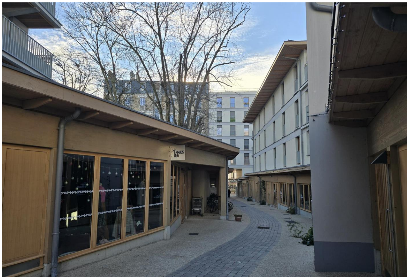
Inside the facility 2