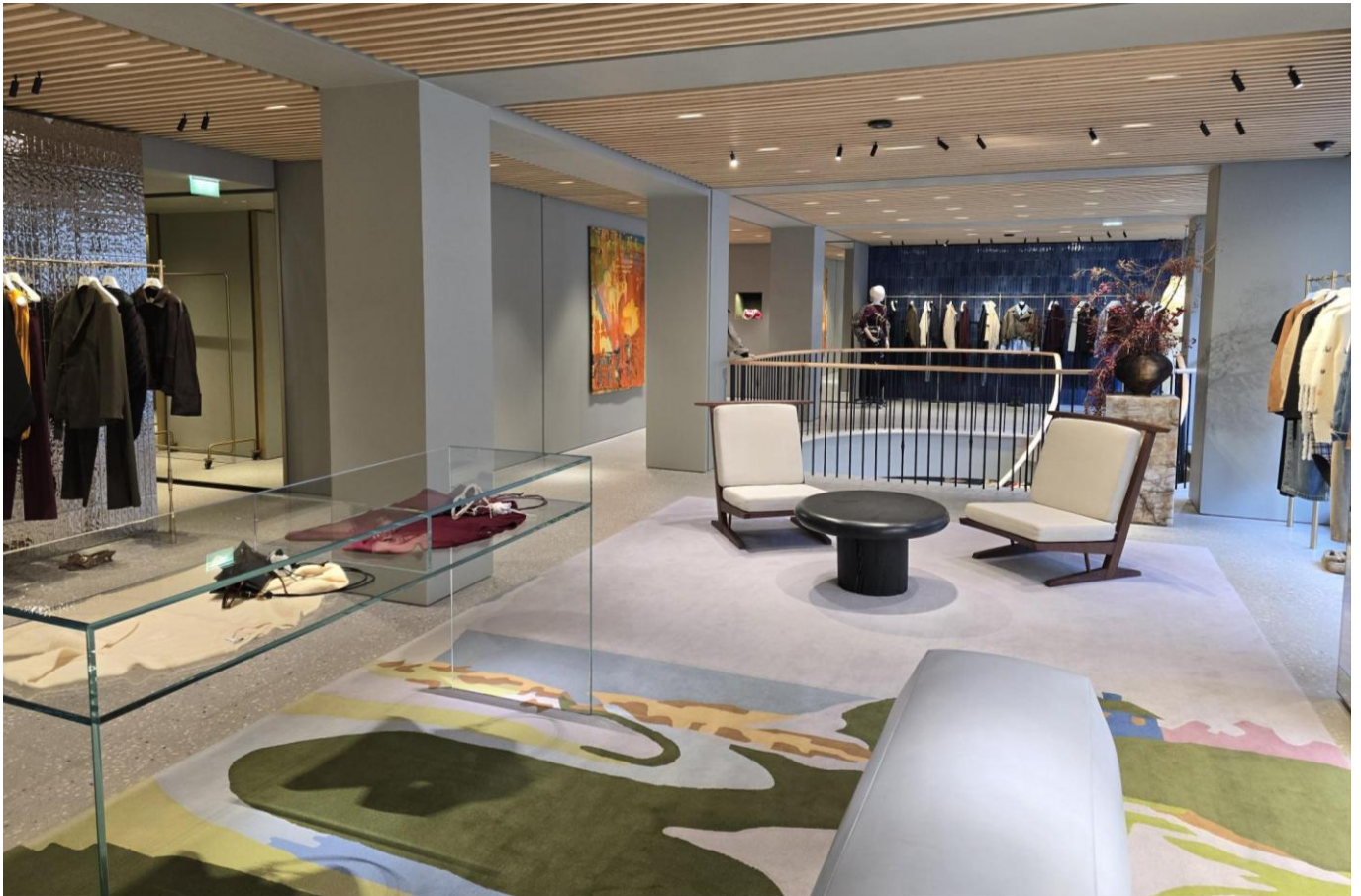
Store Interior 2