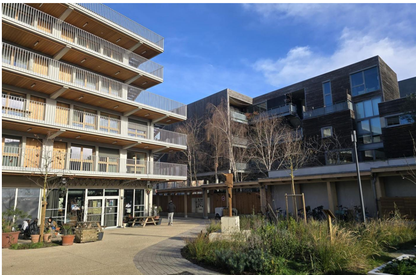
Inside the facility 4